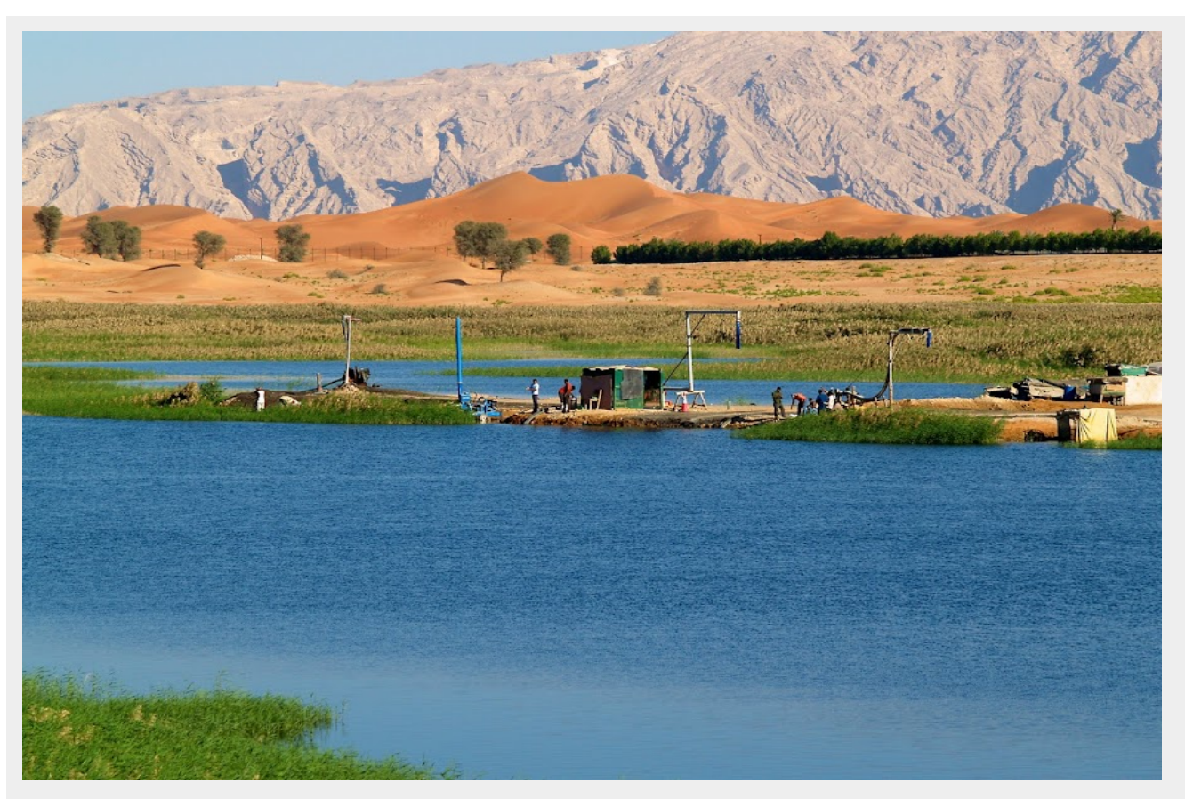
Can you believe this is in the UAE? People fish on the weekend from the pump stations hurriedly set up along the western shore. All around the lake are gentle rolling dunes.