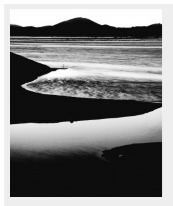
Al Ain Lake - click to see a larger image.

Please read the original article: A gentle romp from Devil's Plunge across the red sand dunes to Quad Lake, just on the outskirts of Al Ain. Published by The National, Dec 17, 2010.