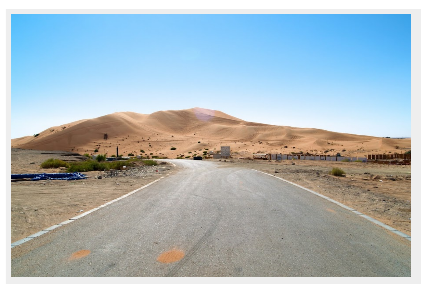
The starting point: an easily-accessible large sand dune on the western outskirts of Al Ain, in the district of Zakher, known to some expats as Devil's Plunge.