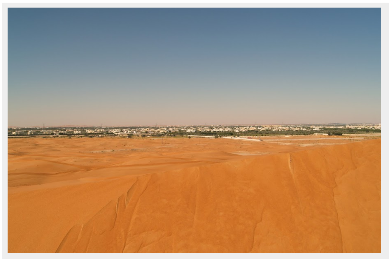
Al Ain city as seen from the top of Devil's Plunge. The sun sets behind the lake and Jebel Hafeet (not in this photo) making a wonderful shot for photographers.