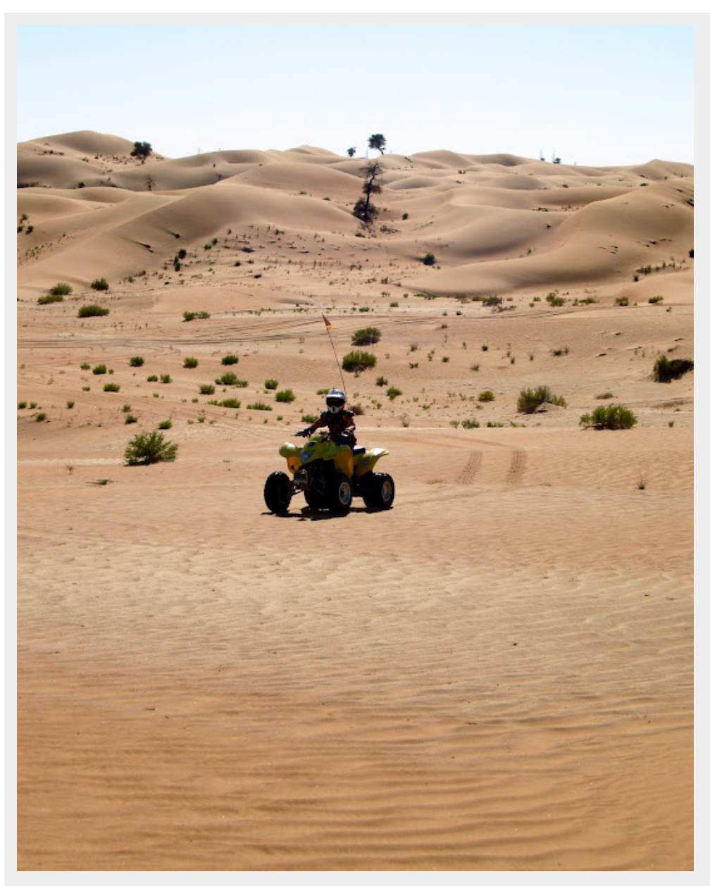
The Suzuki Quadrunner 250 comfortably negotiates sand dunes and the area offers flat sand, gentle rolling dunes, as well as a very tall and steep dune - so riders of different abilities will enjoy this trip.