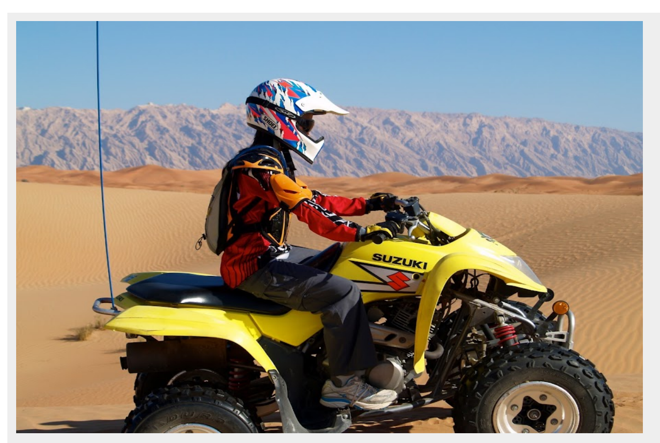
Wearing protective gear is important for riders of all ages, as is instruction and common sense. The Suzuki Quadrunner 250cc is an ideal starter bike as it is both smooth and powerful so that it does not need to be run at full gas like the 50cc quads, which wrongly encourages new riders to scream around at full blast all the time.