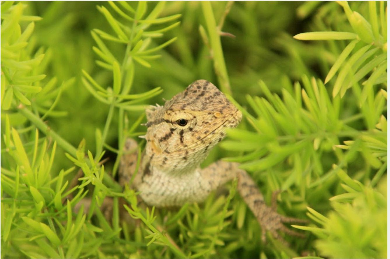
A young gecko peers out from a verdant fern

Please read the original article: Driving the Green Miles . Published by The National, Oct 10, 2010.