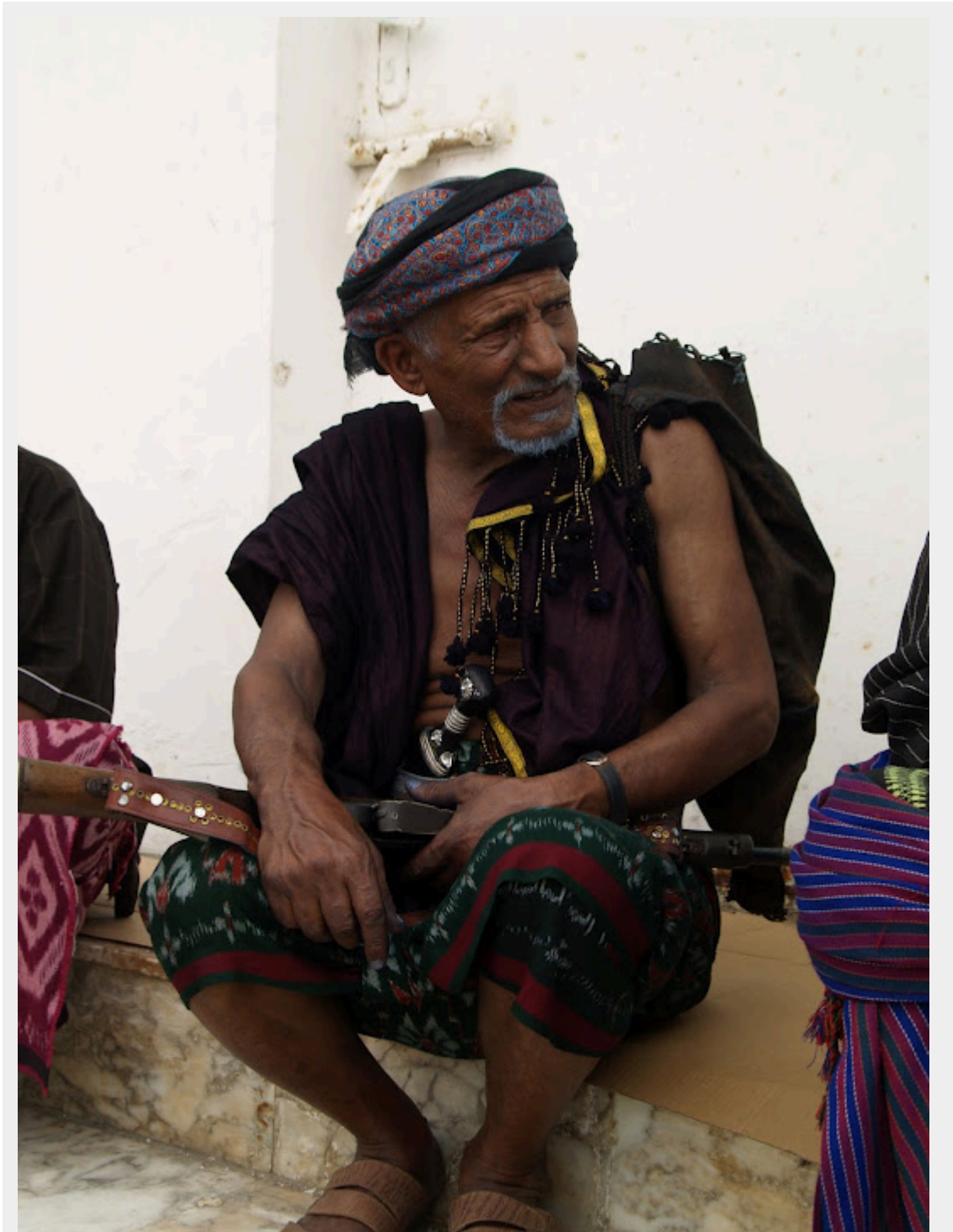
A Jebeli tribesman dressed in traditional clothing carries a curved knife and hunting rifle wherever he goes.