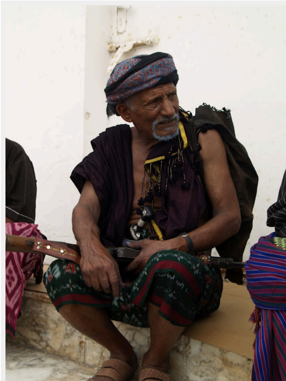
A Jebeli tribesman dressed in traditional clothing carries a curved knife and hunting rifle wherever he goes.