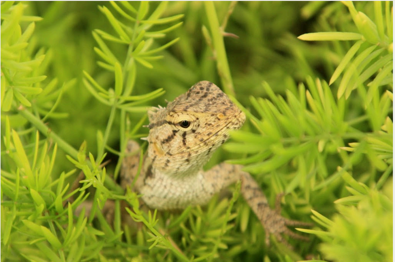
A young gecko peers out from a verdant fern

Please read the original article: Driving the Green Miles . Published by The National, Oct 10, 2010.