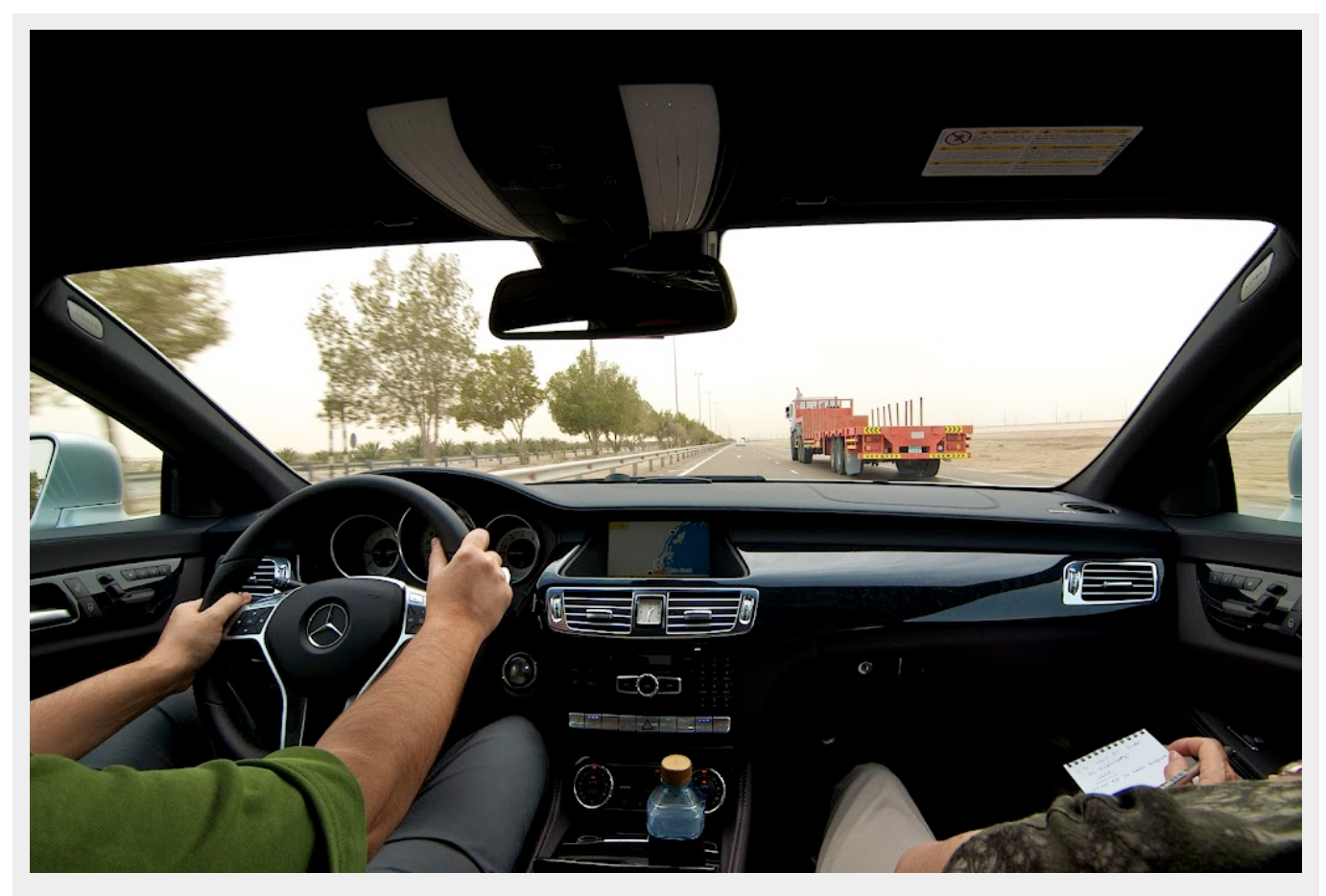
The Mercedes CLS 500 tamed the infamous E11 highway with non-challant ease.

If you were in the market for a top-of-the-line luxury vehicle, of the twin-turbo-charged V8 kind, then I would definitely suggest you visit the Mercedes dealerships (in UAE, there are separate ones by region: Mercedes Abu Dhabi and Mercedes Dubai) – you will find it one of the most advanced cars in terms of technological features.