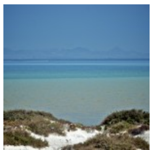
Click for a larger photo.