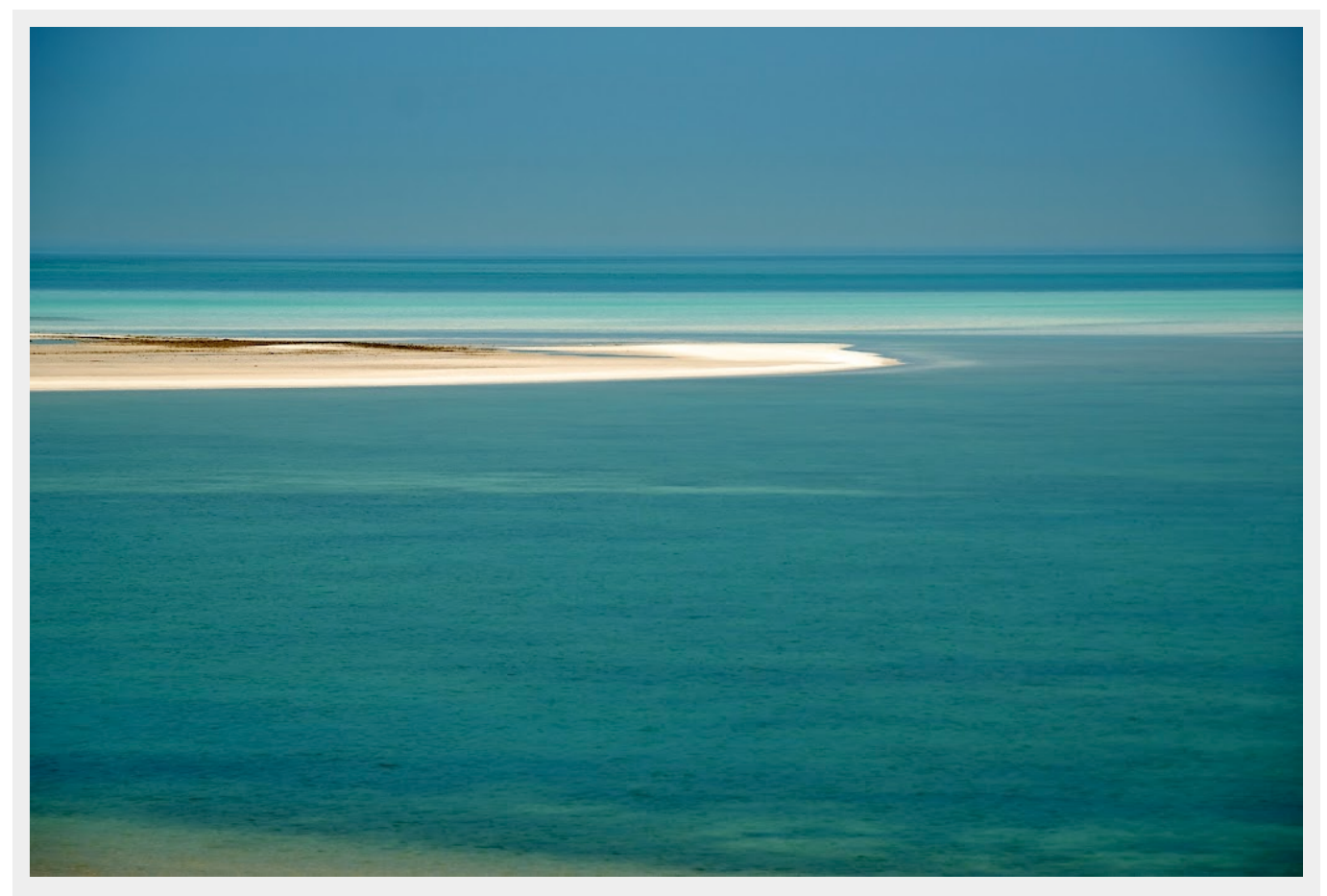
The Arabian Gulf as seen from the Al Ruwais shoreline.

This trip will take us west of Abu Dhabi, where rare open beaches compete with industrial installations, palatial weekend residences, five-star beach resorts, and ferry ports to the islands of Sir Bani Yas and Delma.