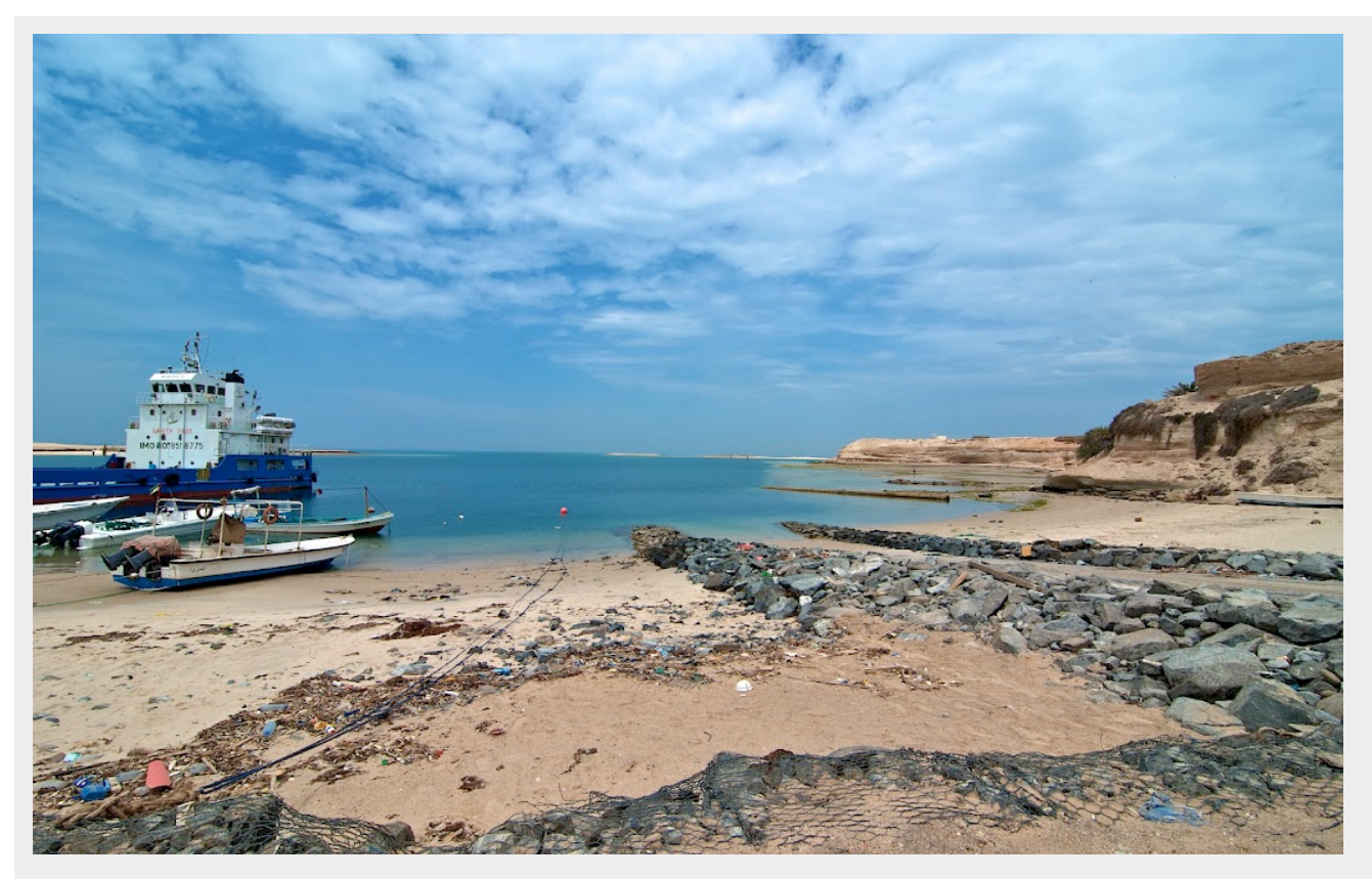
The ferry port to Delma Island is further west than the ferry terminal for Sri Baniyas Island.