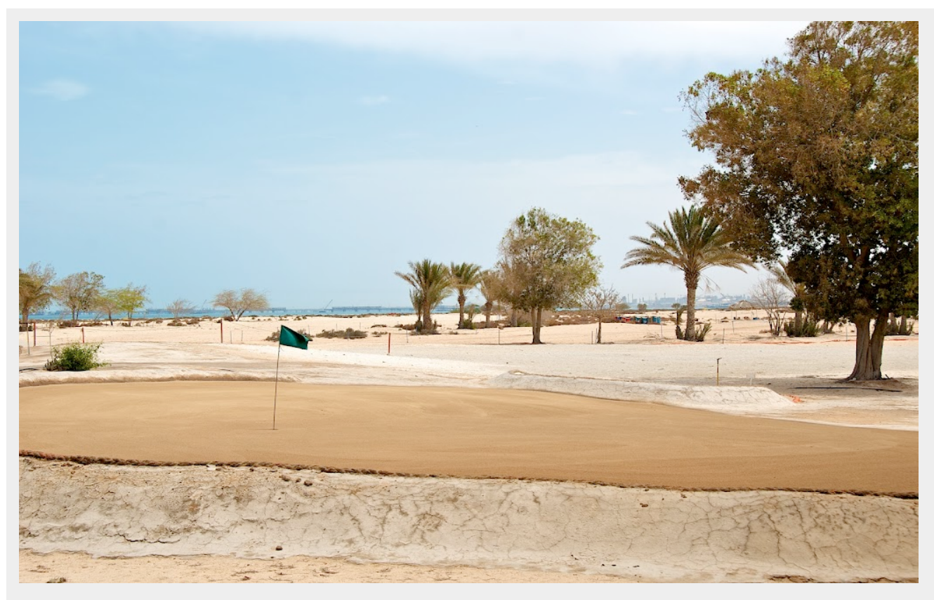
Something different: the Al Dhafra Golf Club proposes a sand course for avid golfers. The only grass is the