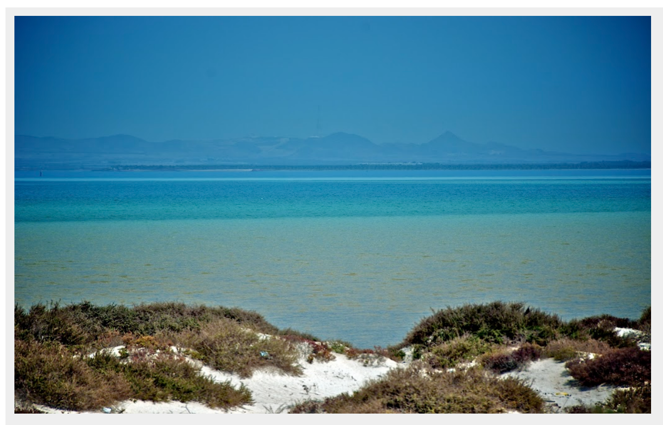
Sir Bani Yas Island seen from the shore - developed as natural habitat for wildlife, a booking is required to visit the island by ferry. The Danat Jebel Dhanna Beach Resort can arrange this for you.