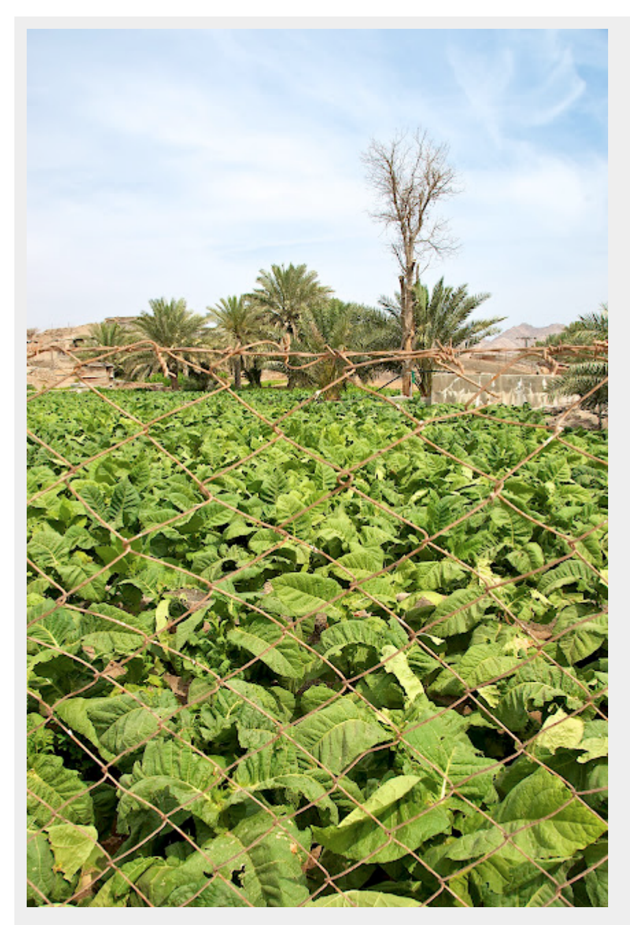
And the surrounding oases make the most of the abundant water resources and fertile soil. The UAE side of Hatta has recently built a large dam and reservoir to harness the water.