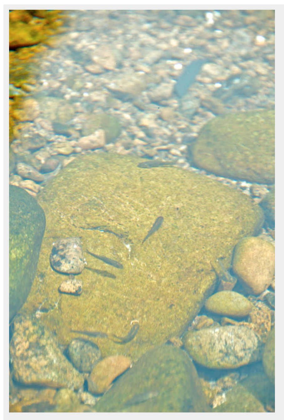
Fish in the Hatta Pools are a sign of healthy water.