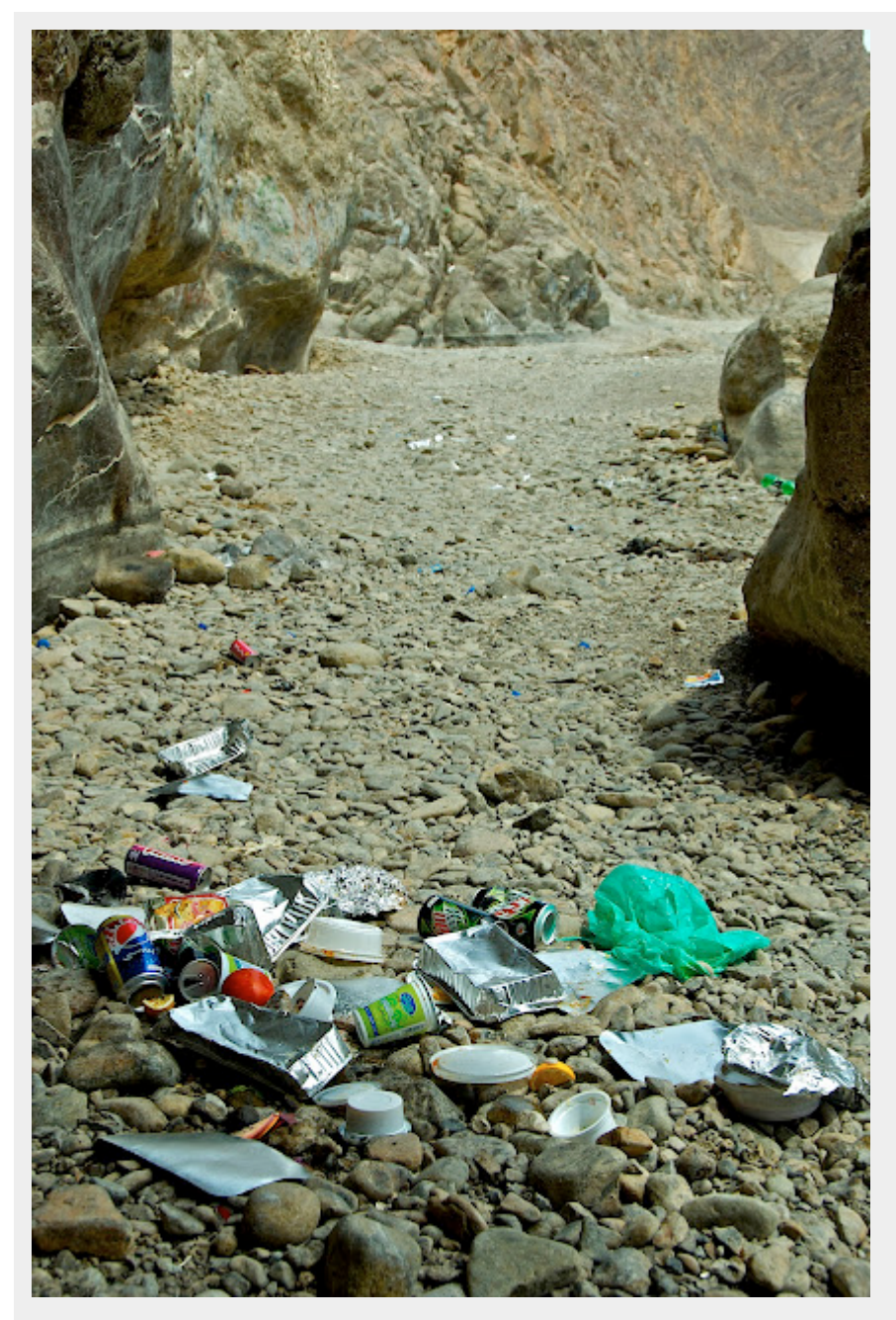
However, callous visitors continue to dirty the wadis by leaving their picnic waste. The aluminum containers and plastic bags that were used to carry the food in can so easily be used to carry the leftovers out again, and so the only possible reason for this disgraceful behavior must be ignorance.

Please make sure you read the Disclaimer and plan your trips with due care.