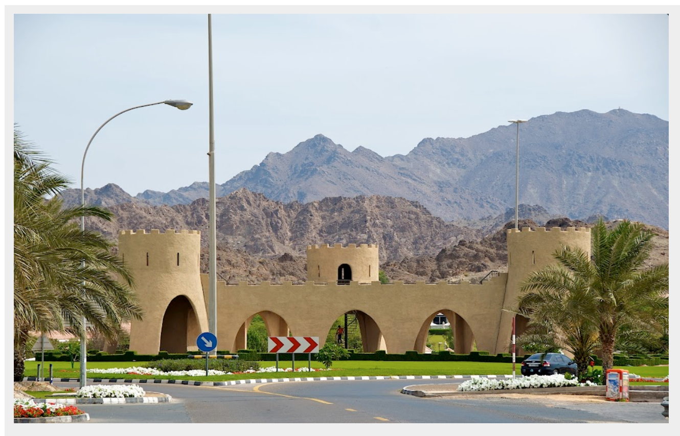
From the Hatta Fort roundabout, the pools are to the south-east, past the Hill Park.