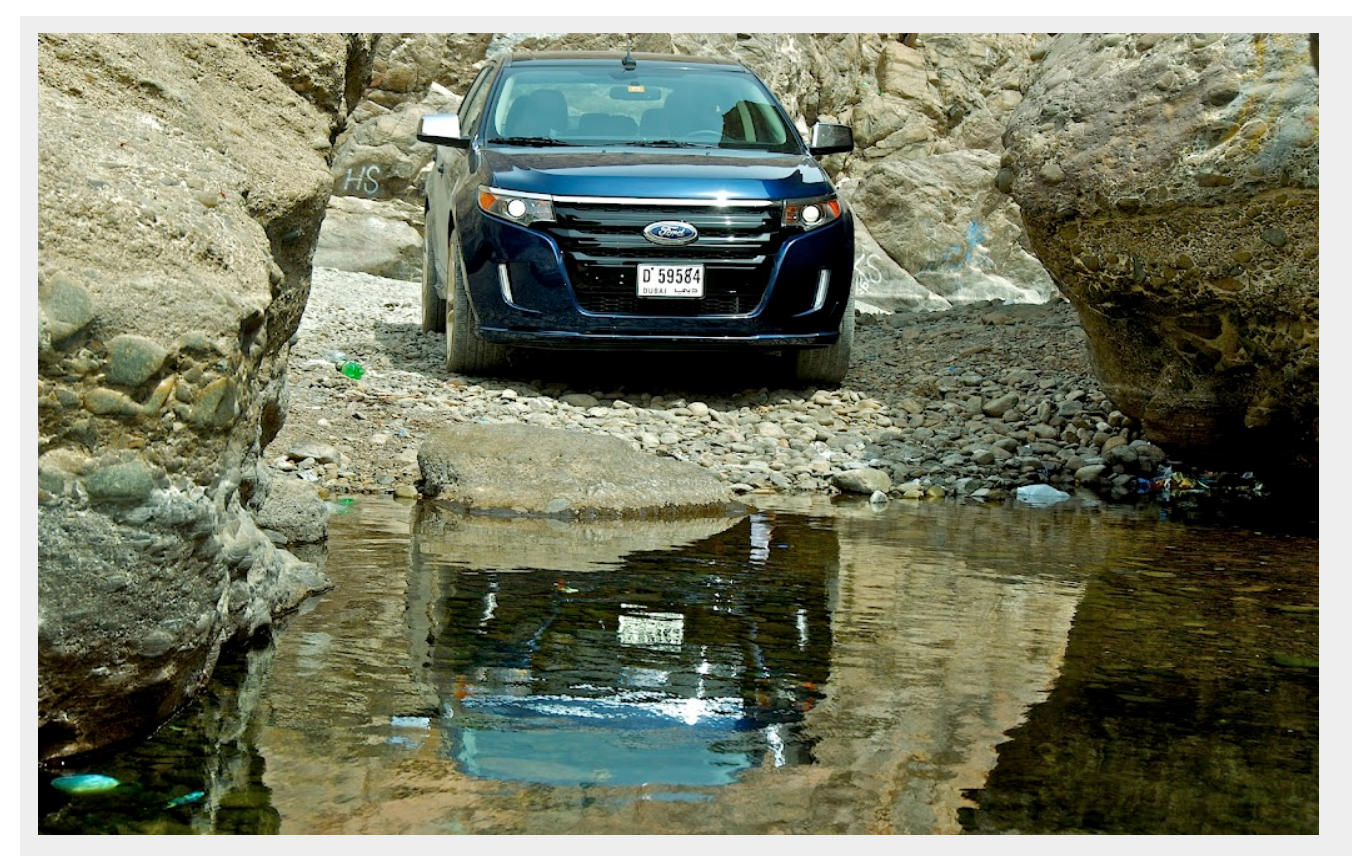
Finding fresh water in the middle of one of the most arid environments on Earth is nothing short of a miracle; and there are a surprising number of fresh water sources hidden among the Hajar Mountains.

This trip will take us to the mountains south of Hatta, where a series of water pools offer a refreshing dip. It is a popular destination due to its ease of access, but unfortunately the closest pools tend to accumulate a fair amount of trash and graffiti.