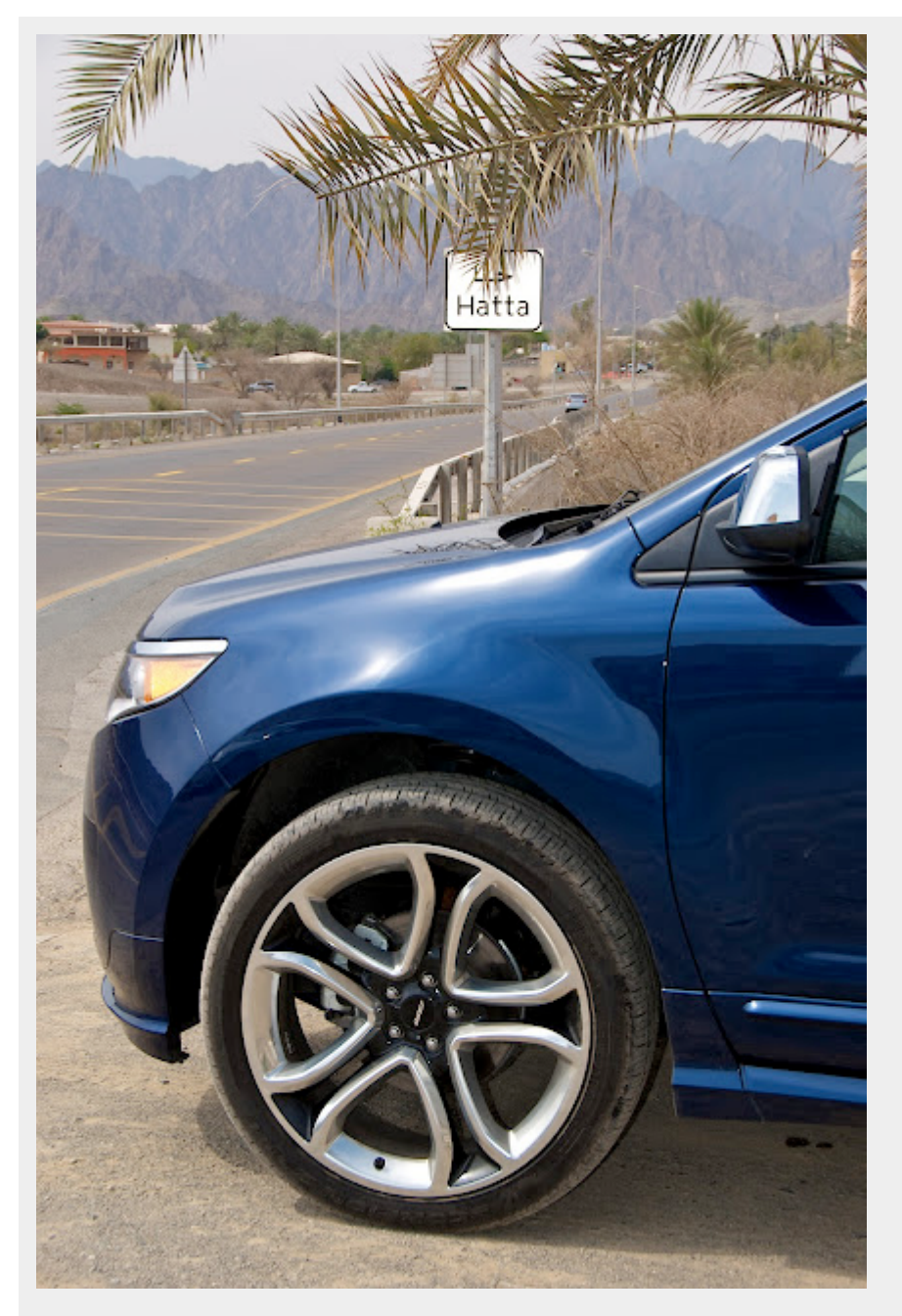
The Ford Edge poses handsomely on its way to Hatta, flexing its fluid shapes and smooth lines that run the length of its body. I found the Edge a very attractive car indeed.

Check out more about the Ford Edge at Al Tayer and in the video clip below: