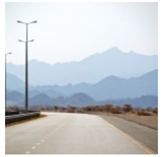
Click for larger photo

The mountains around Hatta are fierce and sharp - every track leads to an adventure! Considering that in this region survival was based on the availability of water (and still is), so every track leads to a village, and every village was built within reach of water. The Hatta pools are only one of the many.