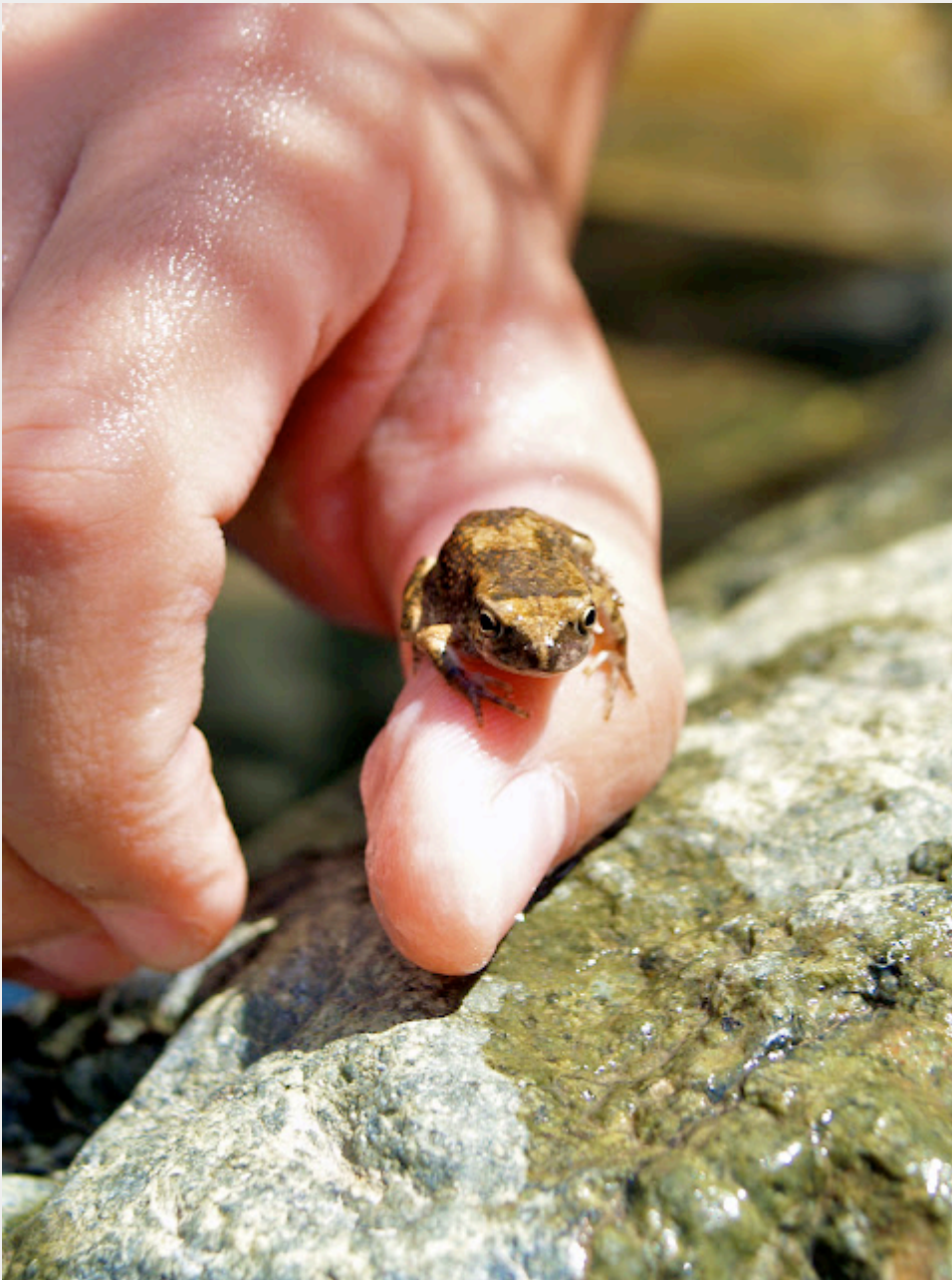
A friendly frog hitches a ride on a thumb. The pools are also home to small fish.