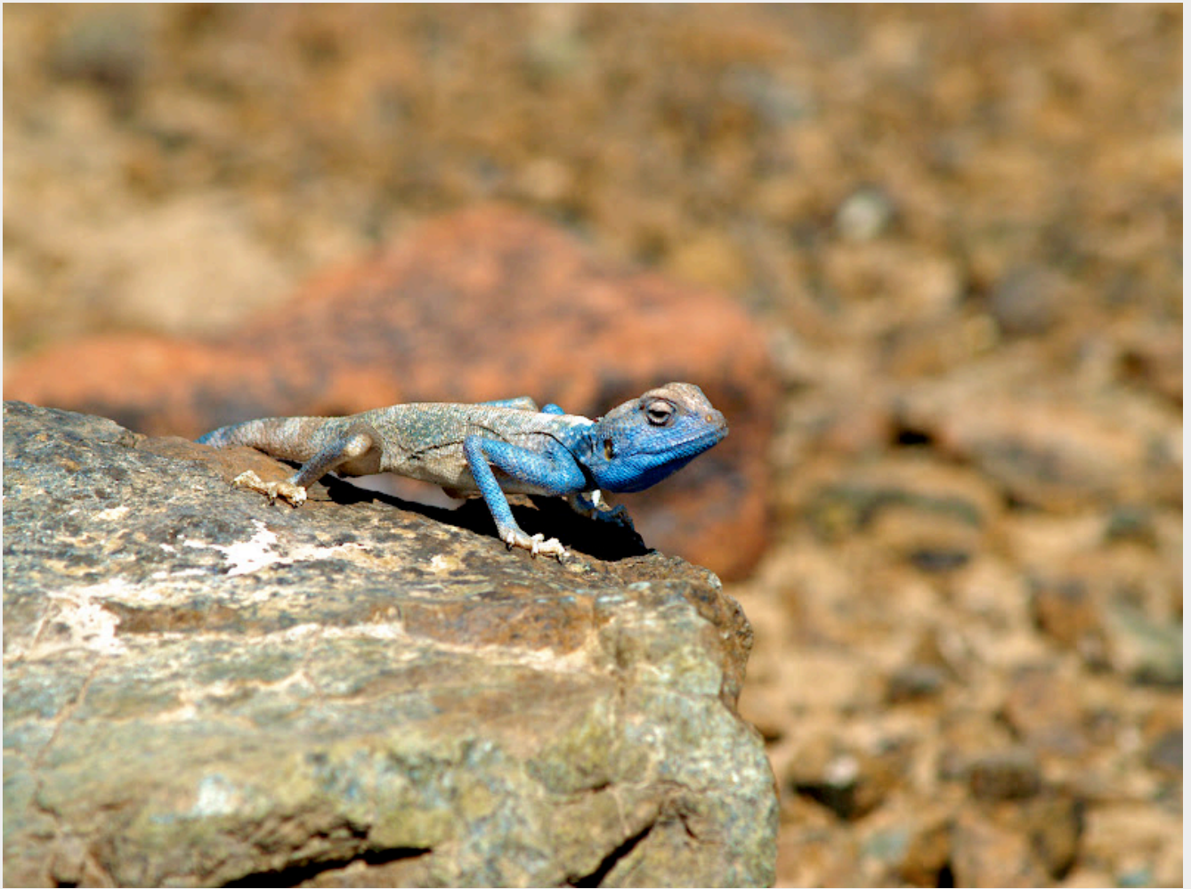
A Blue-headed Agama lizard basks in the sun. The color communicates its mood - in this photo it is glaring at me angrily. Perhaps I should have asked its permission before taking the photo!