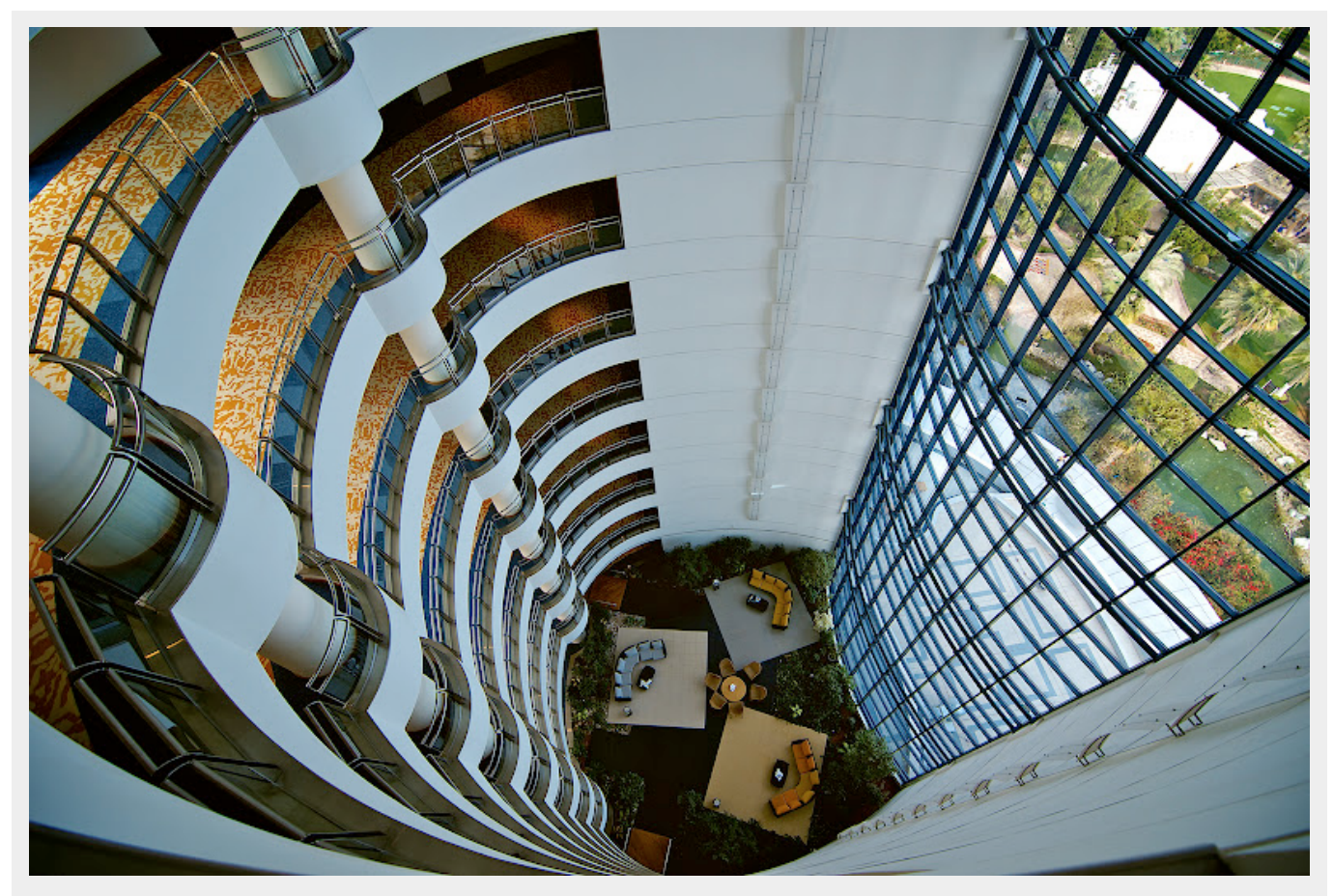
This photo was taken from the 11th floor, about half-way up the tower, and just below Le Meridien Club Lounge!

Le Meridien Club lounge is exclusively available for Le Meridien Club room and suite guests for all day refreshments, reading options, wi-fi lounge and a daily happy hour (and meeting room, if you bring your work with you) – if you can upgrade your stay to a Club room or Suite, the Club Lounge will be an excellent addition to the convenience of your stay.