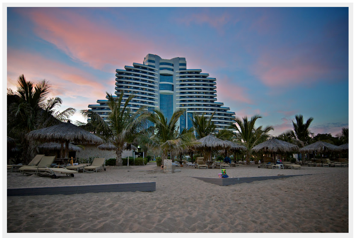
All in all, the atmosphere is delightful – and my favourite time of the day, around sunset, sets the mood perfectly in synch with the pleasure of a genuinely five-star facility and staff.

If you happen to visit with someone special, bring them close to you, as the combined effect of the seaside and pampering Le Meridien style may have a magical effect of melting stress and turning it into a shared emotion that will re-energize and create fond memories for years to come.