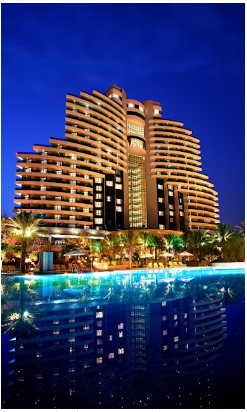
The restaurants play with your tastes – signature Thai restaurant is in fact called "Taste"; the traditional Indian restaurant is named "Swaad", meaning Taste in Hindi; and "Sapore", the fine-dining Italian restaurant, also means Taste in Italian language. The theme of Taste obviously underscores the importance Le Meridien Al Aqah Beach Resort places on ensuring that their food and beverage offerings are on par with their service.