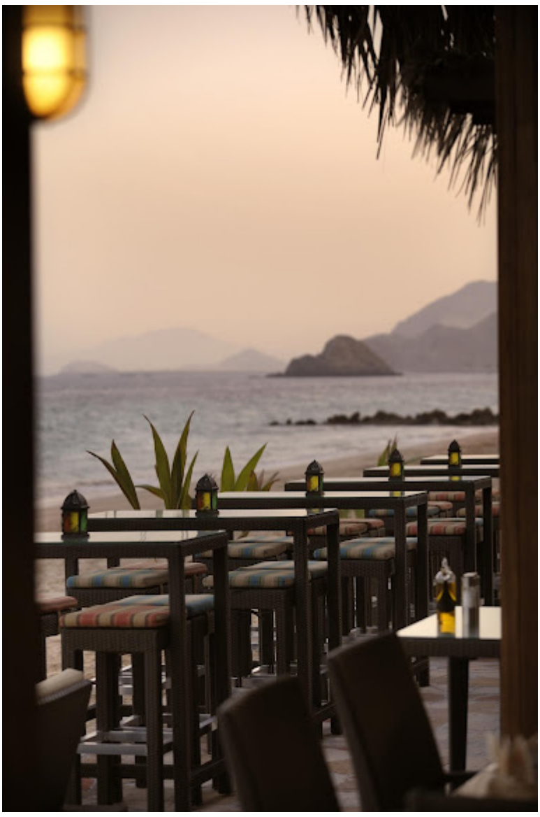
Le Meridien Al Aqah Beach Resort is part of the Starwood Hotels & Resorts Worldwide group, one of the world's largest hotel companies: Hotel booking information