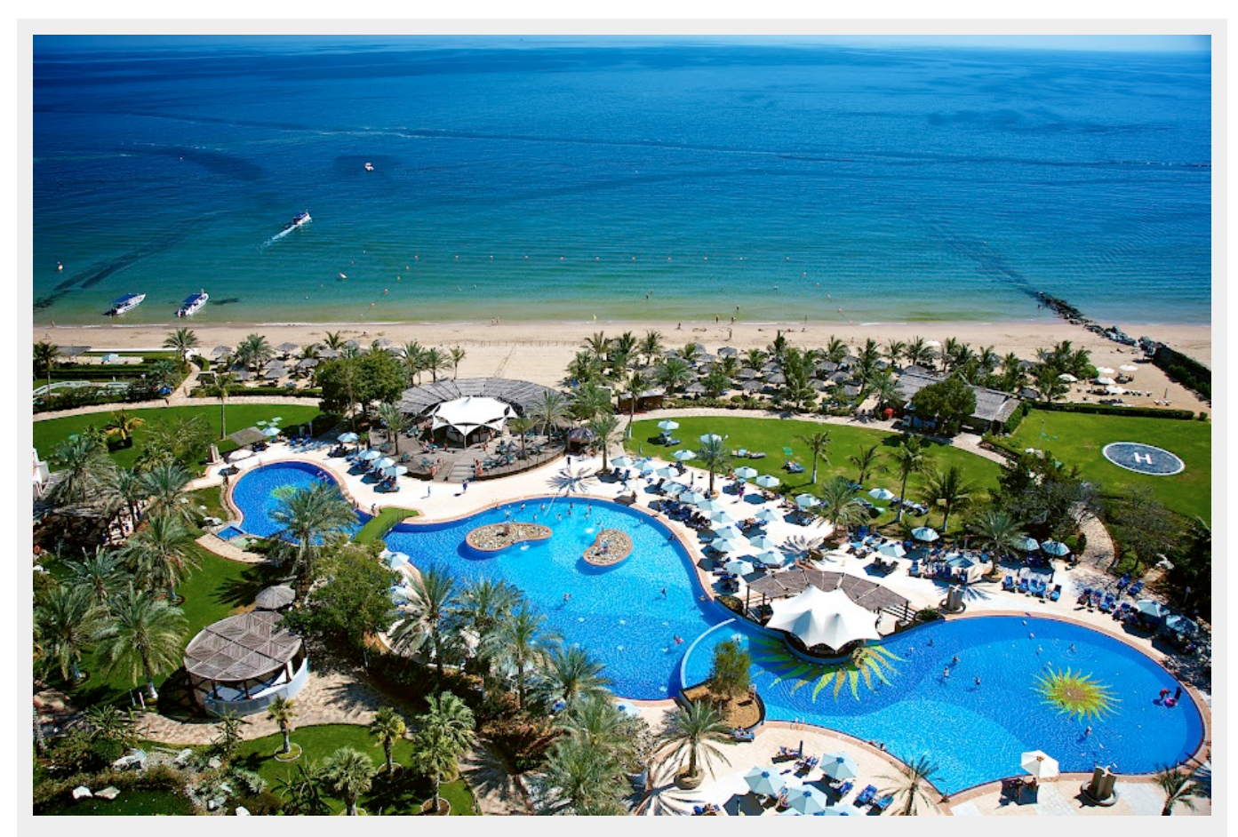
The view from our room at Le Meridien Al Agah Beach Resort speaks for itself.

This weekend's stay ranks in "The Most Wonderful" category in all regards – it is without any hesitation the #1 UAE East Coast resort in my opinion, and the accolades from the many international awards that Le Meridien Al Aqah team has received point to it ranking highly on a global scale, as well.