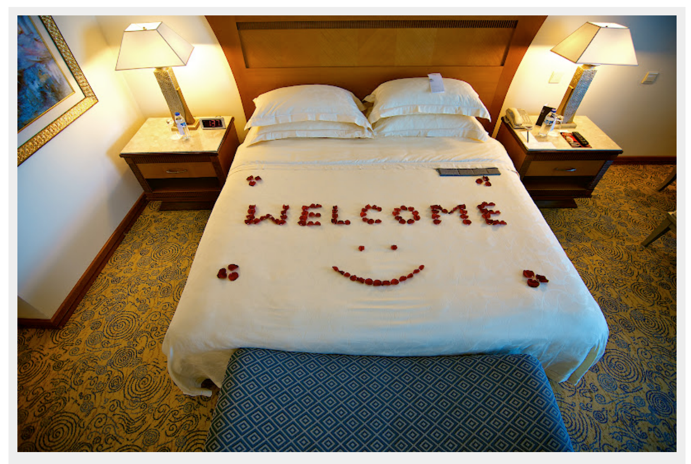
And the smiles that welcomed us at the entrance carried all the way upstairs!

All rooms offer a panoramic view of the beautifully landscaped gardens, pool and the ocean stretching and melting into the horizon. Each room is spacious enough for families and equipped with a host of amenities including walk-in wardrobe, DVD player, computer port and 24-hour in-room dining. A complimentary daily newspaper, tea coffee making facilities and bottled mineral water are replenished daily. Completing the room is a spacious bath room with separate bath and shower and exclusive amenities.