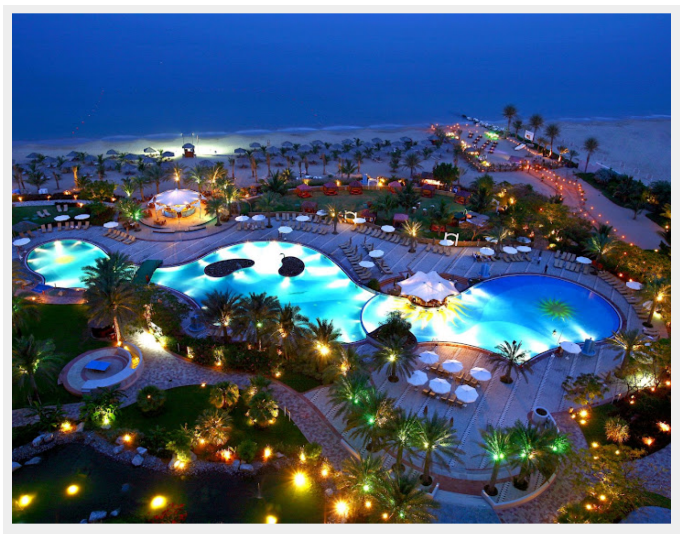
After the sun sets Le Meridien Al Aqah Beach draws its guests to its landscaped gardens, where a stroll before or after dining is a very pleasurable experience.