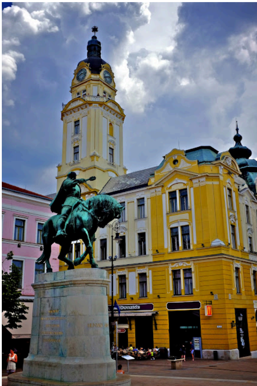
This is Pécs!