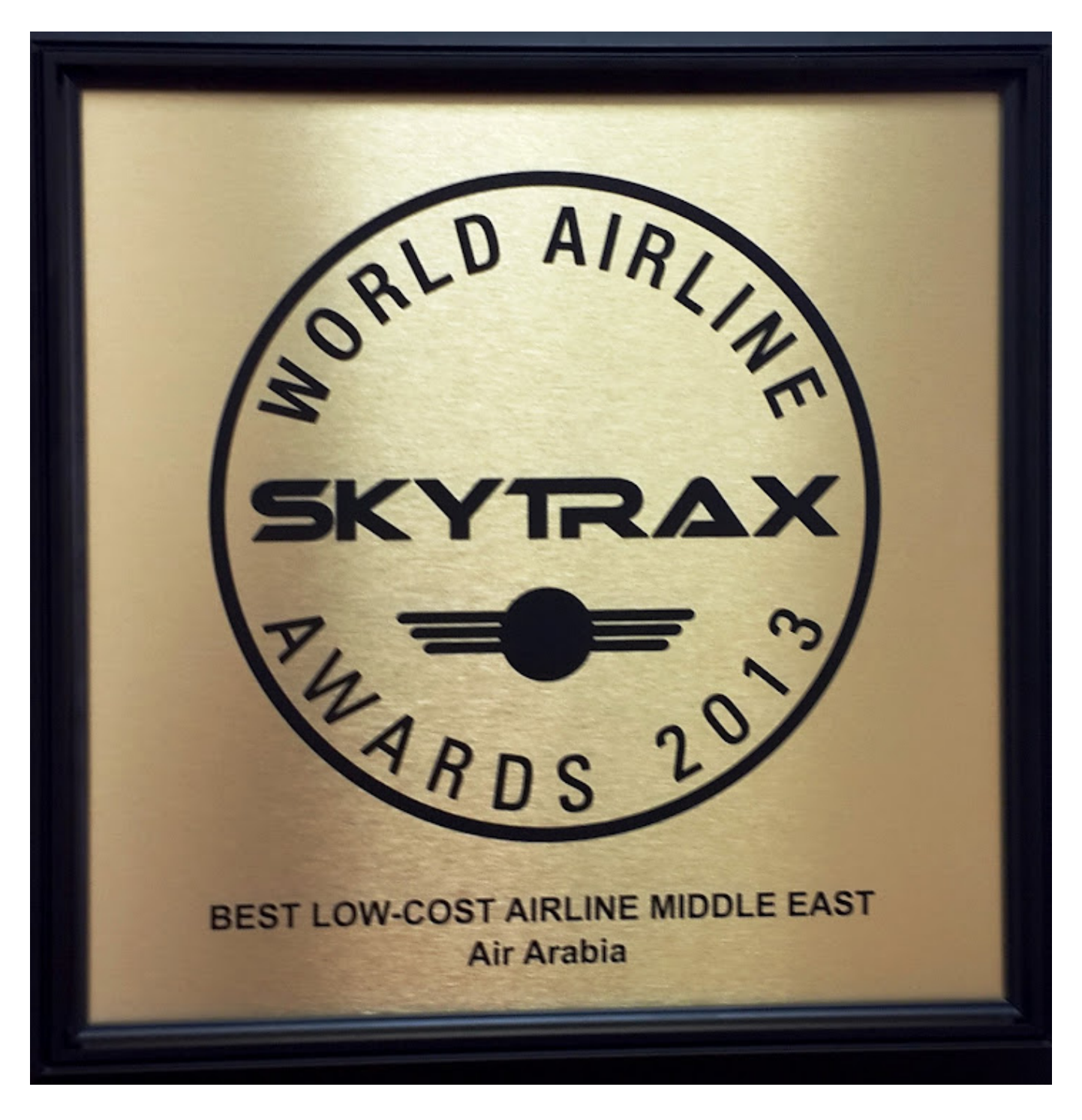
In March 2014 Air Arabia took delivery of its 37th Airbus A320, the world's best-selling and most modern single-aisle aircraft, with another 7 aircraft on their way by 2016.