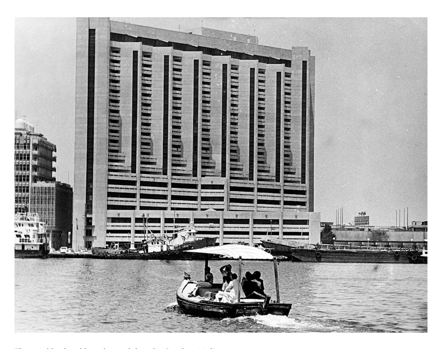
The neighborhood has changed, but the Creek spirit lives on.