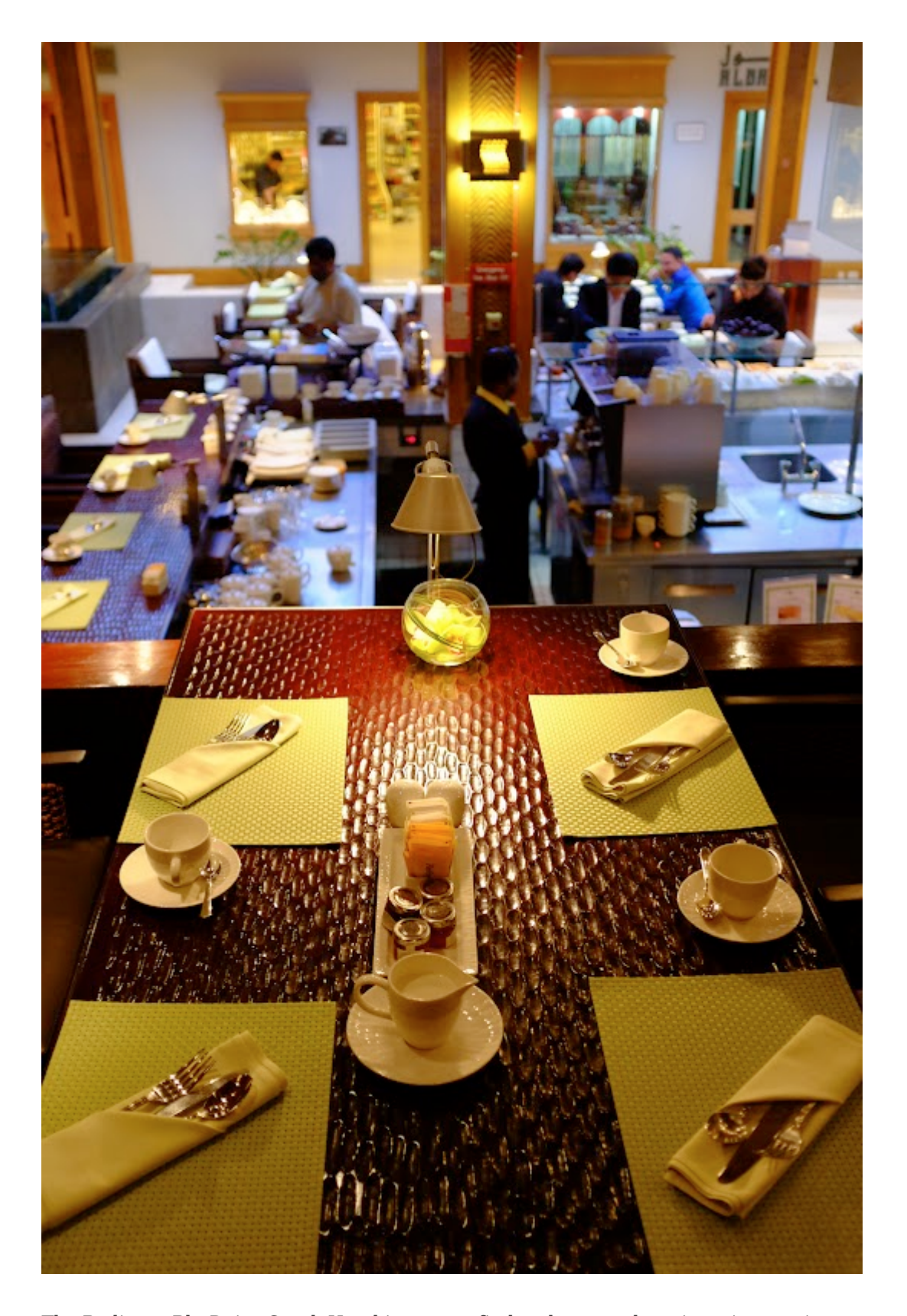
The Radisson Blu Deira Creek Hotel is easy to find and access, here is an interactive map:

View Radisson Blu Deira Creek in a larger map and download the GPS track coordinates here.