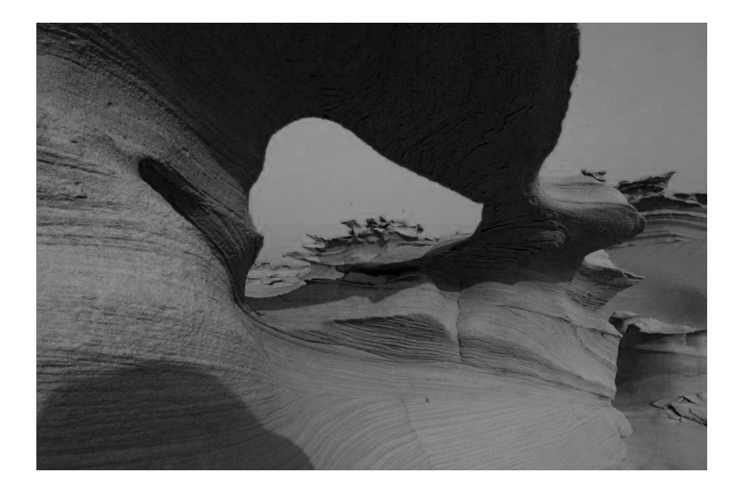
Nor just how amazing the experience will be!