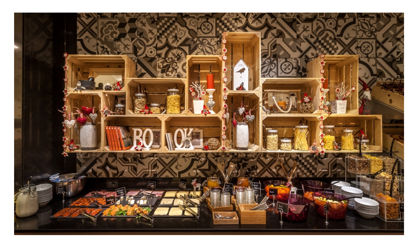
Check out their hotel bar: