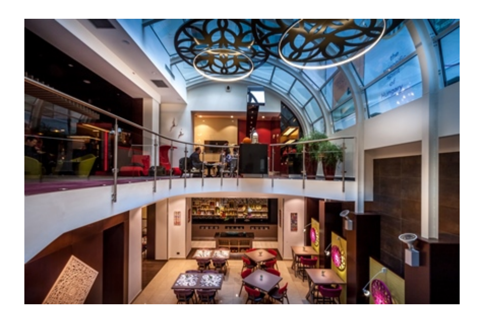
Including a functional business centre and a library.

And you will find everything you need at the Hotel Parlament.