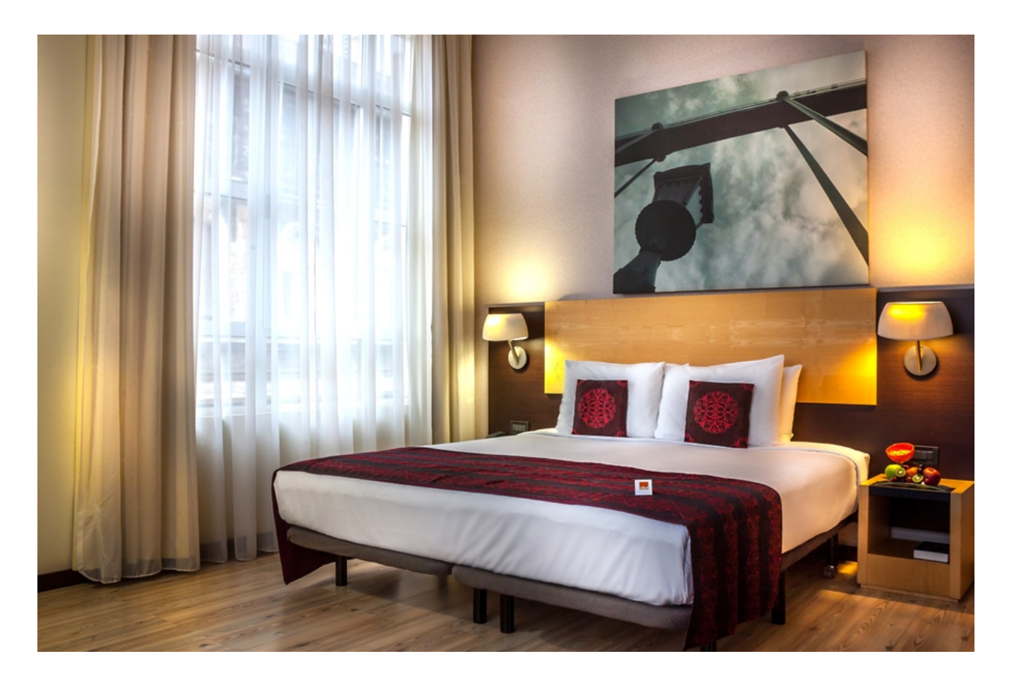
It is a four-star hotel that has re-invented itself into something really special.