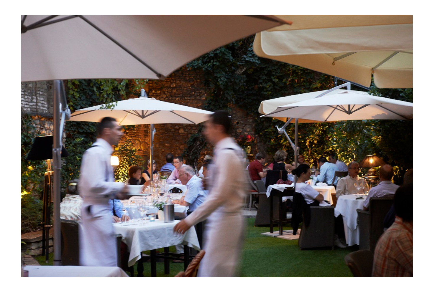
Truly a top-class dining experience!