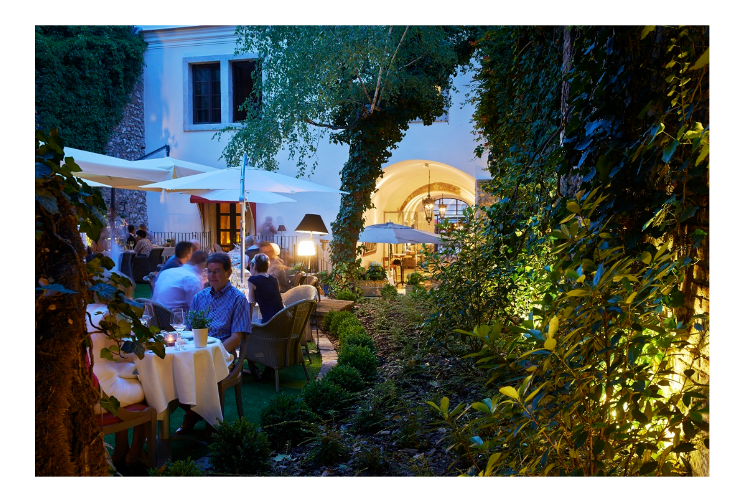
Café Pierrot is easy to find in the historic Castle District of Budapest.