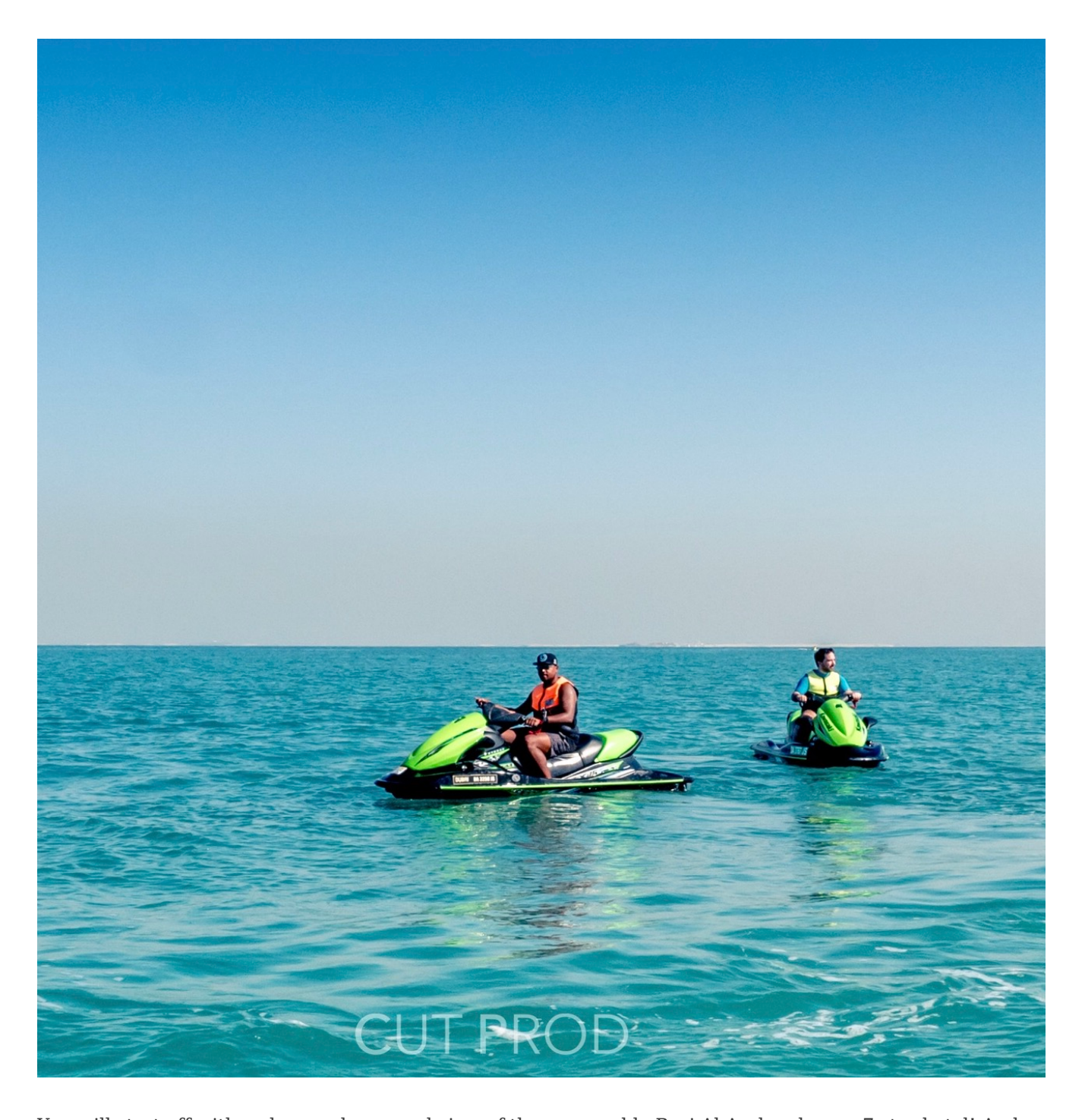
You will start off with a close and personal view of the memorable Burj Al Arab, a luxury 7-star hotel! And don't worry – your instructor offers photographing of you throughout the tour!