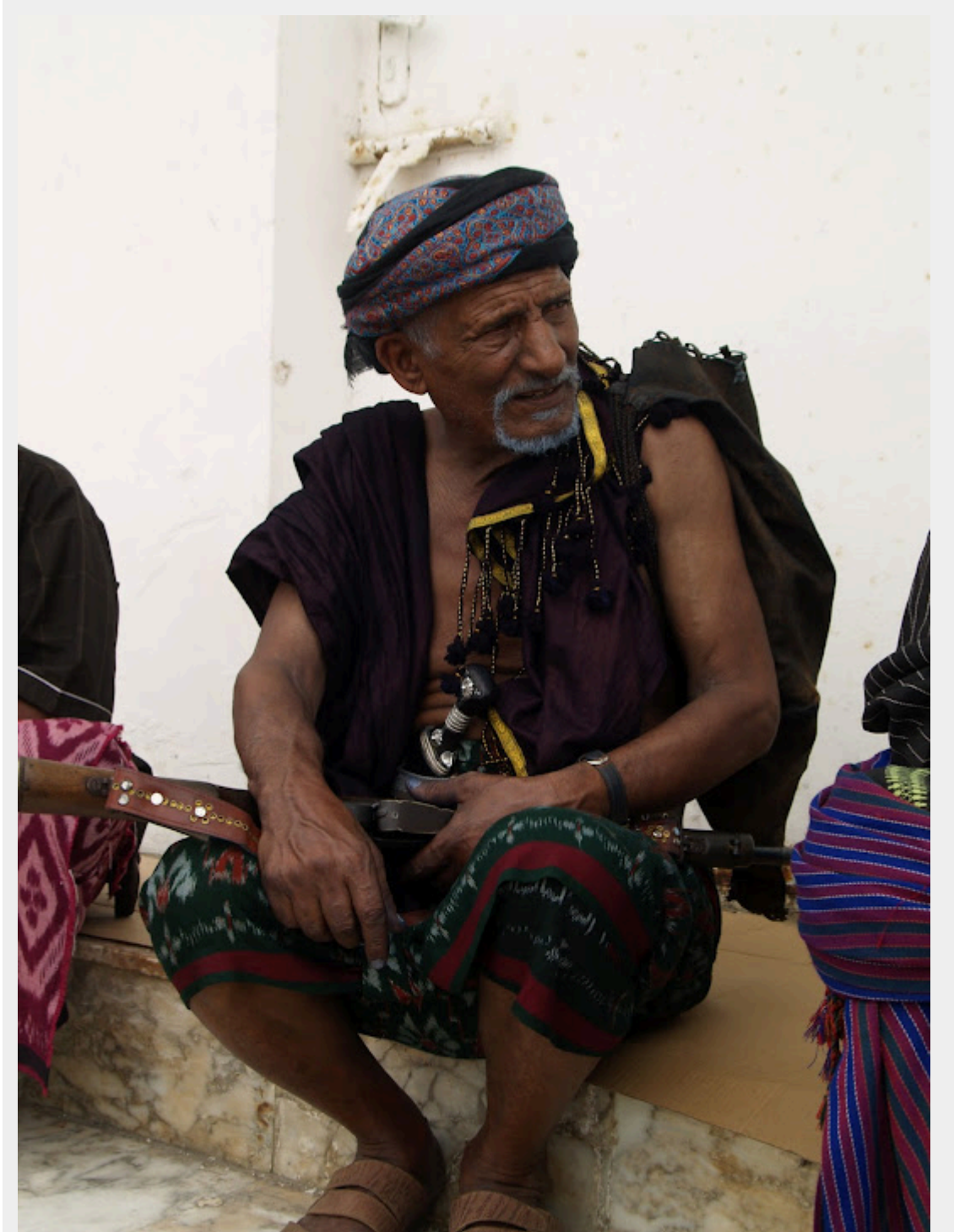
A Jebeli tribesman dressed in traditional clothing carries a curved knife and hunting rifle wherever he goes.