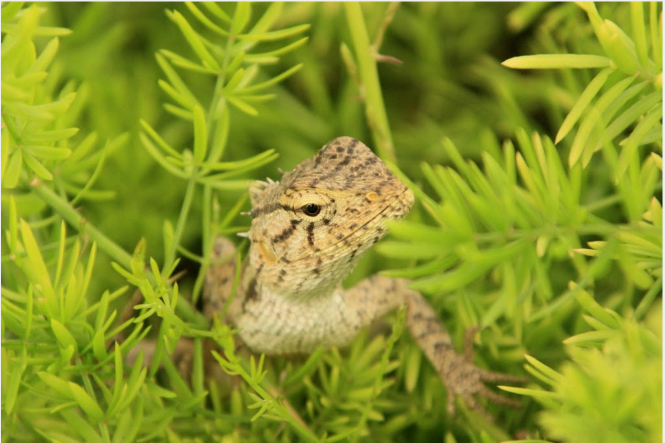
A young gecko peers out from a verdant fern

Please read the original article: Driving the Green Miles . Published by The National, Oct 10, 2010.