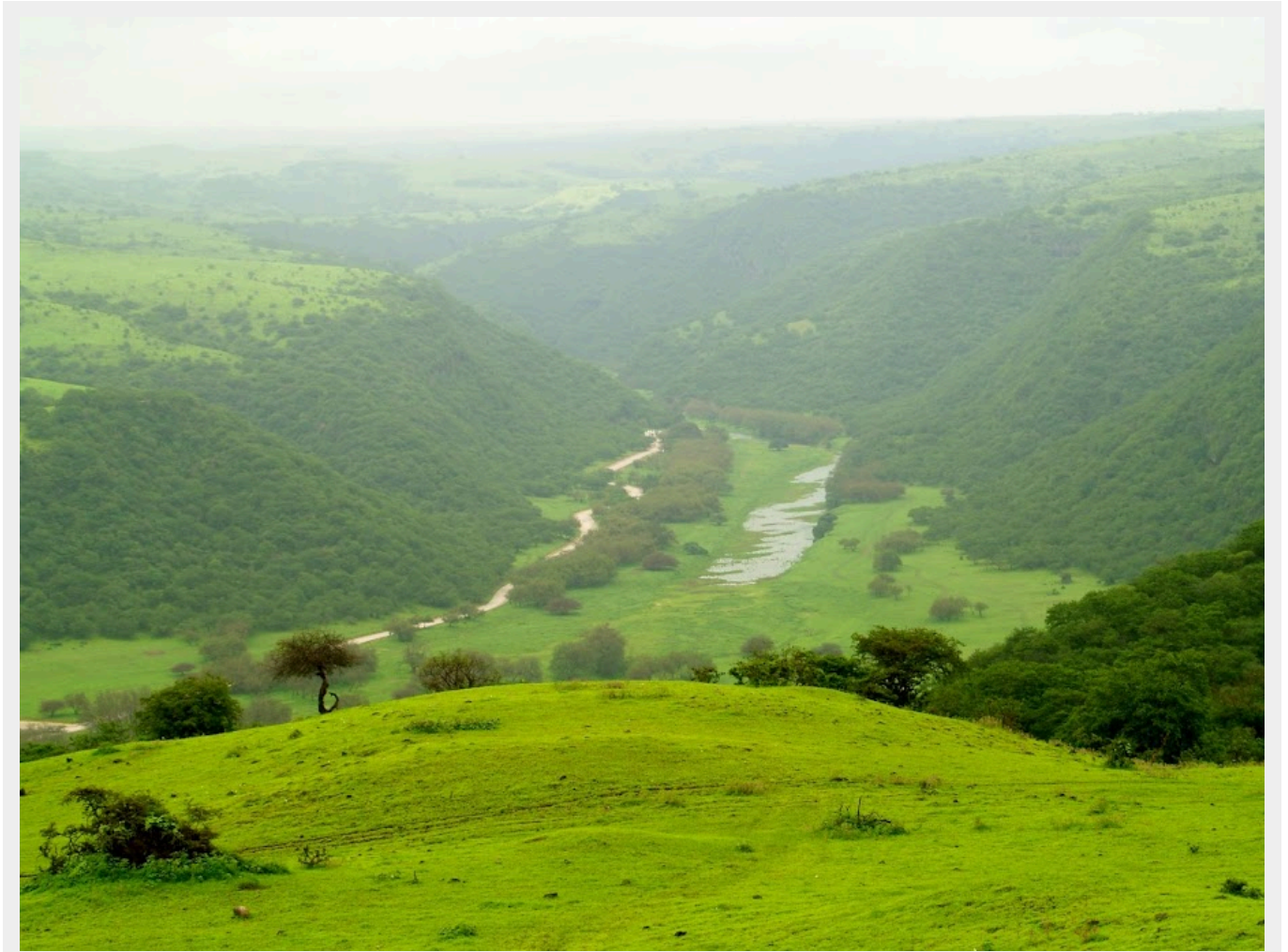
The GPS route I propose will take you up and around, and off-road, in the Dhofar Mountains.