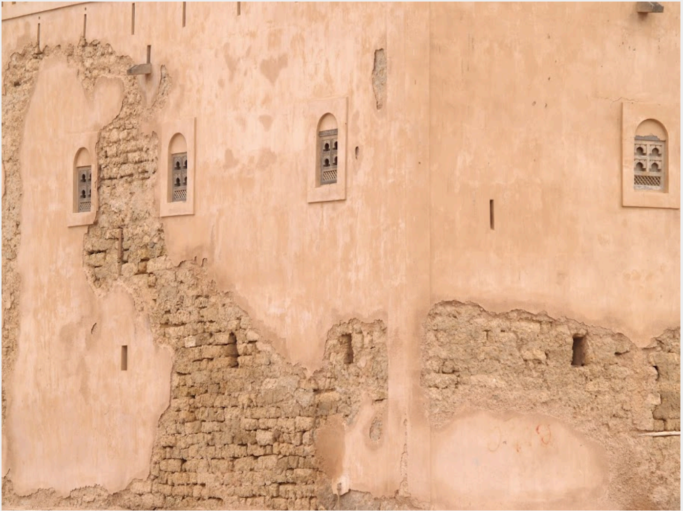
The old quarter in the village of Mirbat