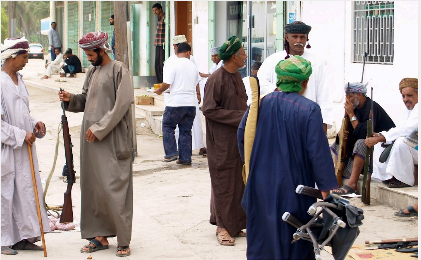
At the gun market in the old quarter of Salalah, men trade rifles and hunting equipment.