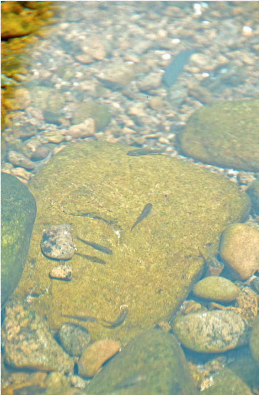
Fish in the Hatta Pools are a sign of healthy water.