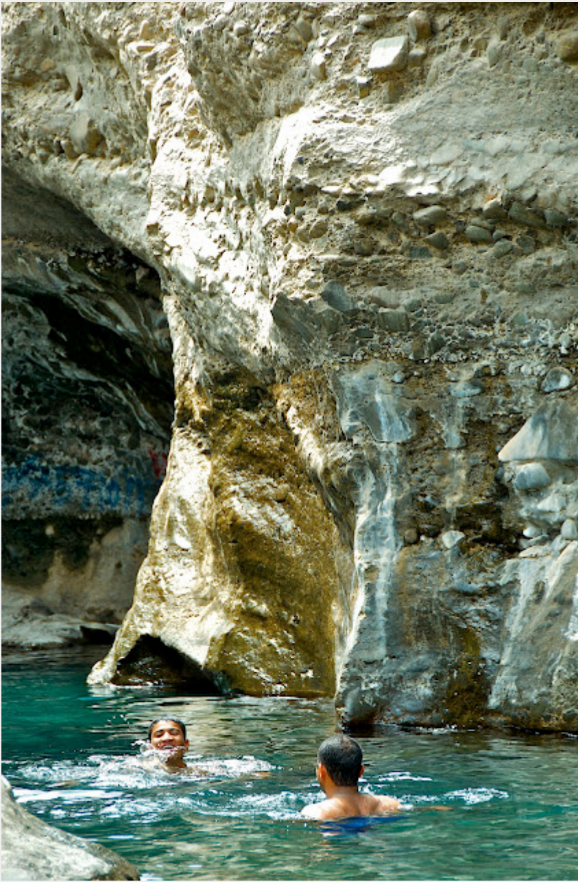
Friends take a dip in the Hatta Pools.

Check out an amazing 360-degree panoramic photo by Karim Saad!