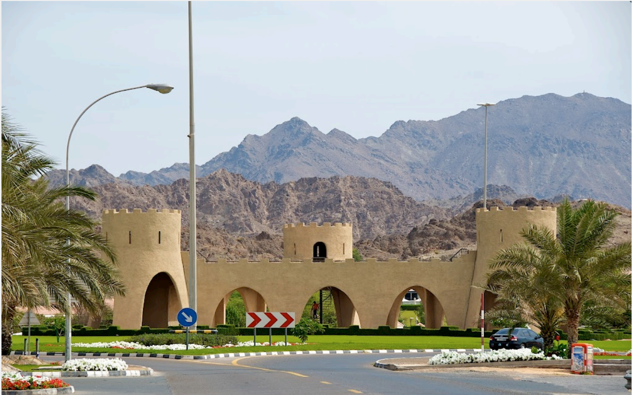
From the Hatta Fort roundabout, the pools are to the south-east, past the Hill Park.