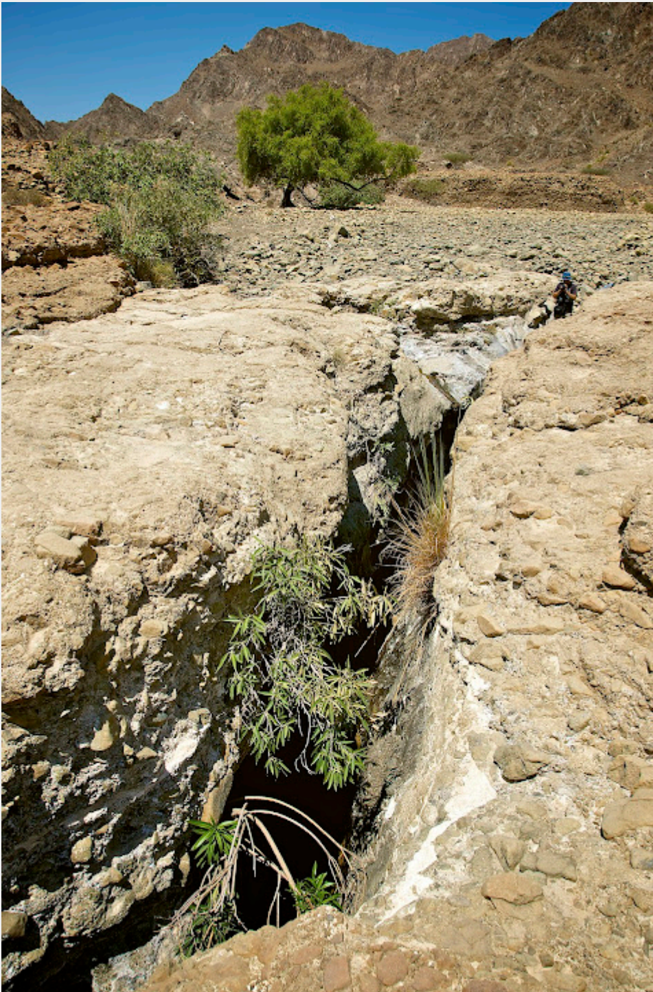
The crevice at Wadi Tarraniya - you can see the catchment area upstream, where the run-off from the surrounding mountains is forced into the narrow gorge, and down the waterslide (you can just spot fellow adventurer Dave Mikhail on the right taking a photo straight down the slide).

Please make sure you read the Disclaimer and plan your trips with due care.