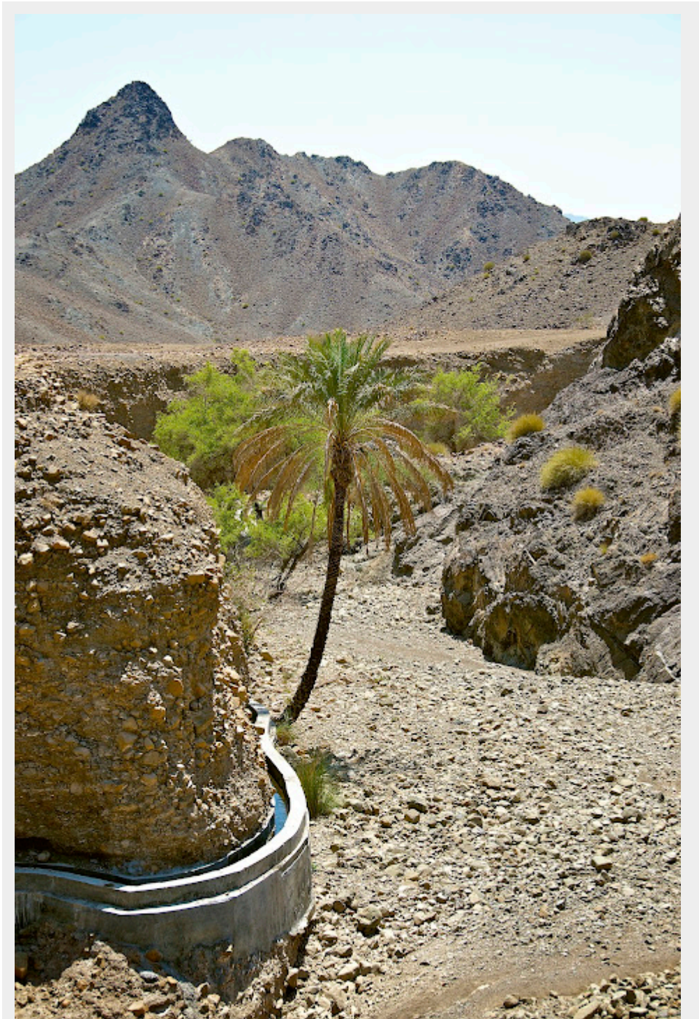
The irrigation canal (called Falaj in Arabic) runs downhill from the slide at Wadi Tarraniya, collecting fresh flowing water that percolates through the rocky sediment uphill of the waterslide.