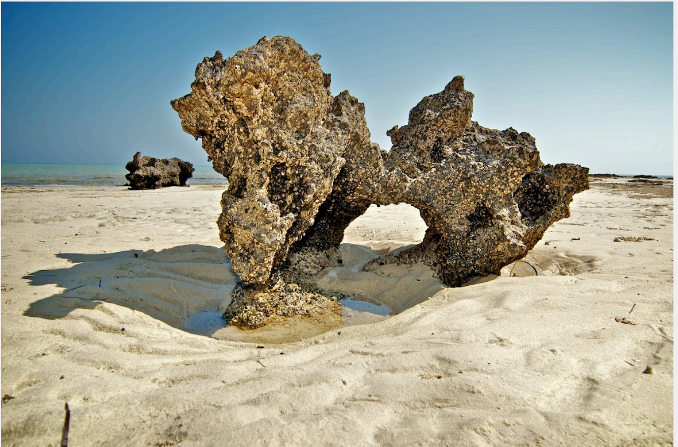
Several interesting rocks dot the coastline, and little rock pools catch out all sorts of living creatures as the tide pulls back leaving them momentarily trapped - a delight for children (and adults!).