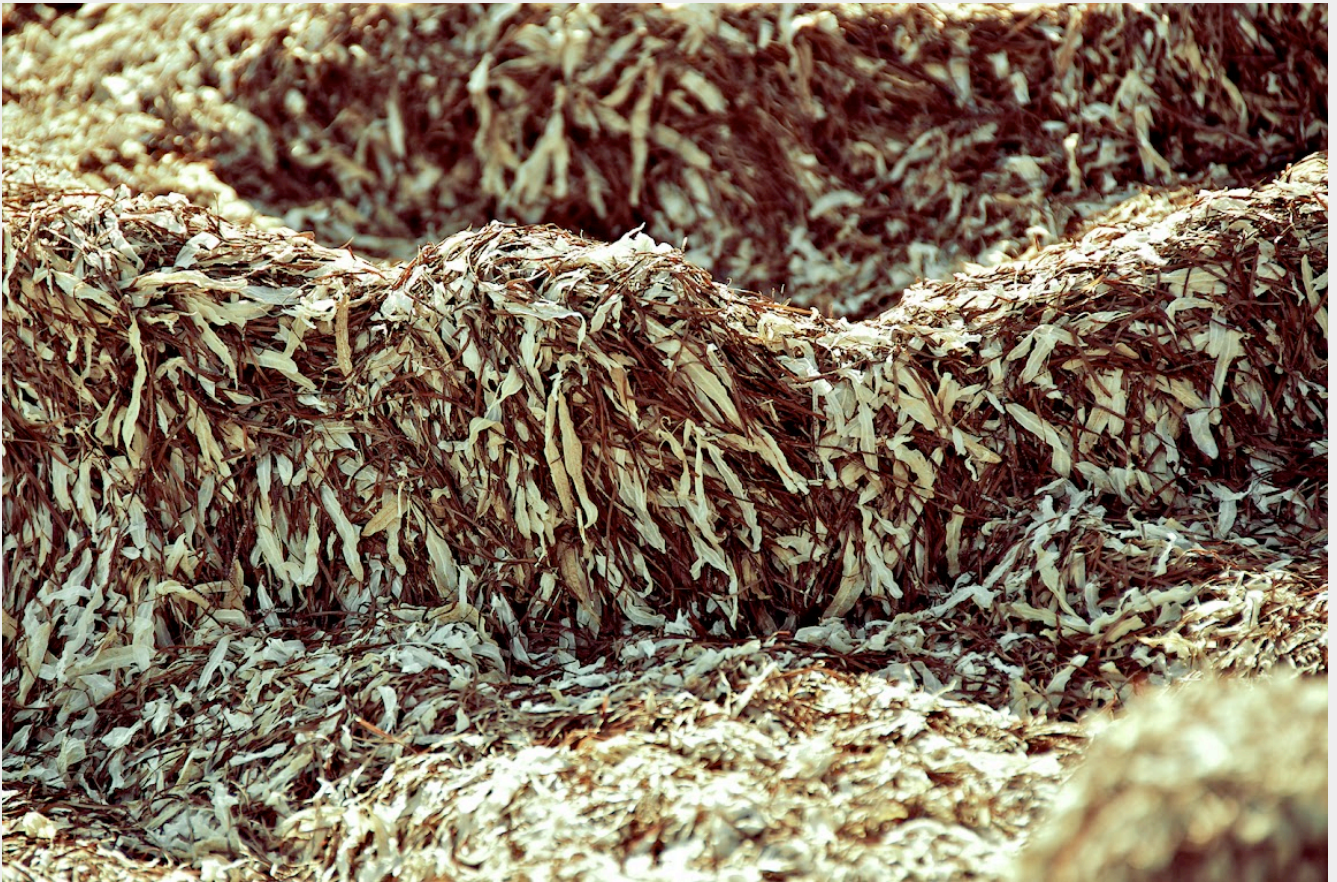
A stroll along the beach captures the setting perfectly; all sorts of washed-up relics - from the ubiquitous plastic bottle to natural debris as this mound of seaweed.