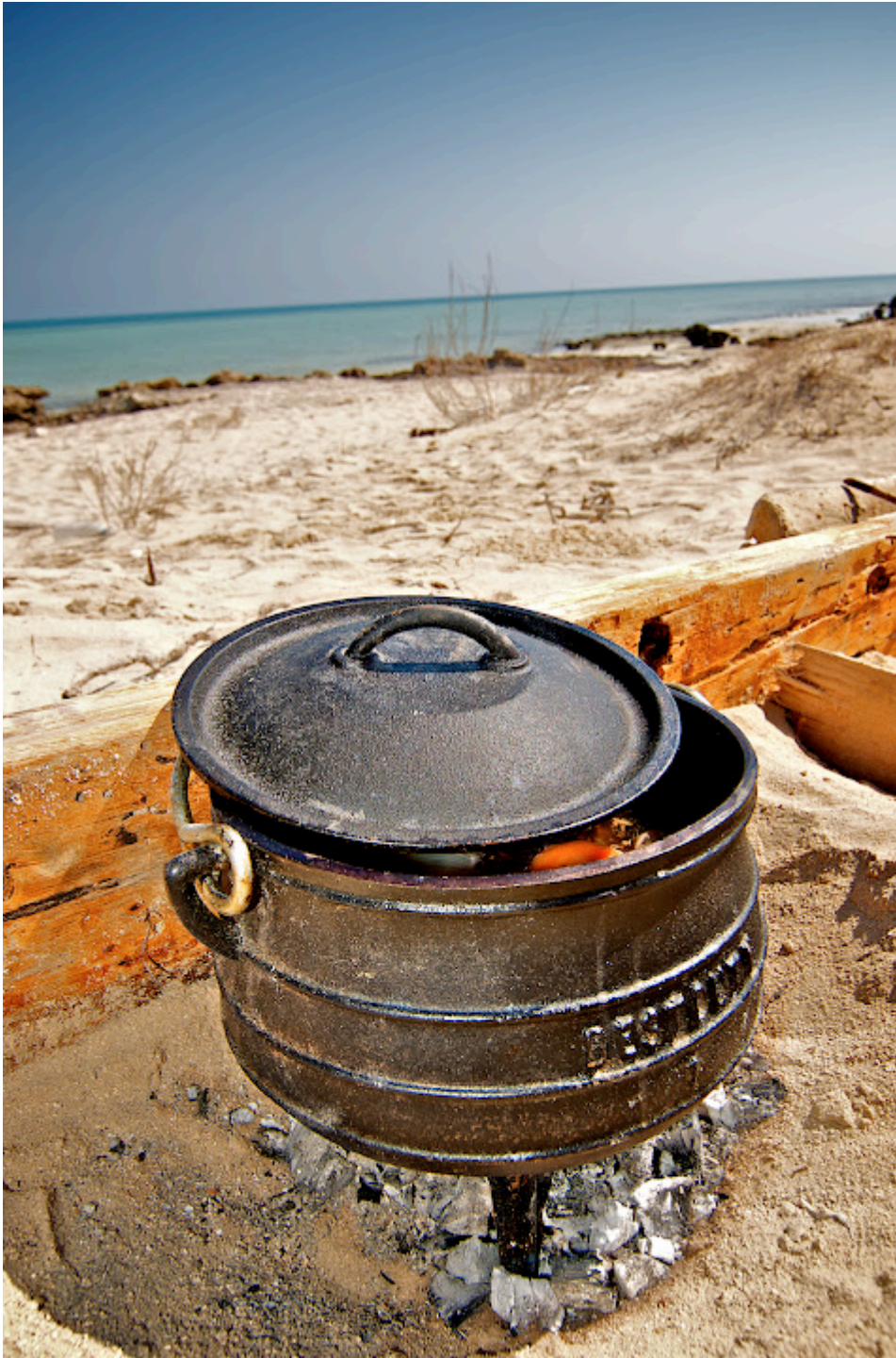
A poitkje pot, a cast-iron witch's cauldron, is excellent for slow cooking on the beach. In the photo is a camel meat stew, slowly bubbling throughout the afternoon, to be ready for a hearty sunset dinner.