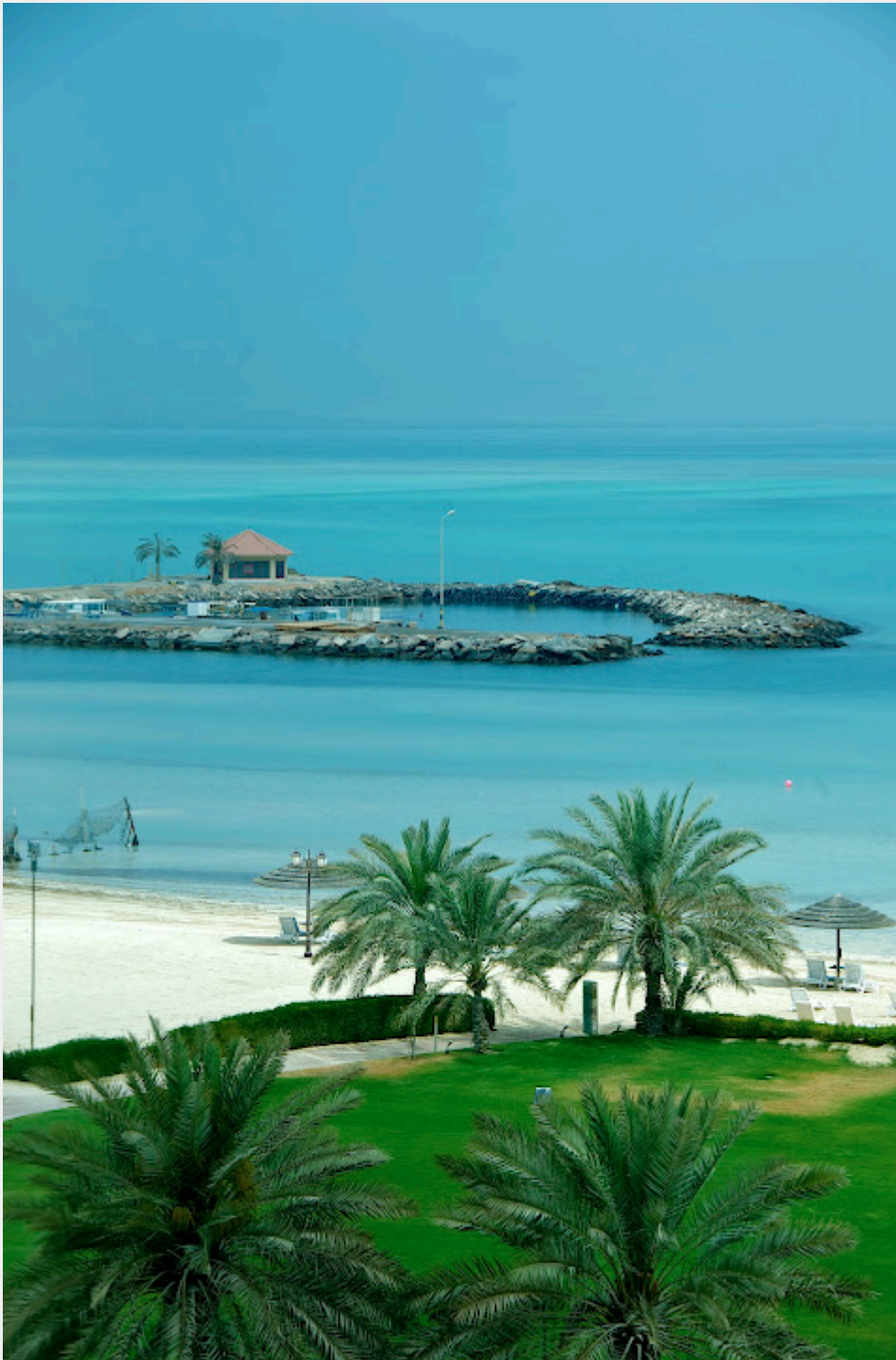
This was the view from our Danat Jebel Dhanna Beach Resort room window.