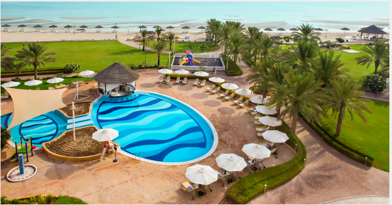
Would you believe the fresh-water swimming pool is temperature-controlled? never too hot, never too cold!