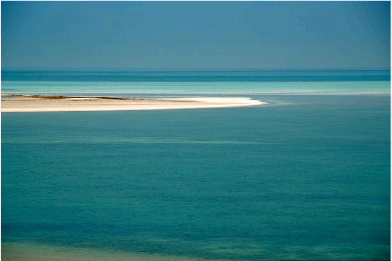
The Arabian Gulf as seen from the Al Ruwais shoreline.

Sir Bani Yas Island seen from the shore - developed as natural habitat for wildlife, a booking is required to visit the island by ferry. The Danat Jebel Dhanna Beach Resort can arrange this for you.