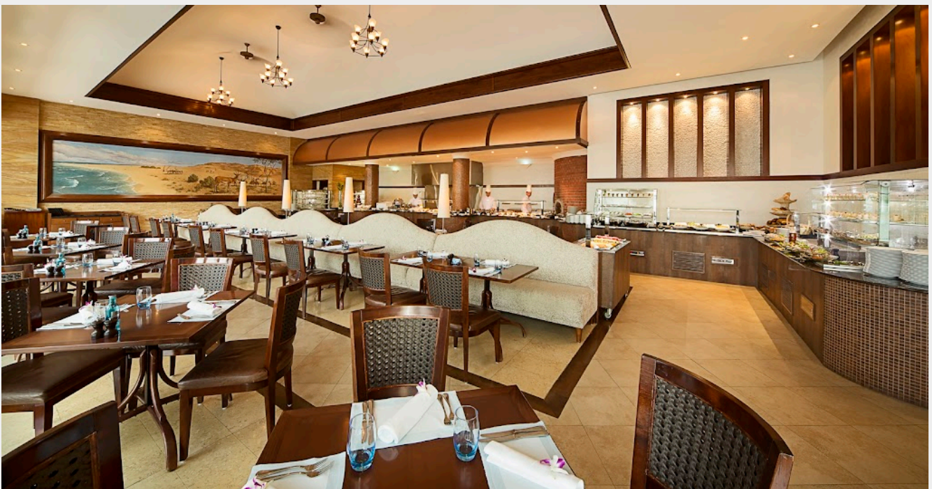
Tides, the Danat Jebel Dhanna Resort's international all-day dining restaurant tempts the palate with theme