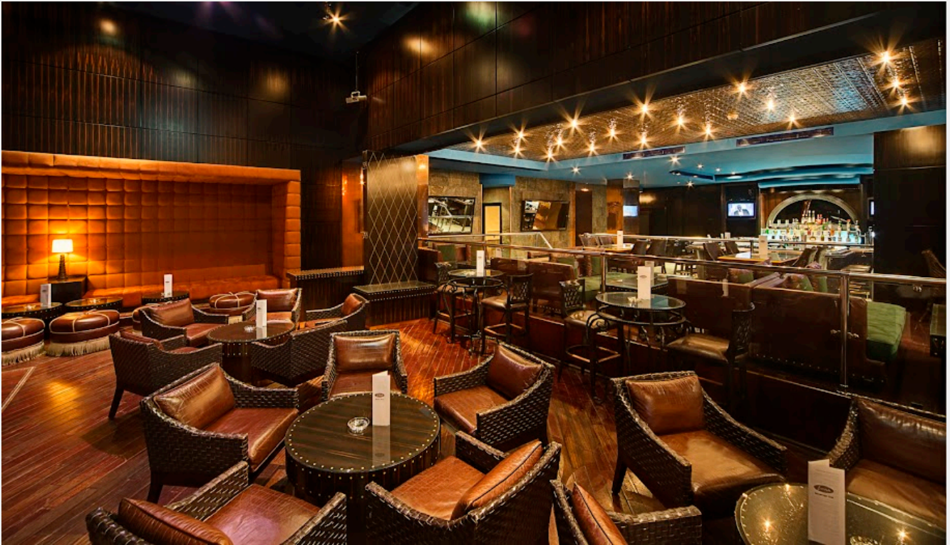
L'Attitude is the resort's bar and entertainment lounge.

beachside massage huts. Plus a dedicated children's pool, and both indoor as well as outdoor play areas.