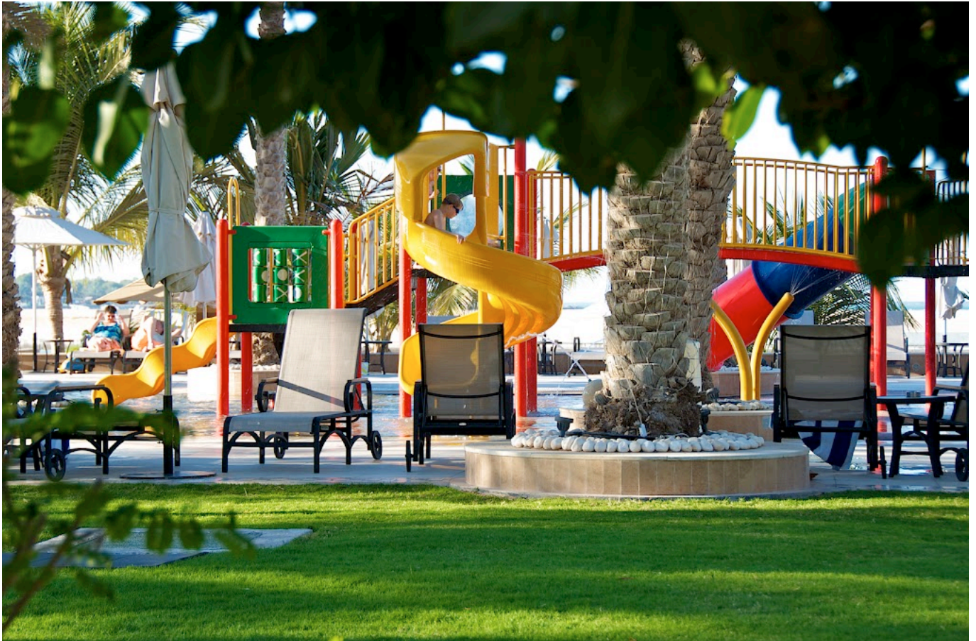
The nearby villa complex has its own pool and lounging area.