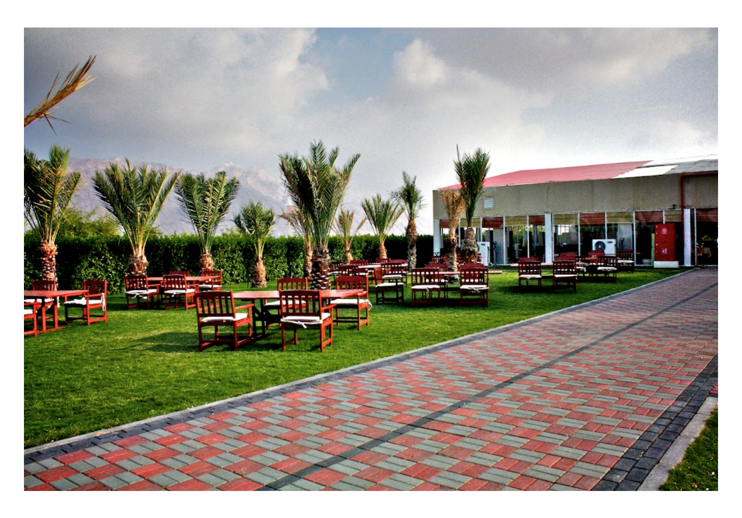
Several dining outlets cater to different clientele, and you will surely find a place just for you at One To One Al Faida.