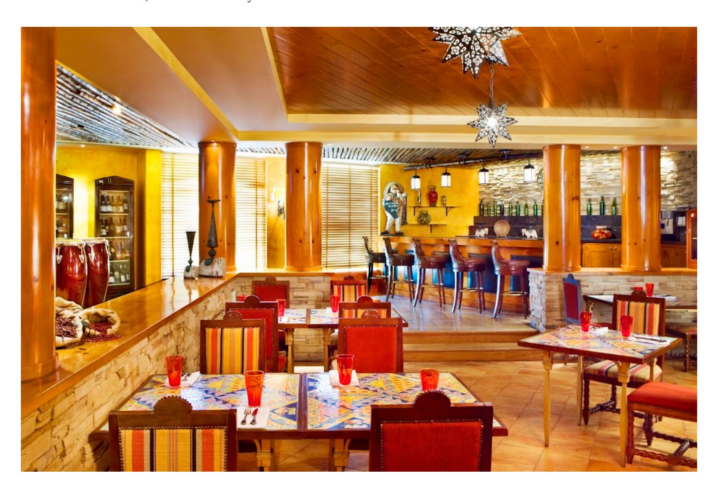
The Sombrero Mexican restaurant is most often fully-booked, especially at weekends, so place a reservation to secure your table.

And all are excellent, in their own ways.