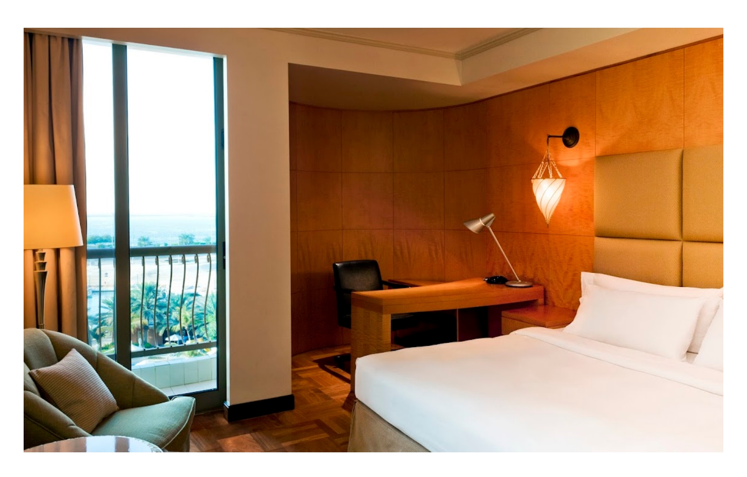
But it is after dark that the Sheraton Abu Dhabi lights up!