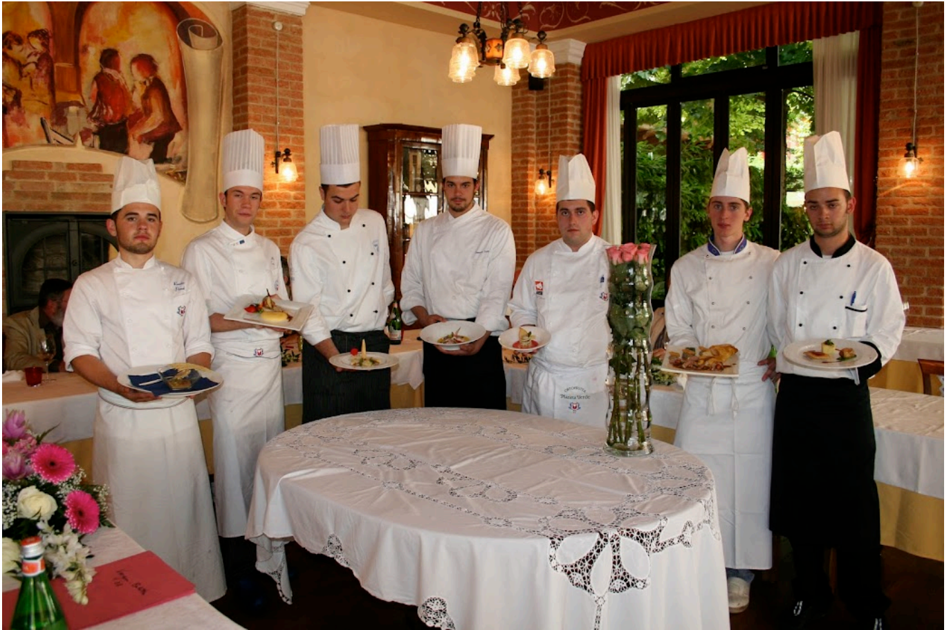
Sometimes the representatives of all the provinces in the region show up to do battle!