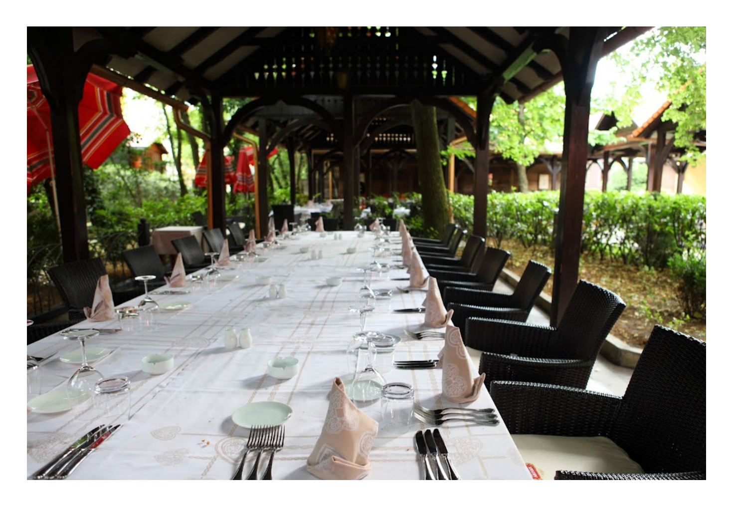
or sit inside in a wonderfully decorated traditional wooden lodge!