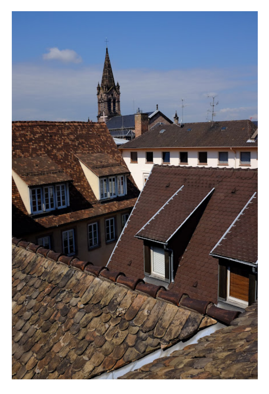
And then, once you think there can be nothing better than the old town, you reach the canals that surround it.