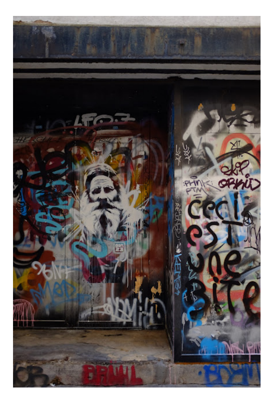
And invites you to have a bite of life.