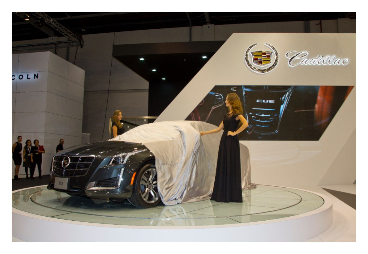
But I think Hyundai stole the show by presenting the futuristic HCD-14 Genesis concept.