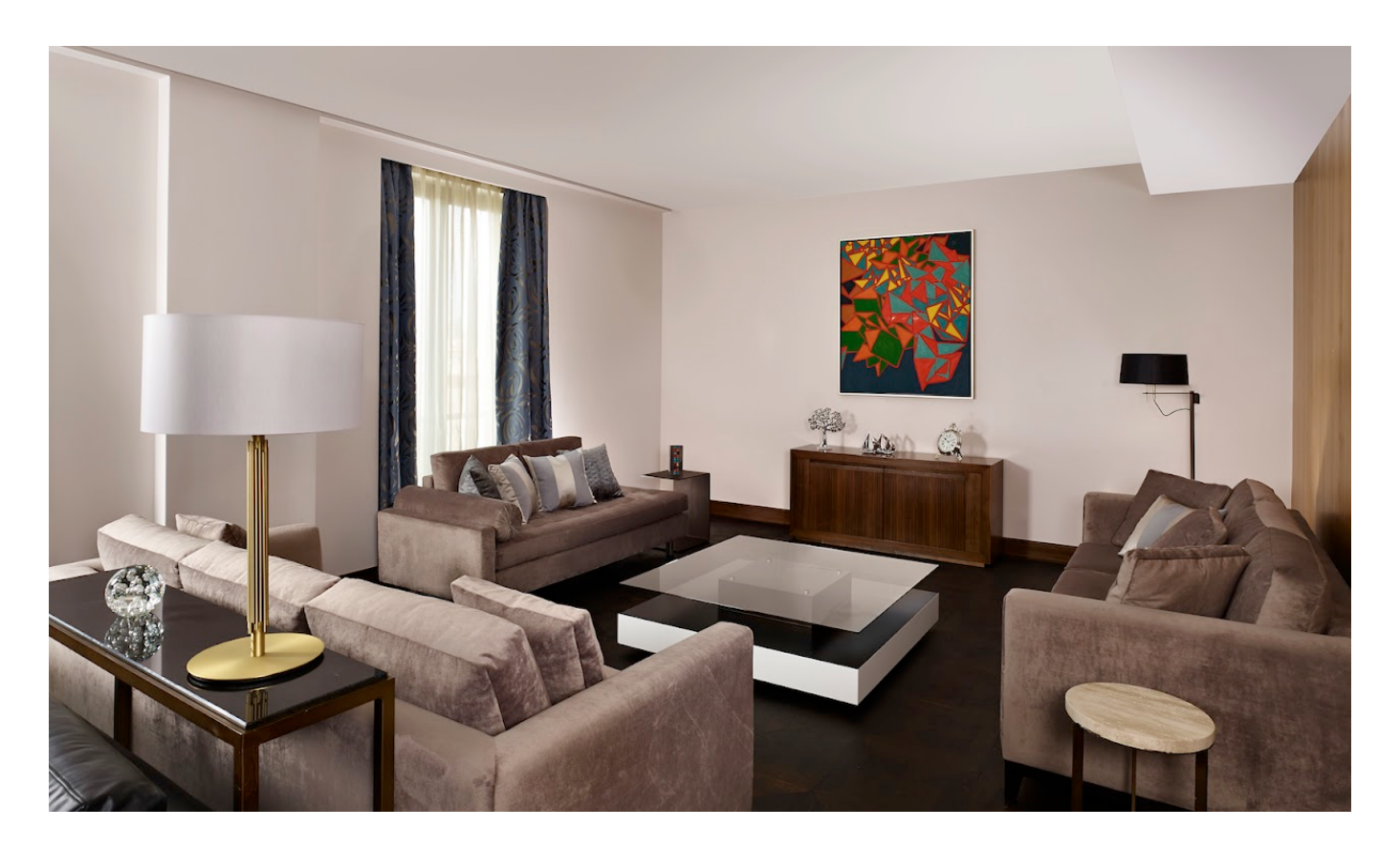
And the Deluxe room: