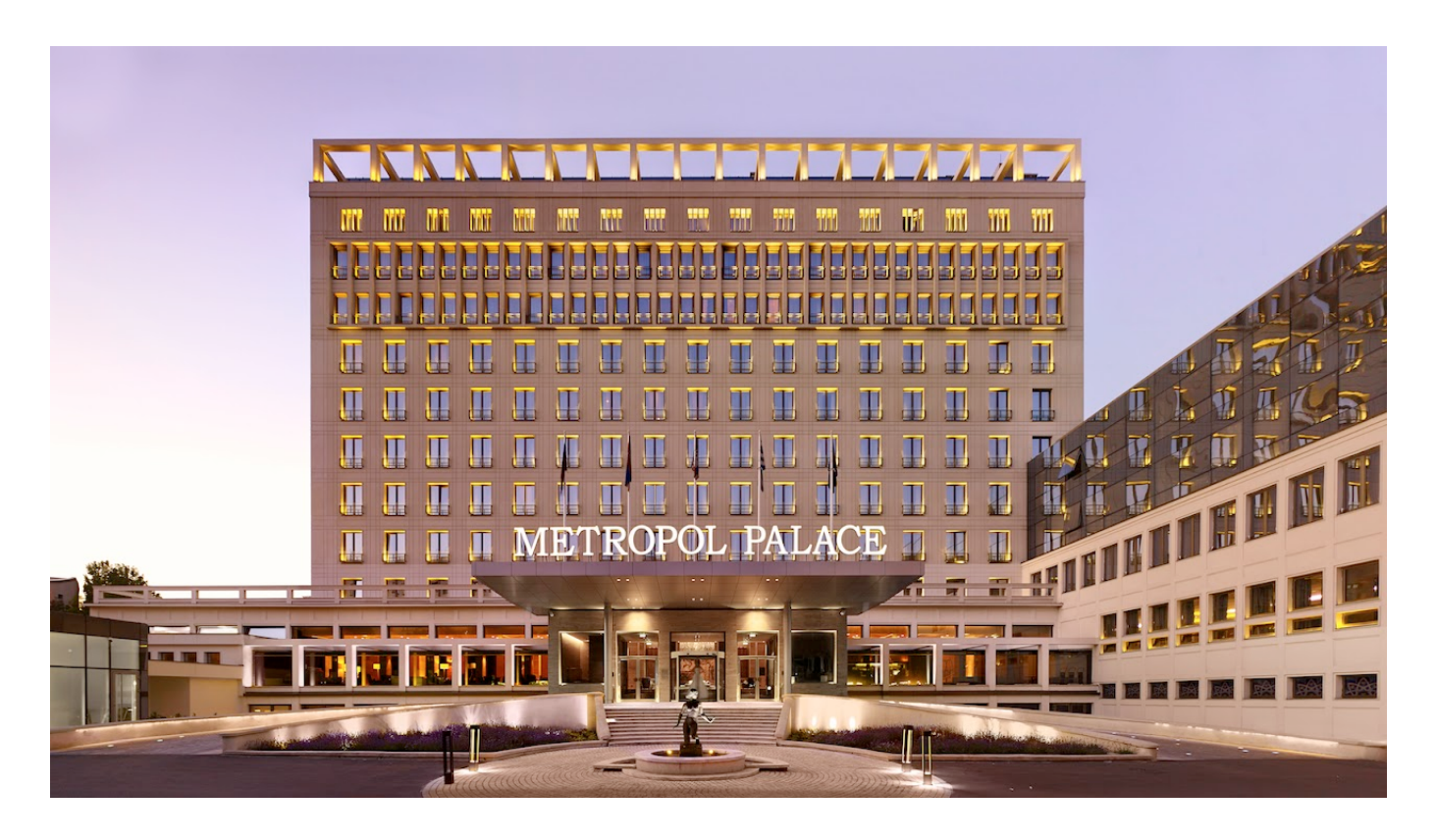
The Metropol Palace is distinctive and unique in its elegance – sporting even a most exemplary indoor swimming pool.

The Metropol Palace Hotel in Belgrade, Serbia, is the country's most famous hotel, with a rich history of hosting state visits and welcoming dignitaries and important guests.