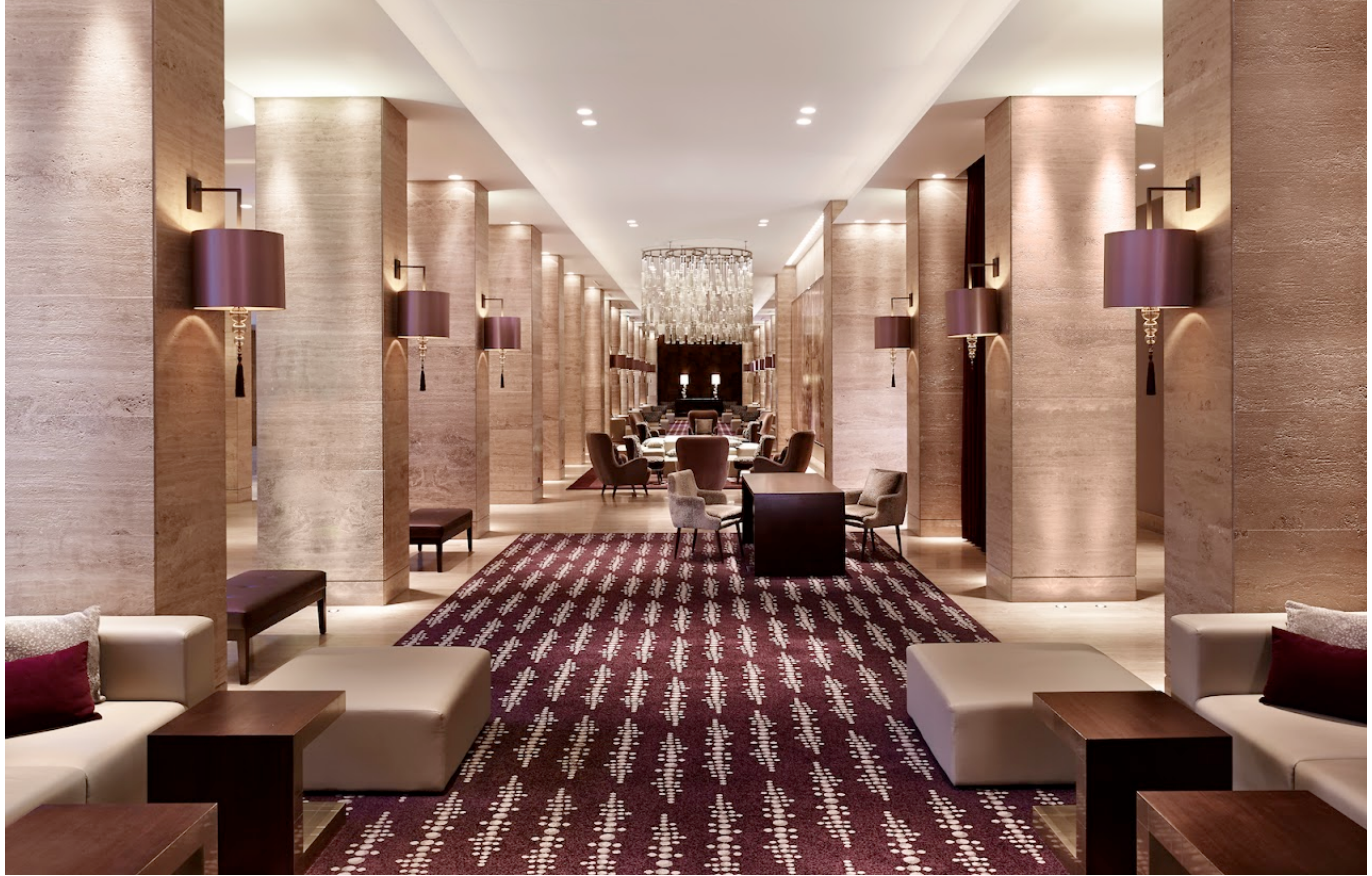
And the restaurant is both attractive and delicious; and more exciting outlets are planned!