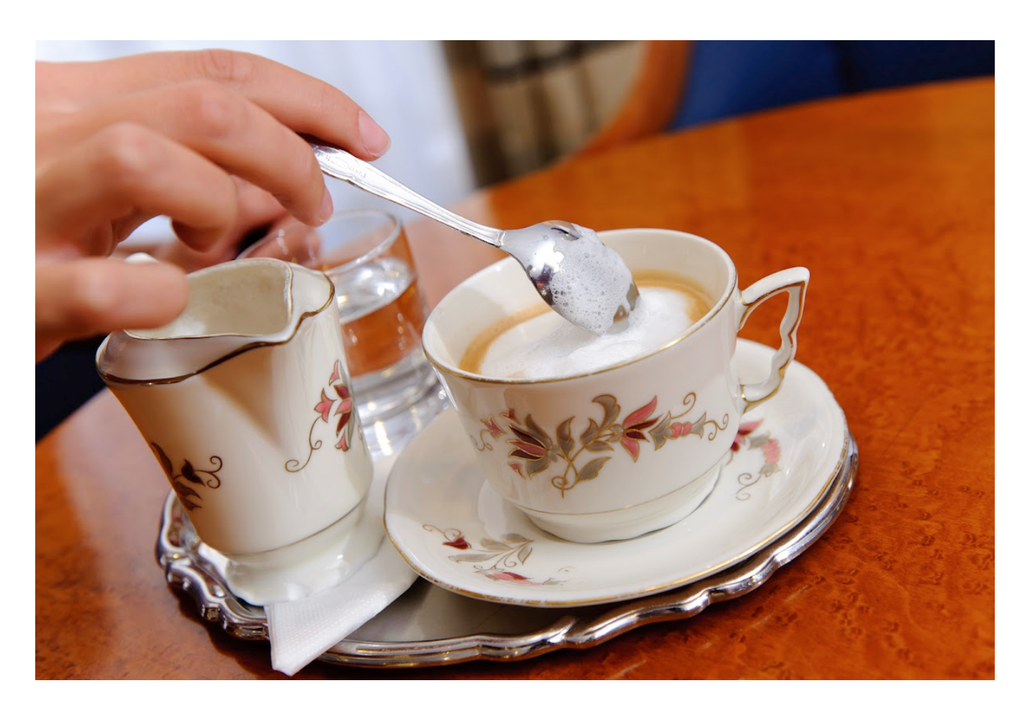
or a little cake...