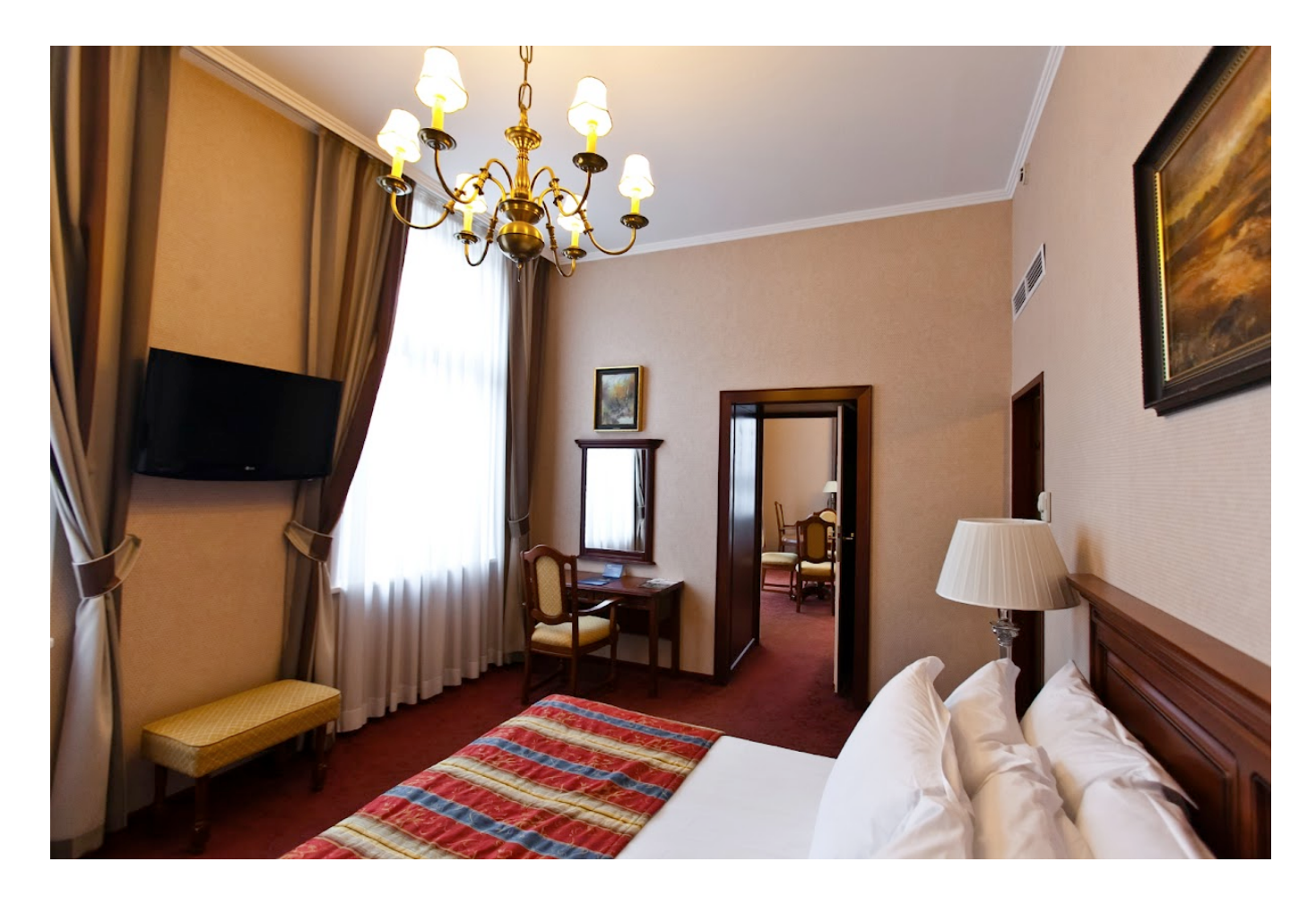
And the regular room is as well!