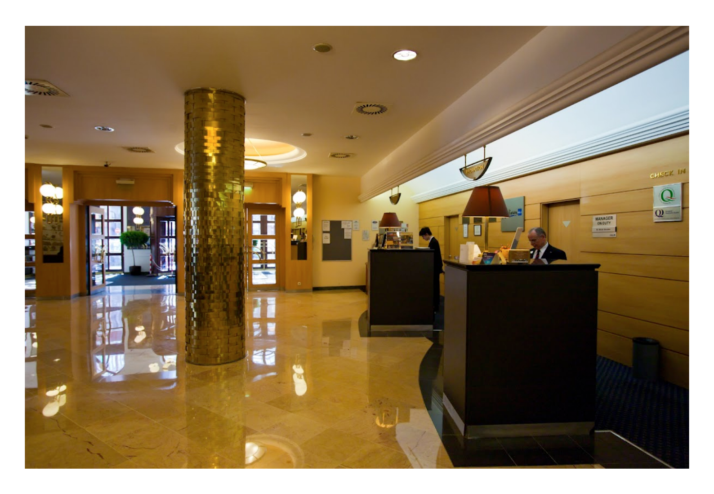
If not for a room, come in for coffee!