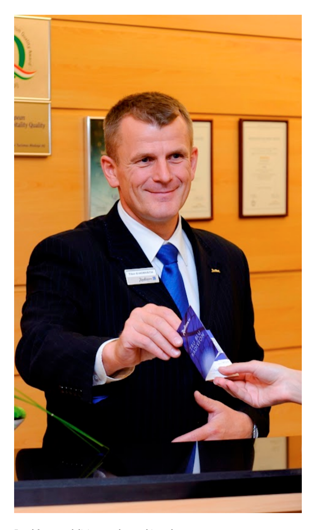
Breakfast was delicious, and served in style.