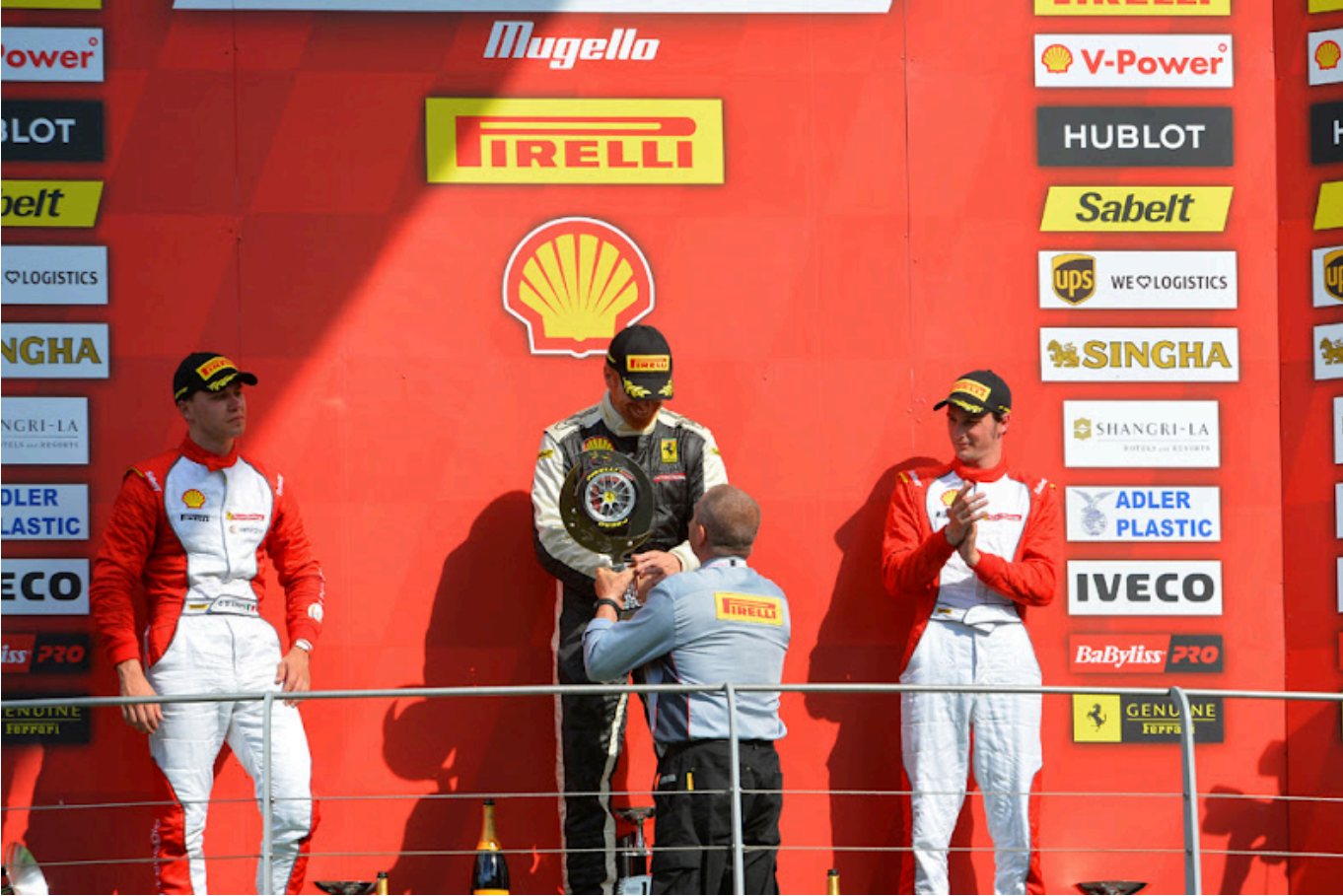
and the Ferrari Challenge,