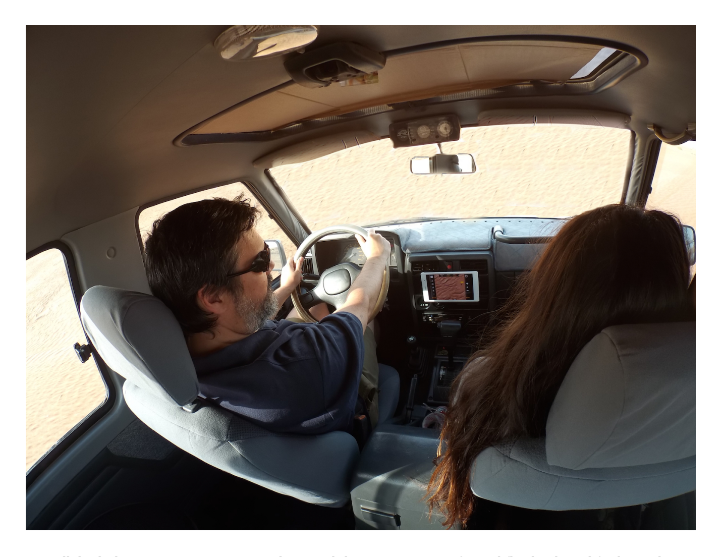
Overall, both the HTC Desire Eye smartphone and the RE Camera performed flawlessly and far beyond our expectations – excellent kit for outdoor adventures!