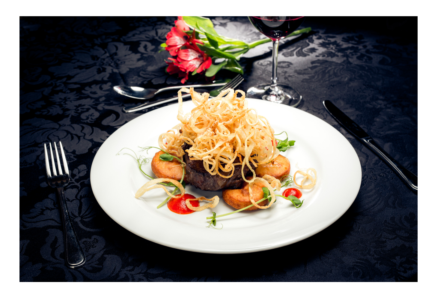
As is the pristine silver service - impeccable.