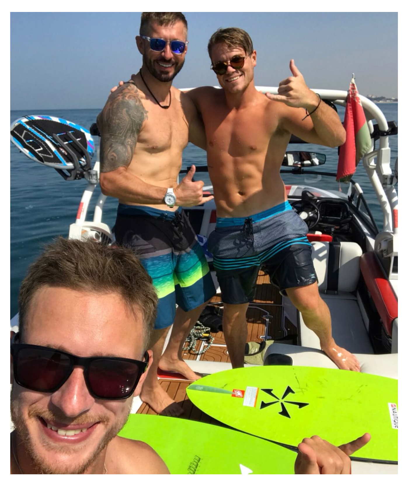
Overall, wake-evolution offers a perfect opportunity to get your adrenaline pumping by trying something new, or to further your skills!