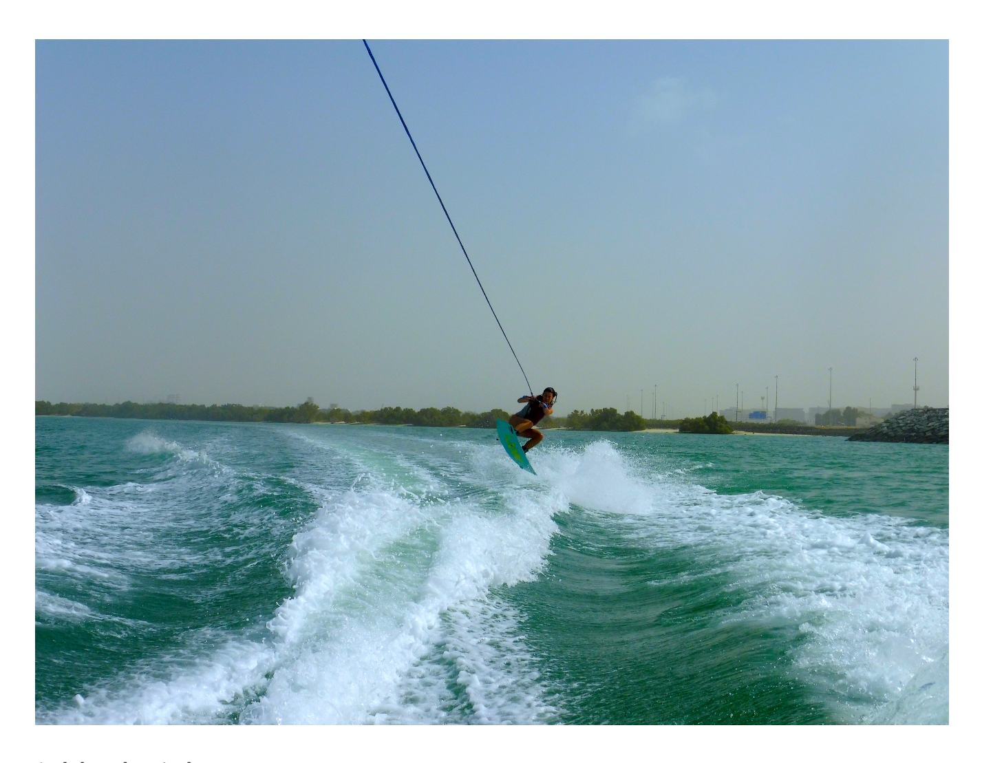
And then there's the pros...