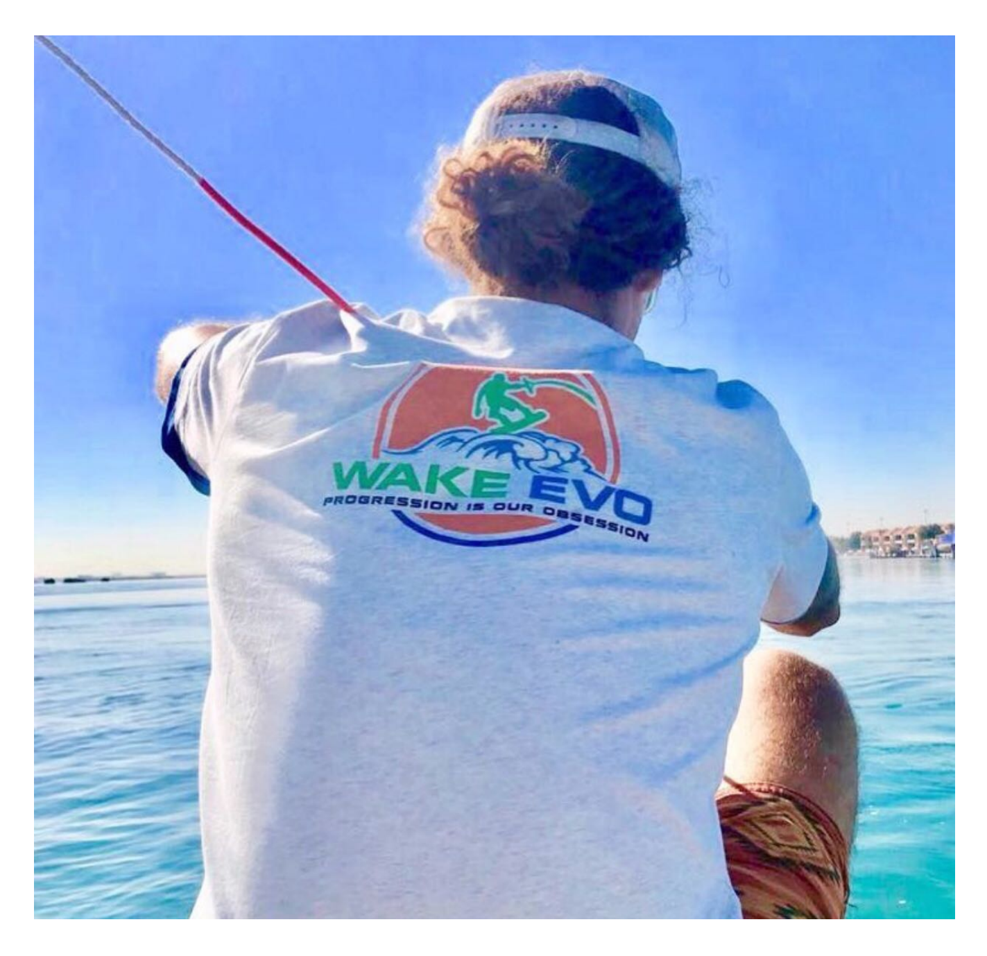
Aside from the enjoyment of the extreme sport, it's also a great full-body work out! Not to mention the uplifting atmosphere Wake-evolution has! Good vibes all around...