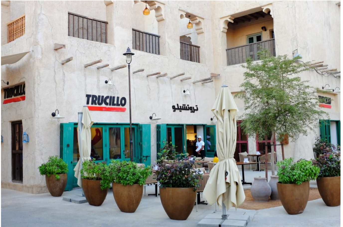
The modernity in equipment and decor complements the heritage feel of the outdoors seating,