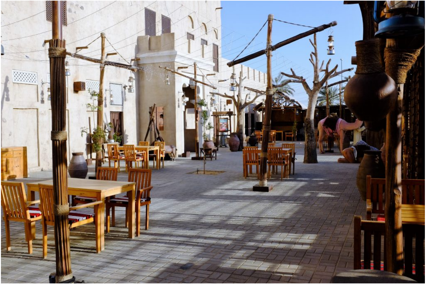
As well as privacy cubicles made from traditional materials