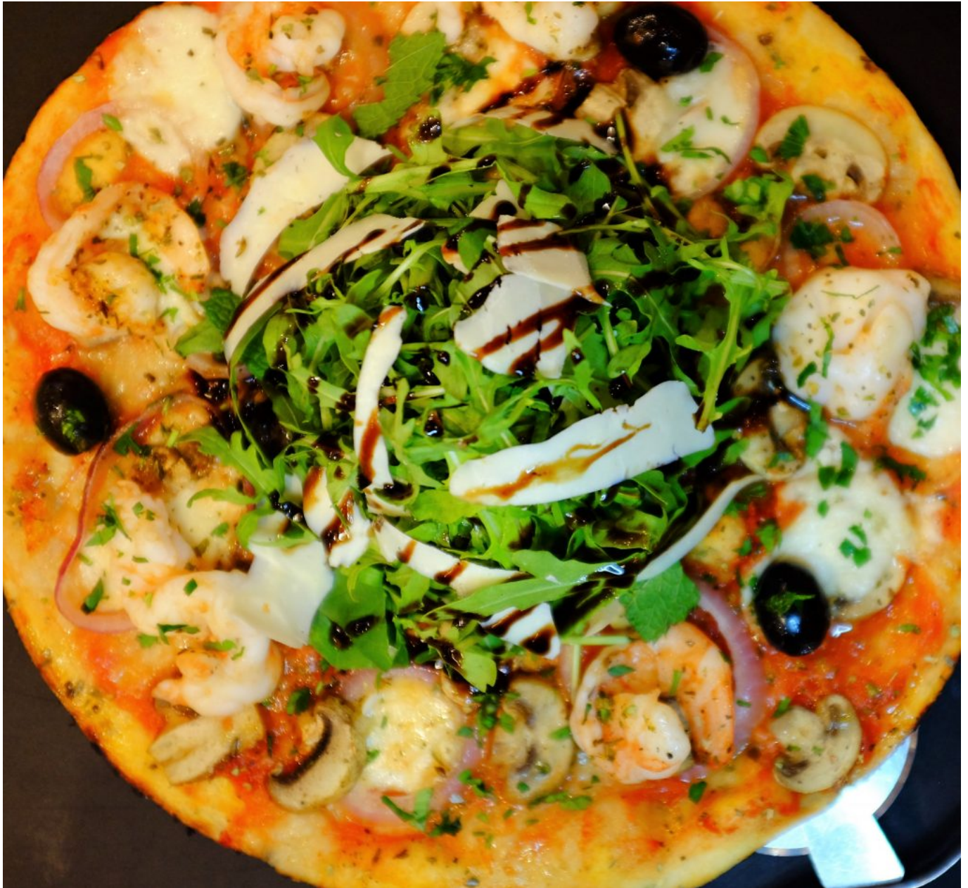
Attention to details are evident, and the taste is carefully developed - pizza crust is excellent.