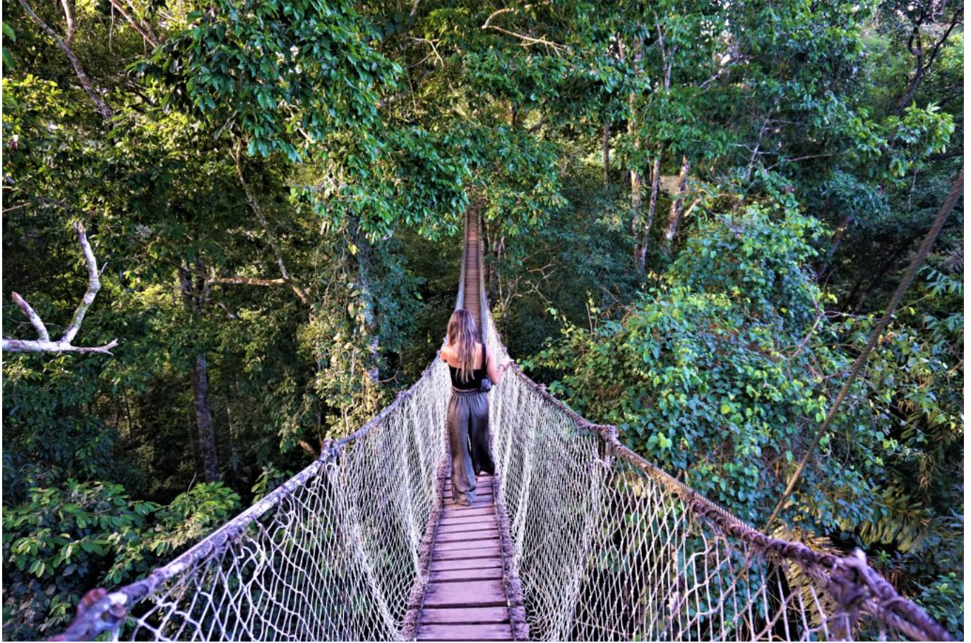
Peaceful, enchanting and educational all in one - the Inkaterra slow travel experience.