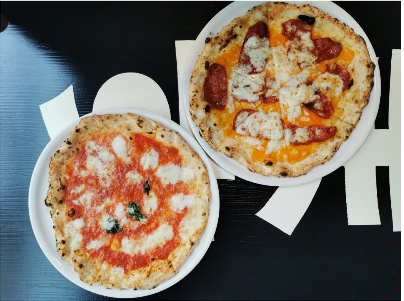
It is Tokyo-style Neapolitan pizza.