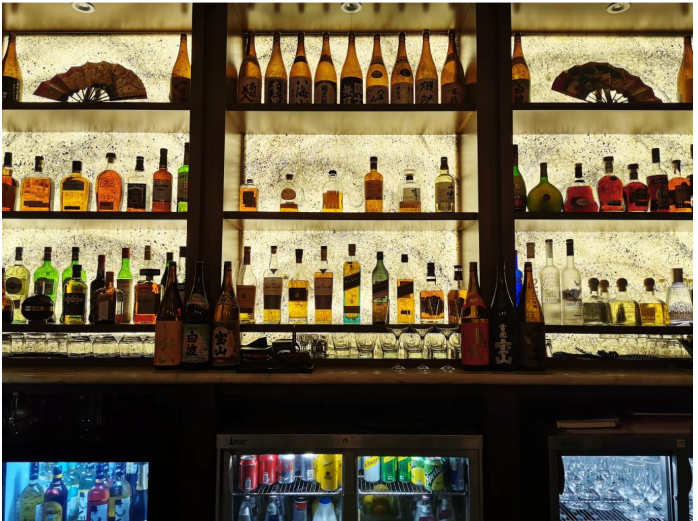
The dining experience is classy, and the service is stellar.