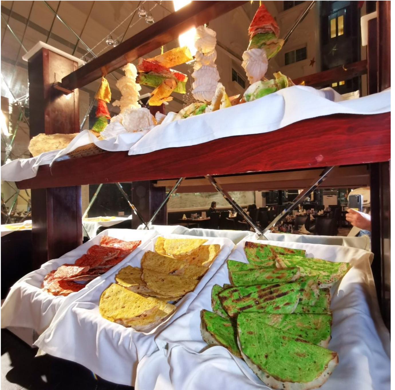
At the table, hot starters arrive, and they are both delicate as well as tasty.