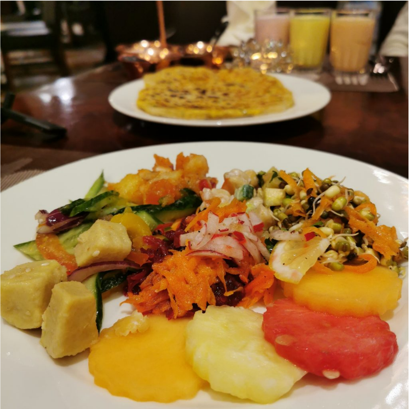
And the mains satisfy fully!