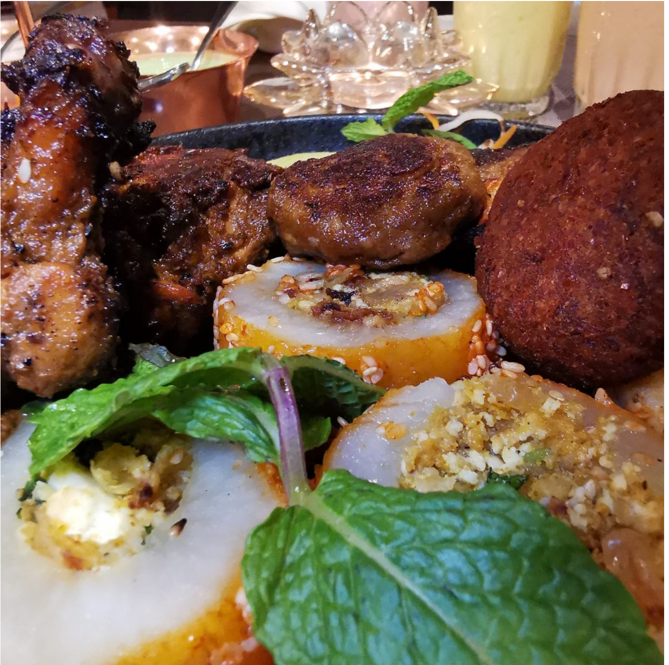
And the platter includes lamb, chicken, and other morsels that just melt in your mouth!