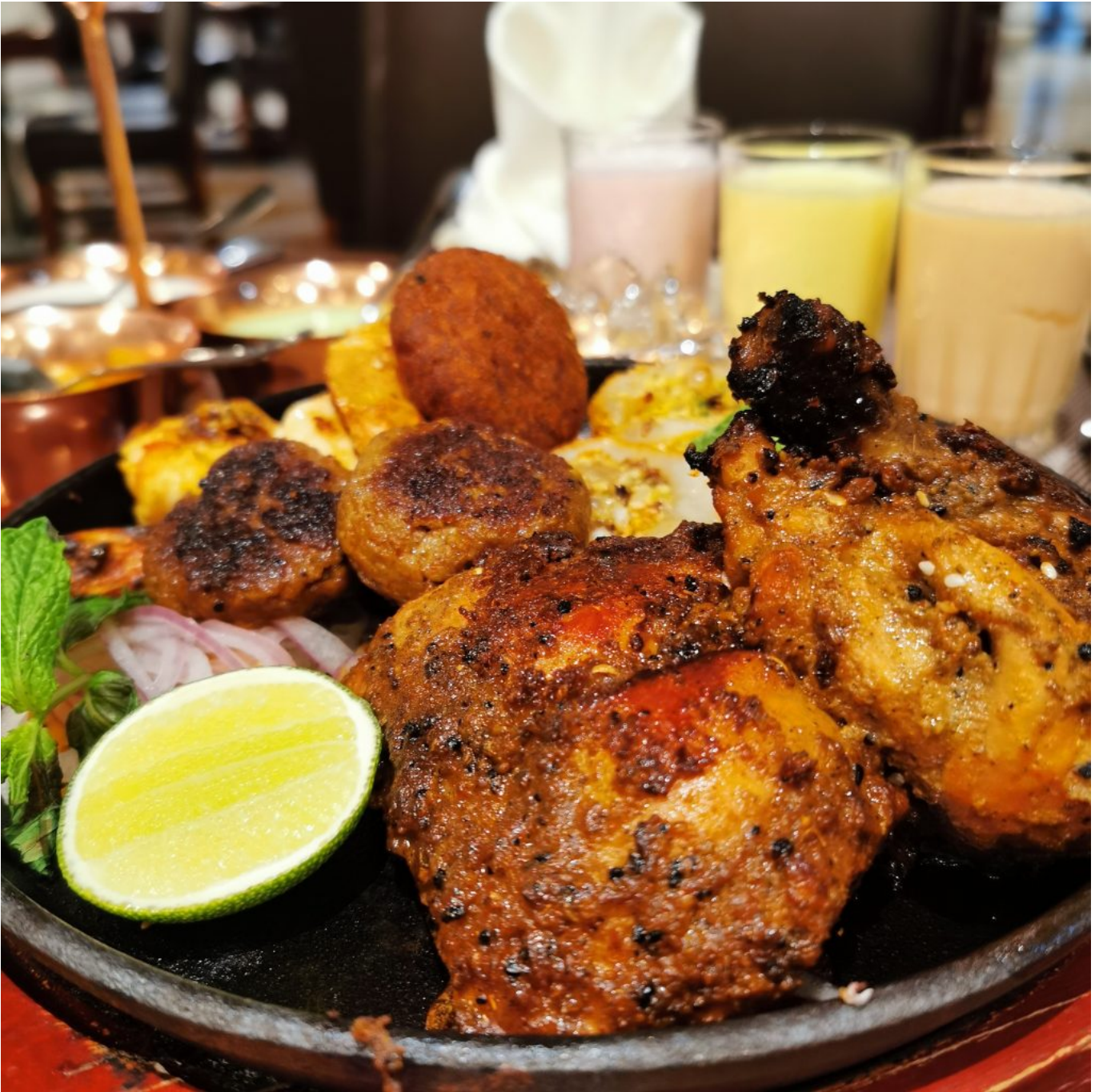
The salad options are interesting and excellent in taste.