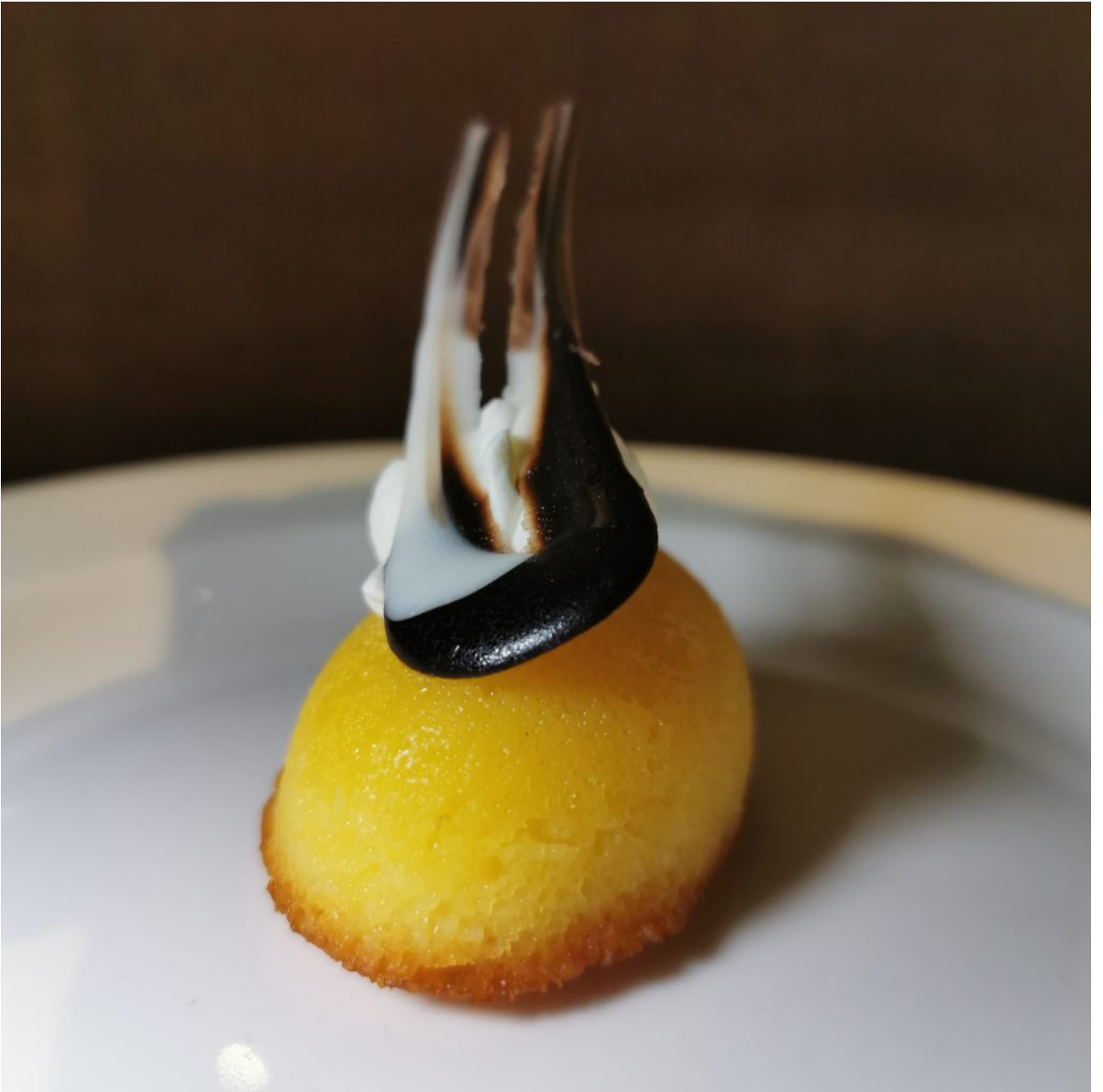
And the world-famous churros !