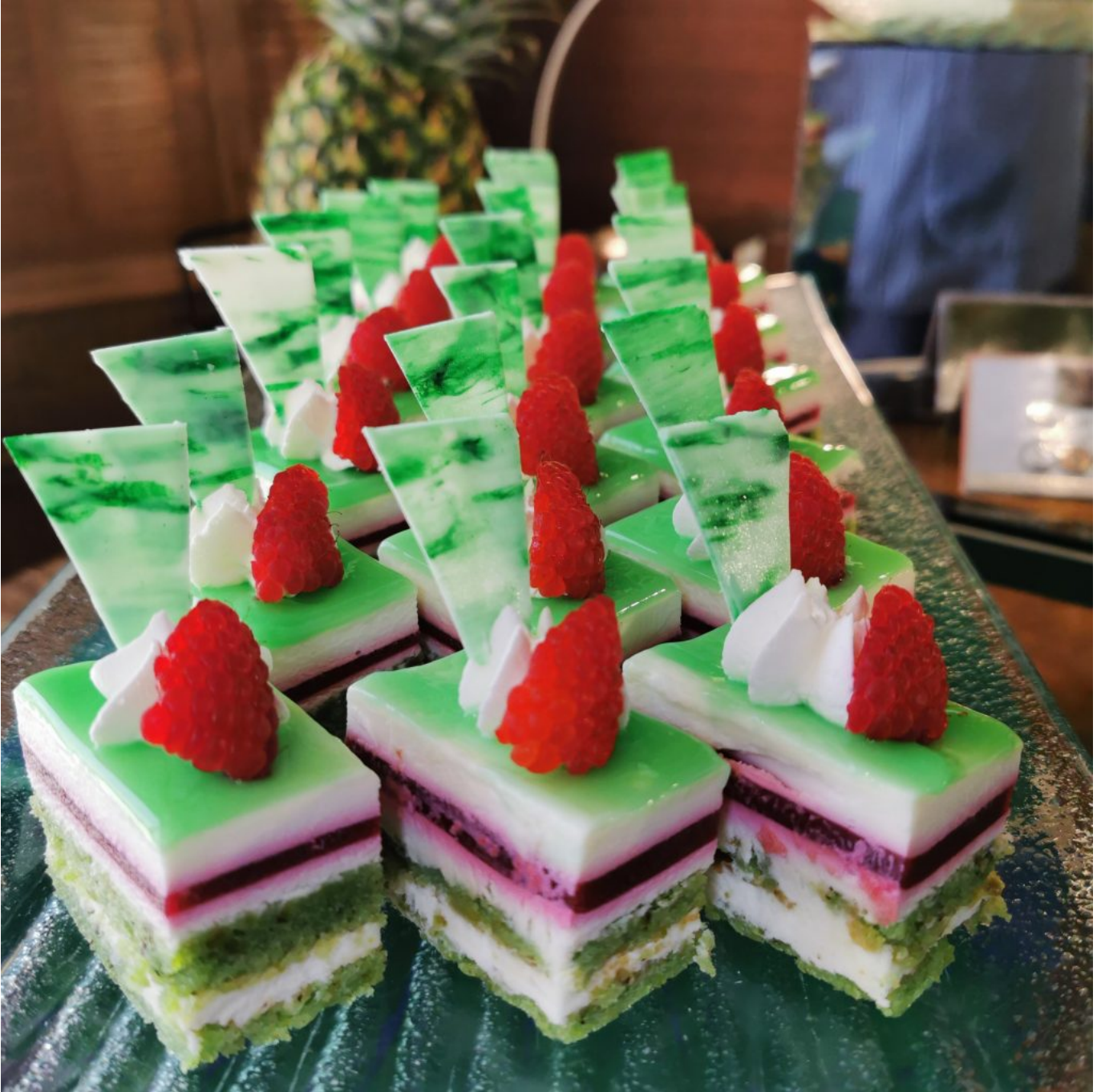
A fabulous selection of sweets awaits those bold enough to still have the appetite required to enjoy international and Brazilian favorites!