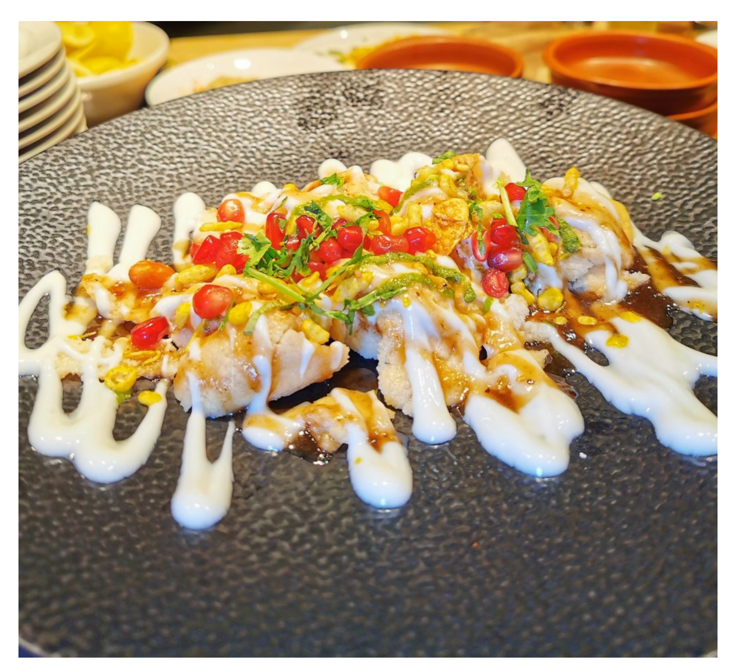
The appetizers proper begin with two dishes that I recognize from Namak - they were so delicious that my taste memory is still fresh!

Absolutely a firework display for the taste buds, the playful combinations of textures and flavors are a wonderful way to start the meal!