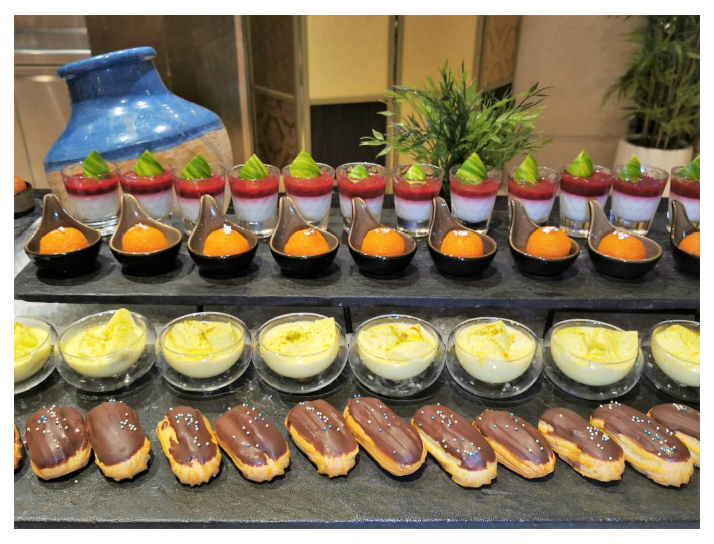
International sweets, as well as traditional Indian delights... just look at this adorable morsel just waiting to jump into your mouth!