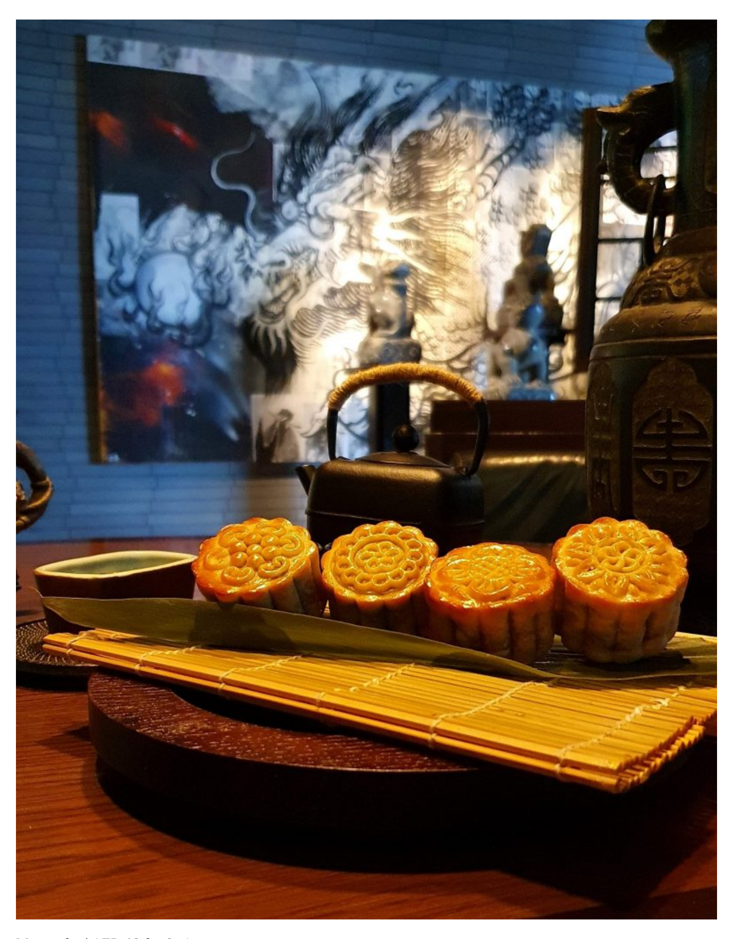
Mooncake | AED 48 for 2 pieces