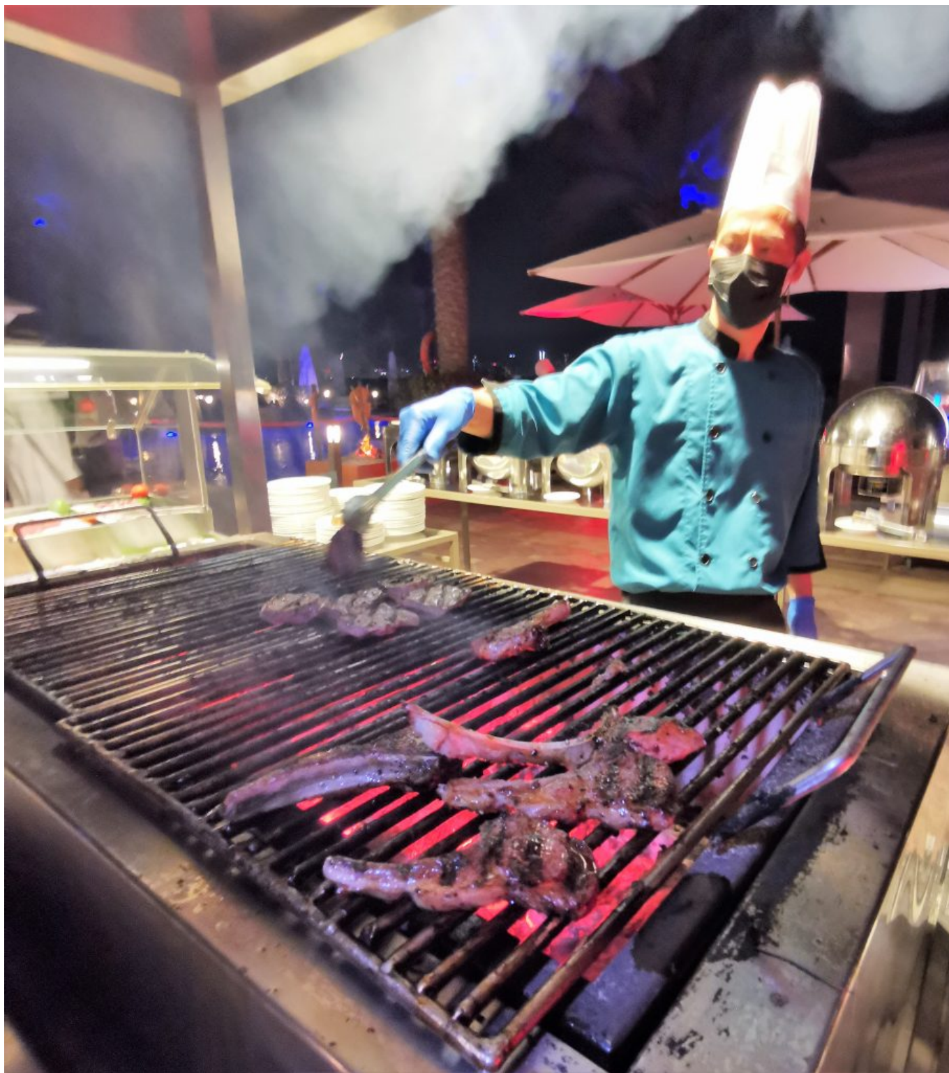
Platters of different kinds of cuts...