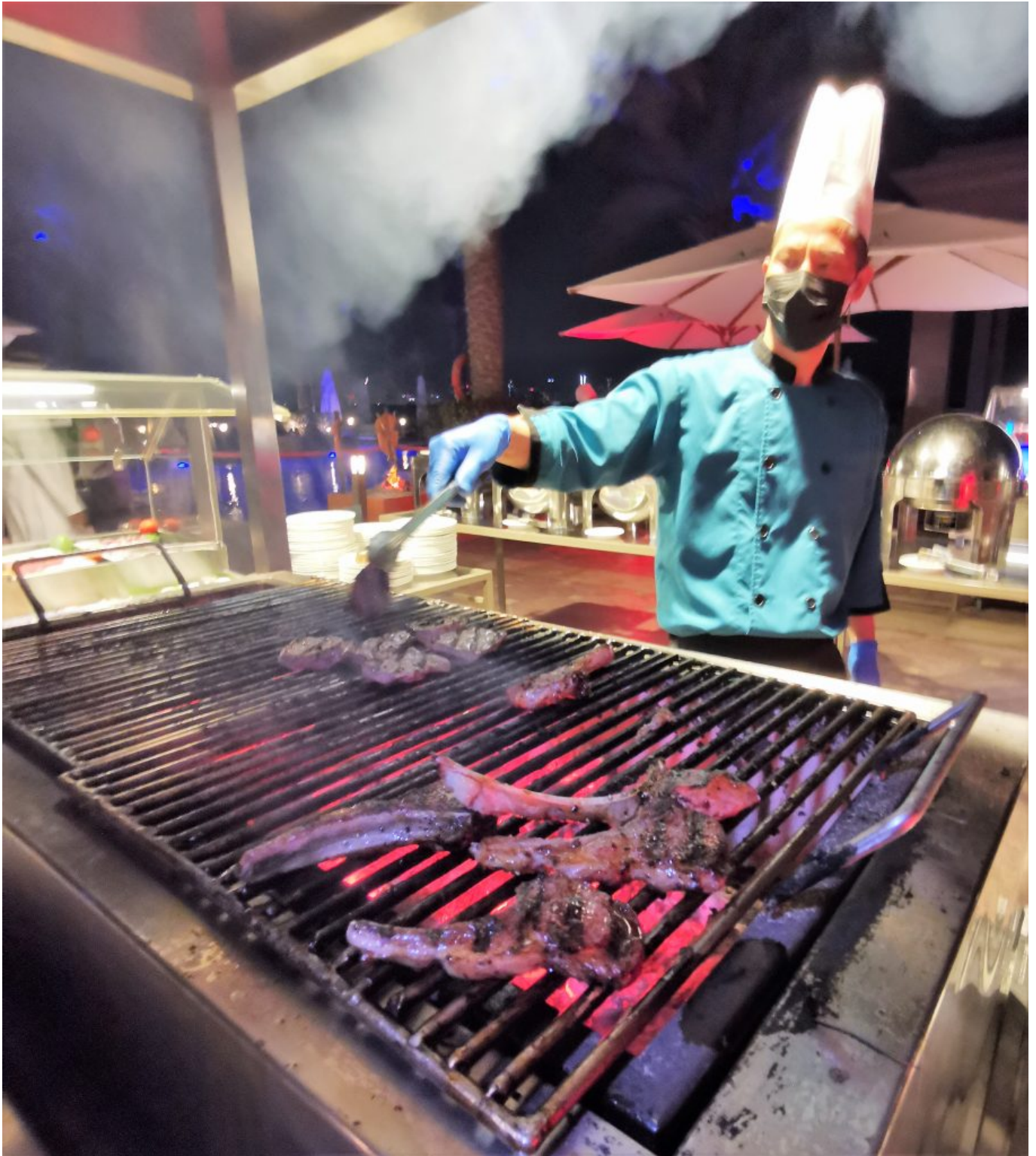
Platters of different kinds of cuts...