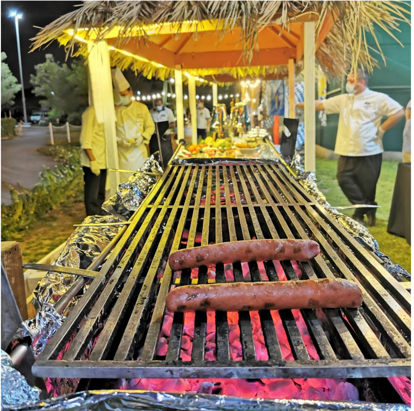
The sausages are on the fire, and fresh draught from the German powerhouse breweries are on tap - just look at that spectacular head on the pint of Weißbier !