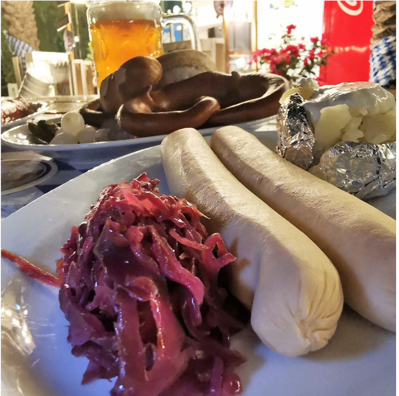
And the beer was of excellent quality, provided by world's oldest brewery: Weihenstephaner.