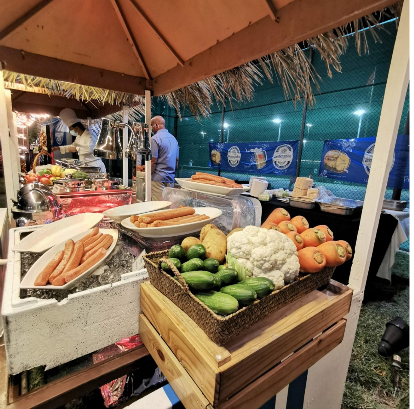
The special menu for the festival is straight to the point, and all the favorites are there.