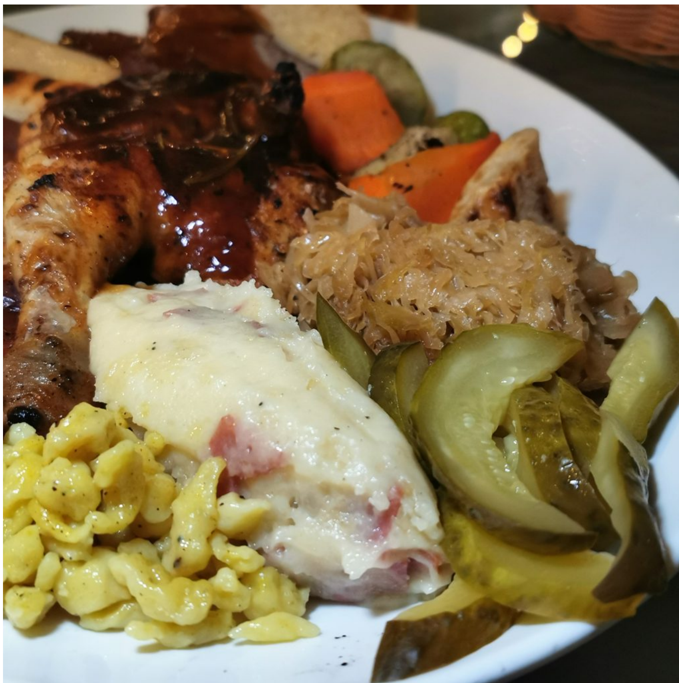
In the center, a juicy fresh-grilled chicken, with delicious gravy; and a few slabs of well-cooked beef, also slathered in gravy,