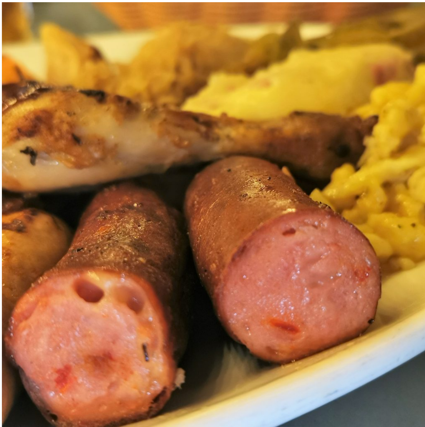
Above, veal; and below, chicken...