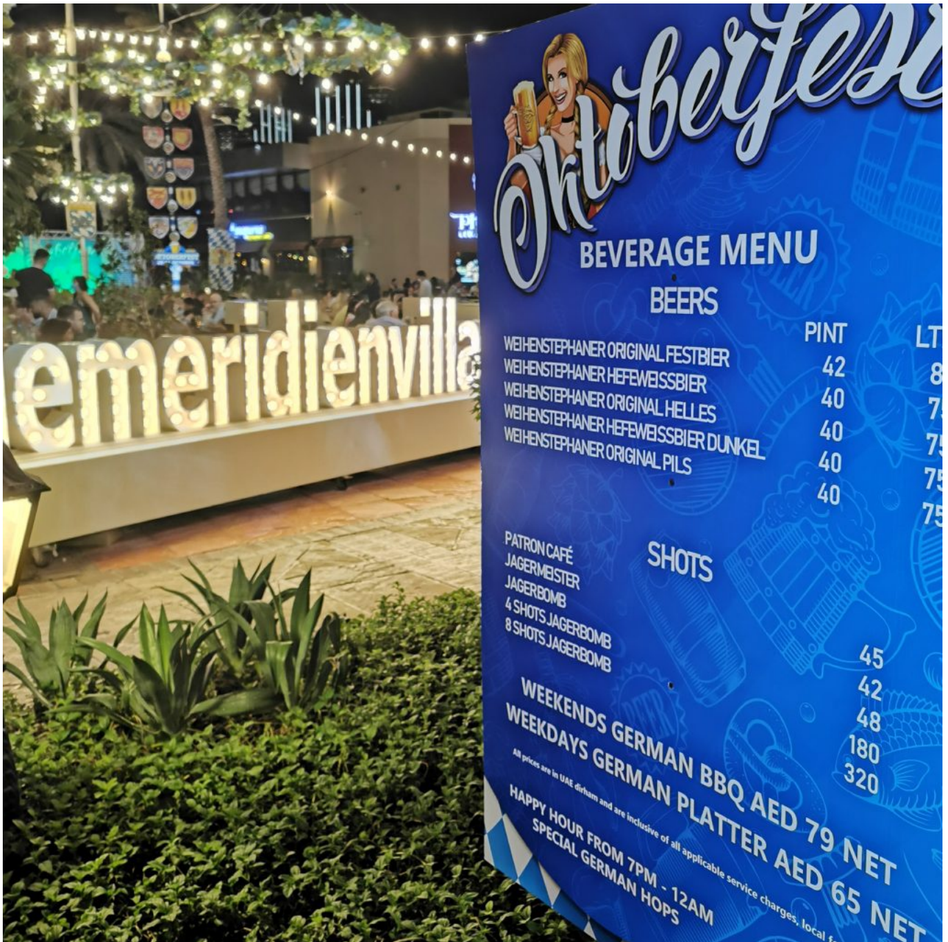
At Le Meridien Village, Abu Dhabi, where festival atmosphere naturally occurs.