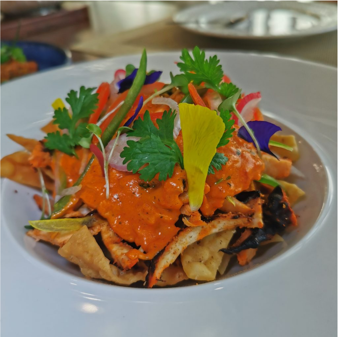
Above Chicken Tikka like you'd never imagine you'd see it, and below a splendid spinach dish - above and beyond expectations, and so much fun!