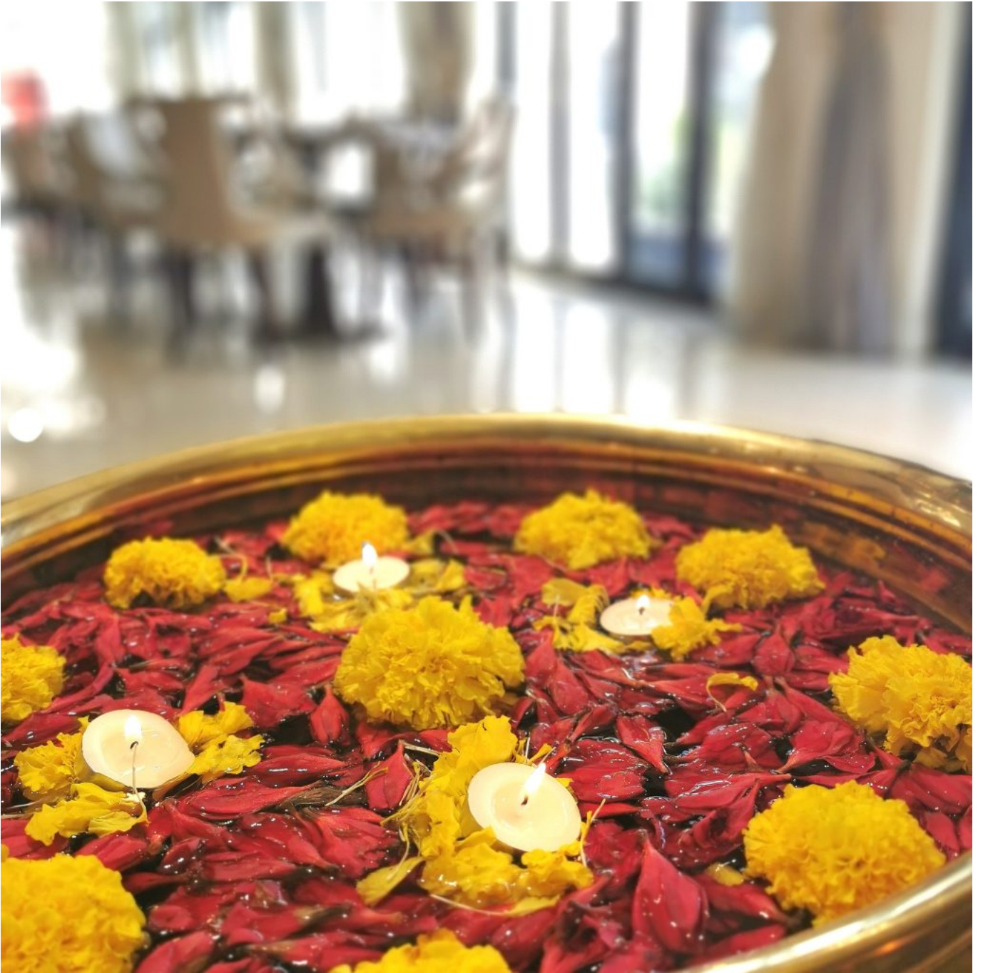
The dishes also were specifically prepared to represent the spirit of Diwali.