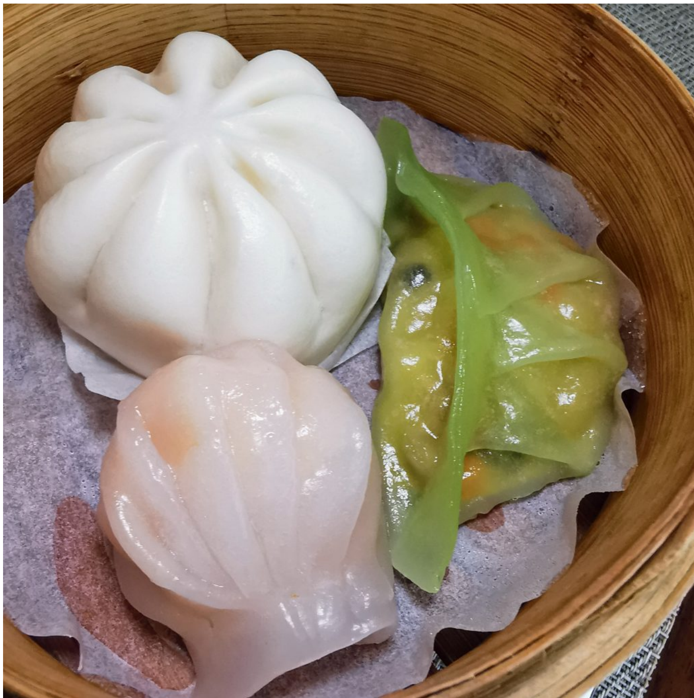
More Sunday Roast - this time roast beef and resplendent greens and peppers...