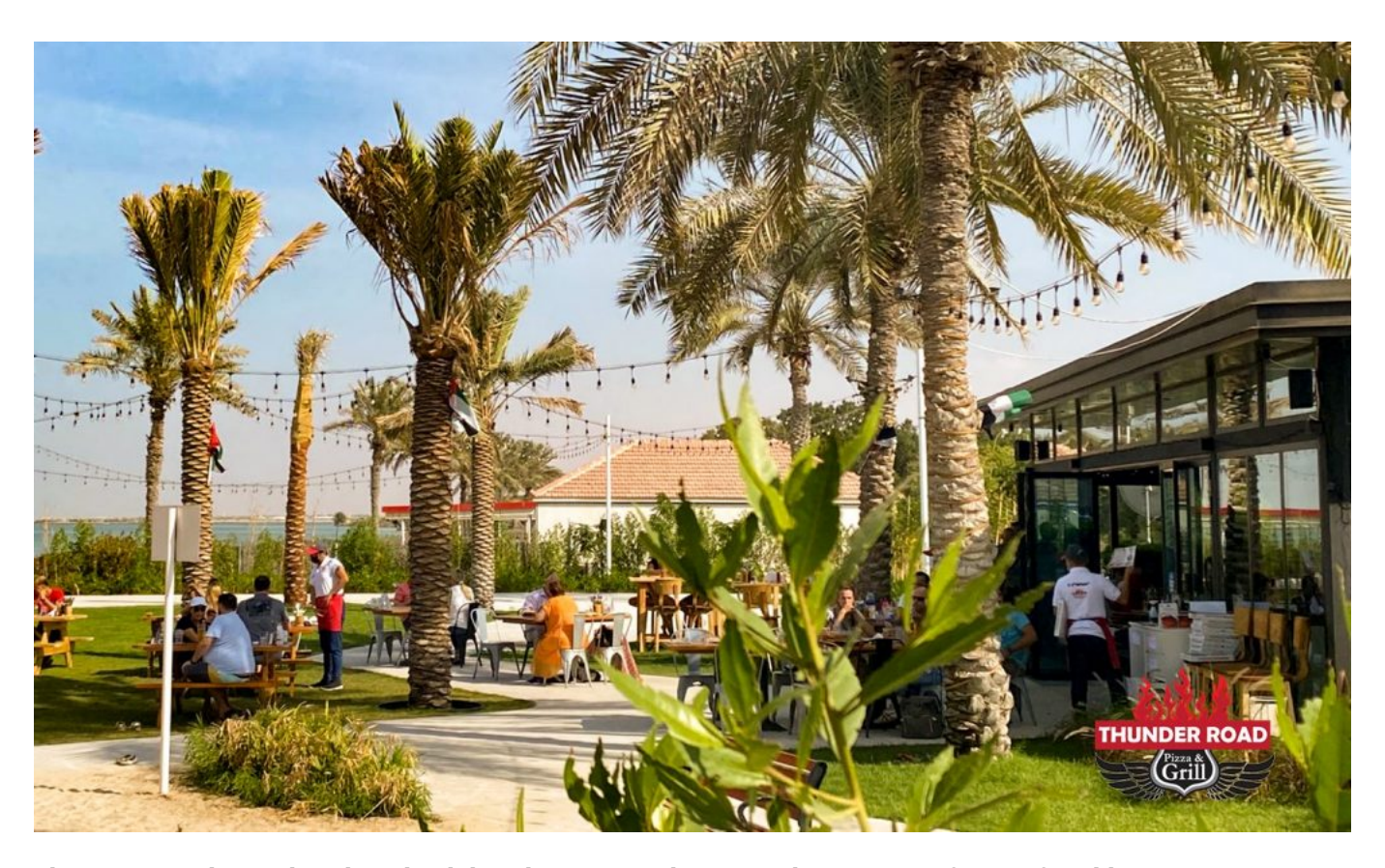
The interior is hip and cool, with a biker theme in its decor – and airy spaces for comfortable seating even in large parties.