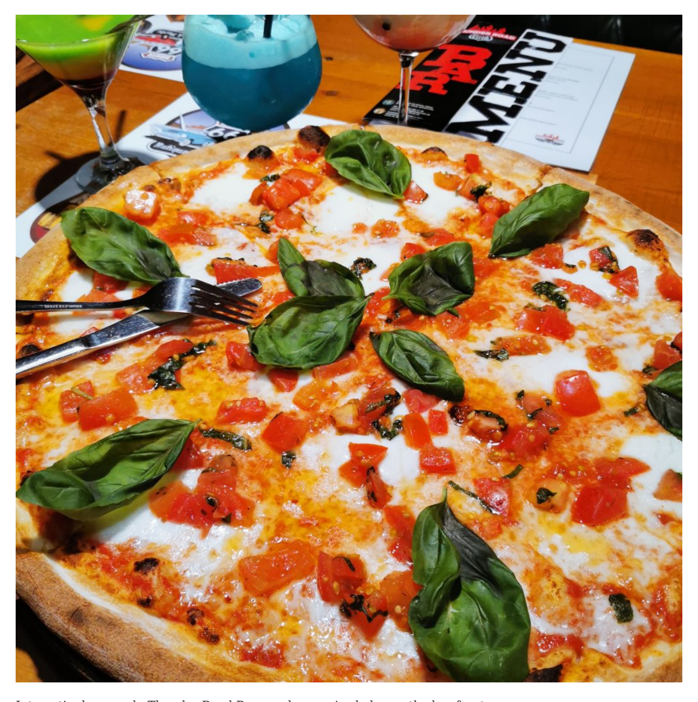
Interestingly enough, Thunder Road Barracuda surprised also on the bar front...

So now we have a trifecta of excellence: ambience, food, and drinks!