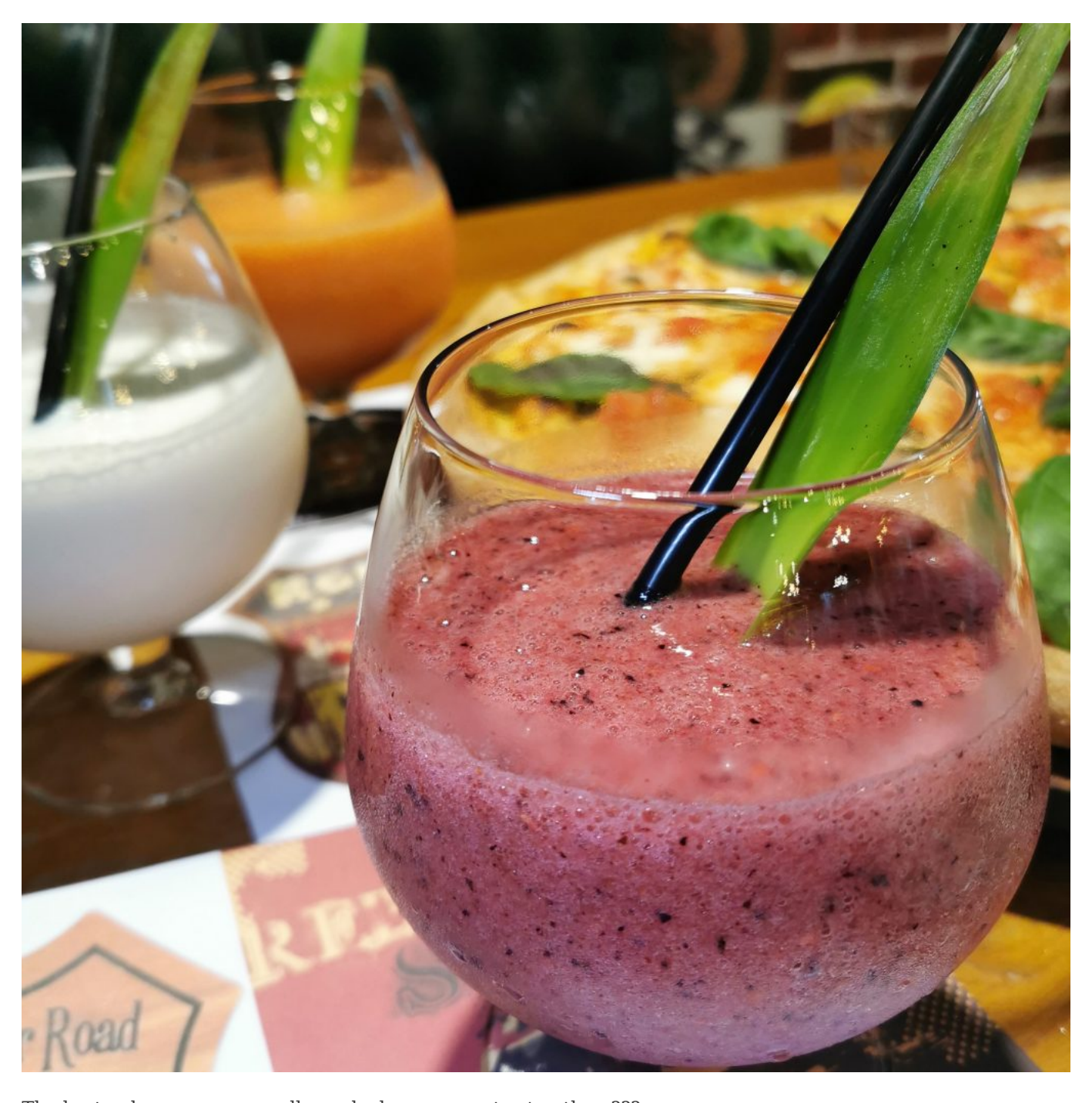
The bartenders were on a roll - and who were we to stop them???