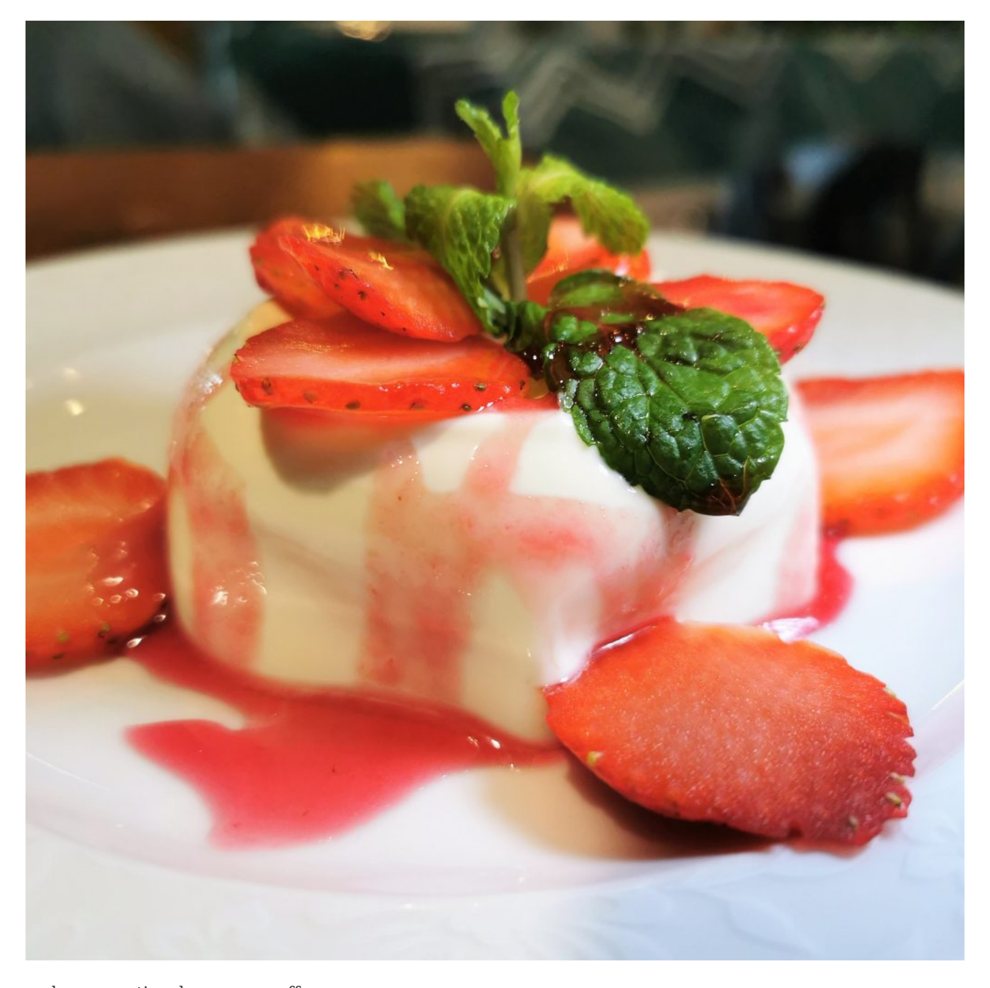
and an exceptional espresso coffee.