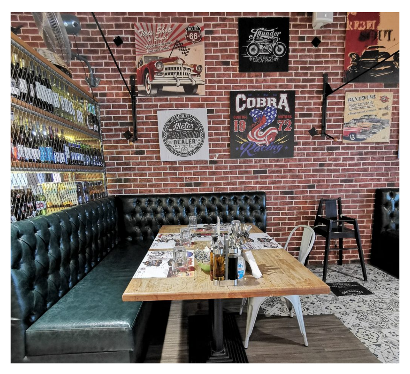
It's casual and welcoming, and designed to be much more than a restaurant – more like a destination attraction for time well spent with friends and family: just add your own laughter and good times!