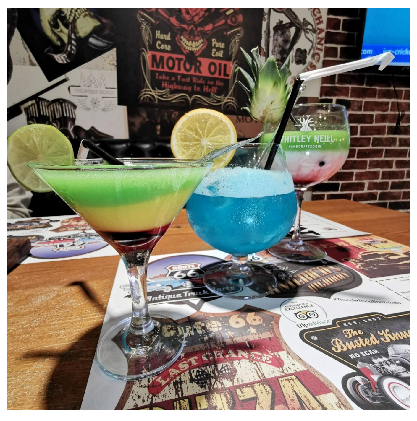
Creative and expertly mixed, Thunder Road Barracuda delivered at very high level of cocktails – probably influenced by prestigious neighbors!

All in all, either in for a full meal or just a snack, Thunder Road's barmen have your back covered.