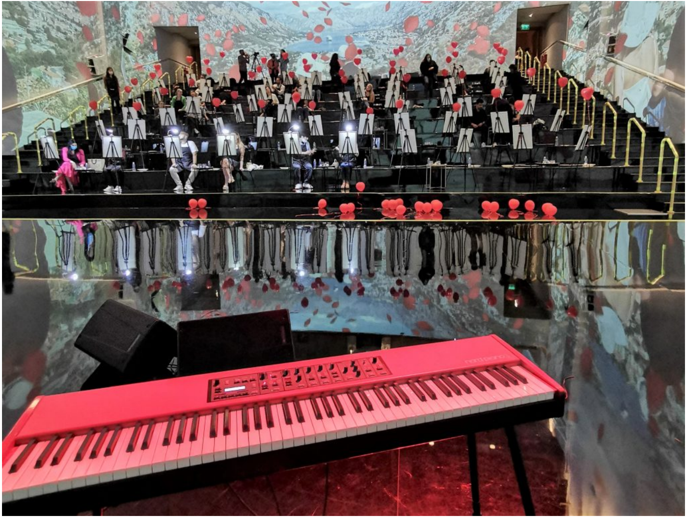
A gorgeous voice, known misteriously as @akmo_art, serenaded us all evening!