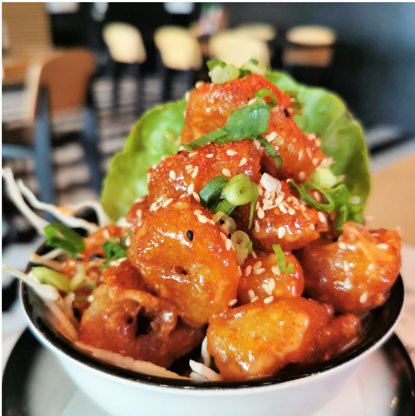
Above, the Atomic Shrimp, and below, the Guac and Chips - classics!