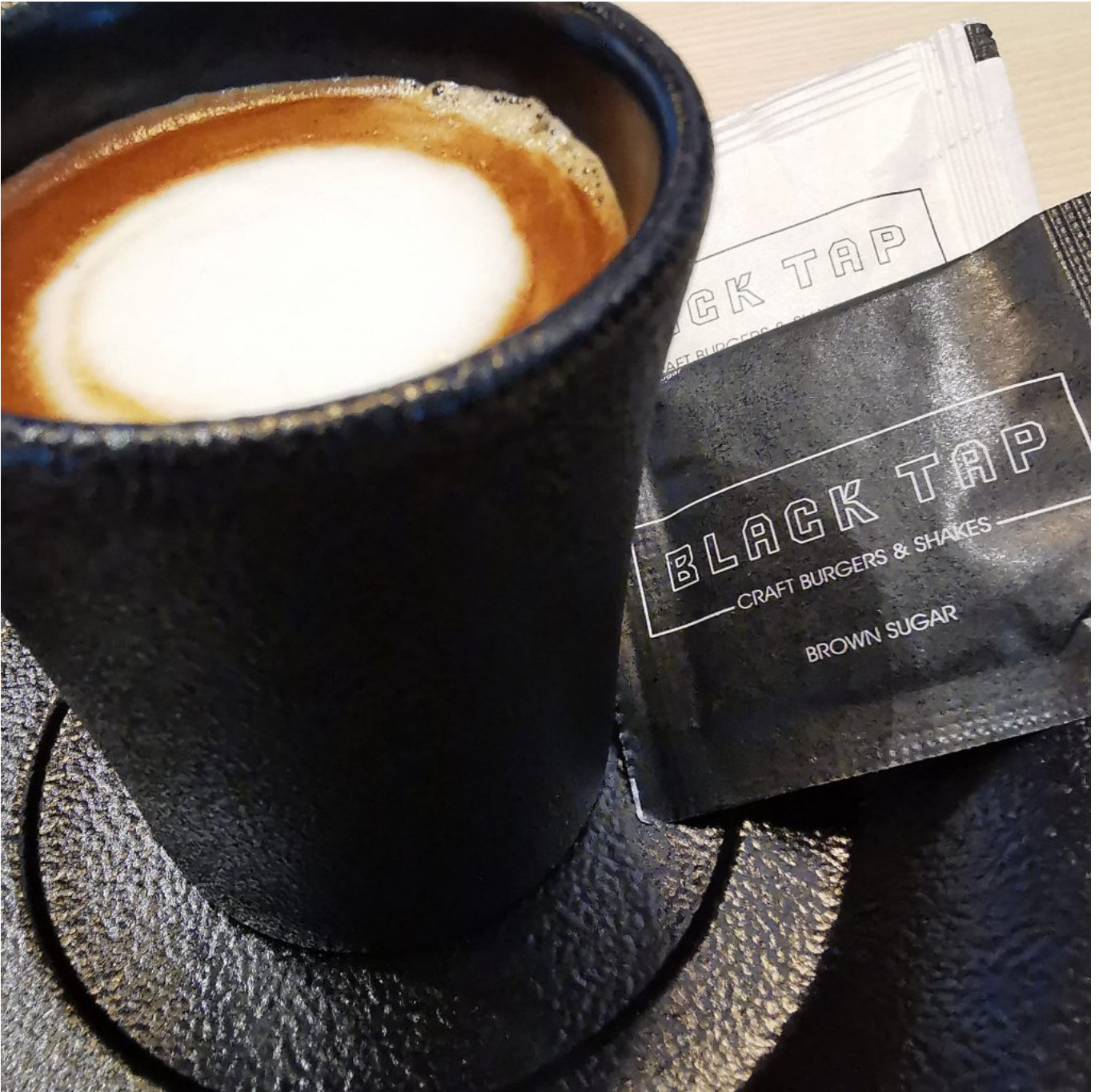
While dining in an attractive restaurant space in a prime location...