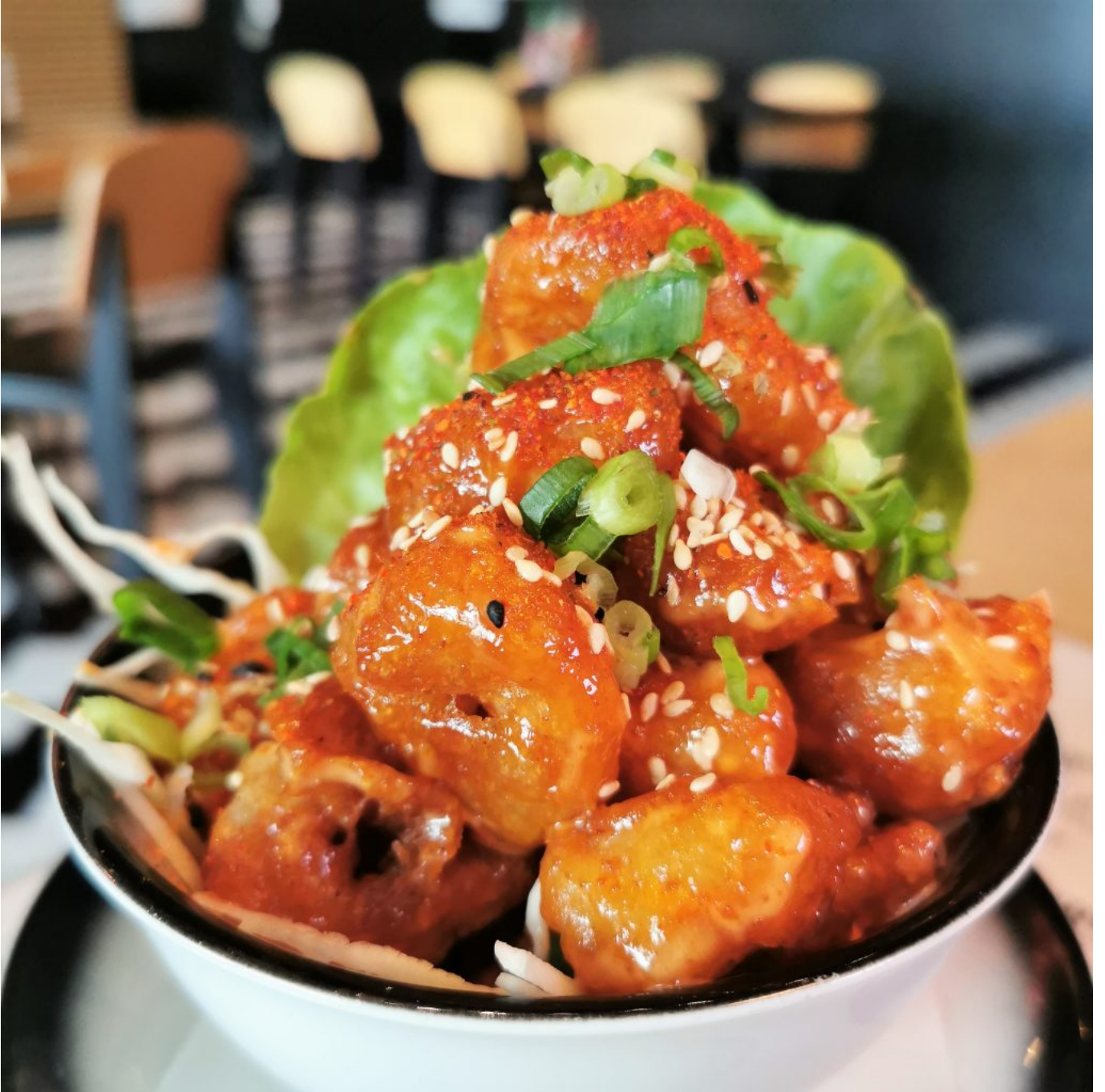
Above, the Atomic Shrimp, and below, the Guac and Chips - classics!